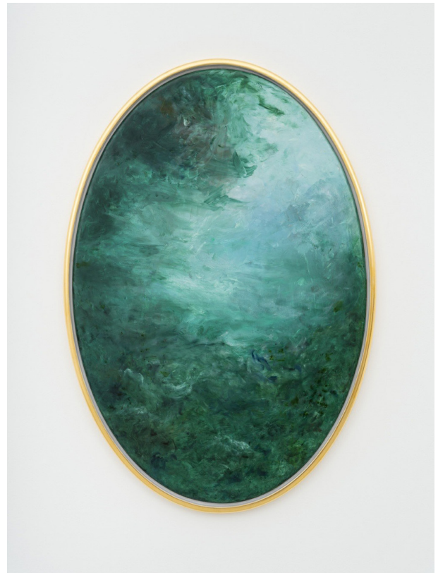
Bon Voyage , Shaun McDowell, 2025, Oil on wood panel, 93.5 x 64.5 cm.

or in the Roman countryside, shifting between Bernini's urban grandeur, and the classical idyllic depictions of Lazio's nature. McDowell's plein air practice and adaptability, mixed with his clear appreciation of the past Masters generate little metaphors of Life and Nature. Each piece opens into space, where light, shadow, and form emerge through tension. His work exists between eras, grounded in tradition yet wholly of the present. This exhibition merges the contemporary with the classical; modern in language, timeless in theme.