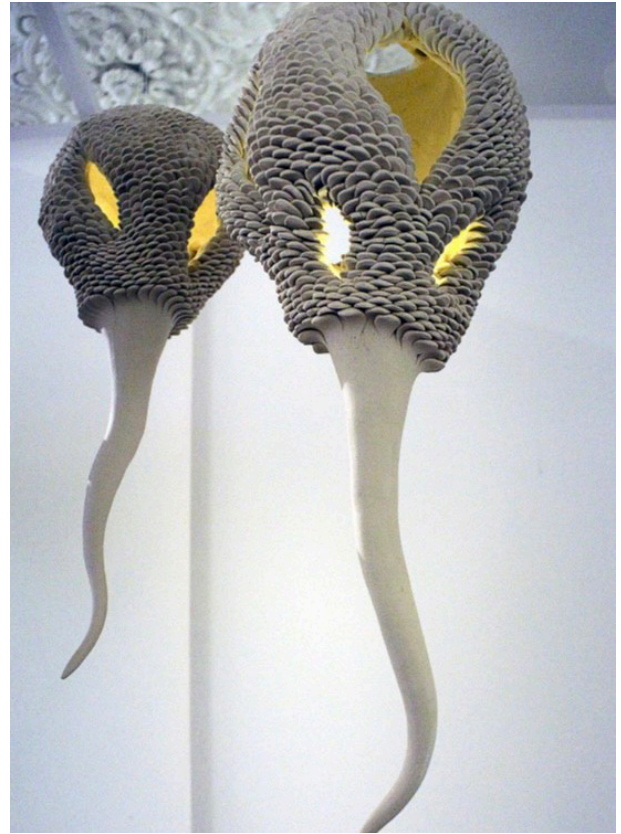
The Colony , India Leire, 2025, Faience, electrical light, fishing thread, Variable dimensions.

Not only do Leire's installations create an oneiric world where Nature and tales merge into a bucolic oxymoron of Humanity, they inspire profound introspection. In that respect, works such as Symbiosis , Equilibrium or 3031 recall the strange reality of human existence within the natural world, rooted in contrast and yet in osmosis, precarious and yet well-grounded. This Human existence that is also reflected in Lotus , as maybe the ultimate metaphor of the "Origin of Life" or as Gustave Courbet would refer as "The Origin of the World", is layered in a suspended fragility that we