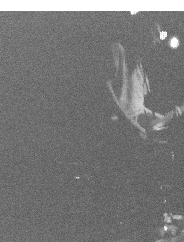
milly, nov. 2024 @ the observatory, santa ana