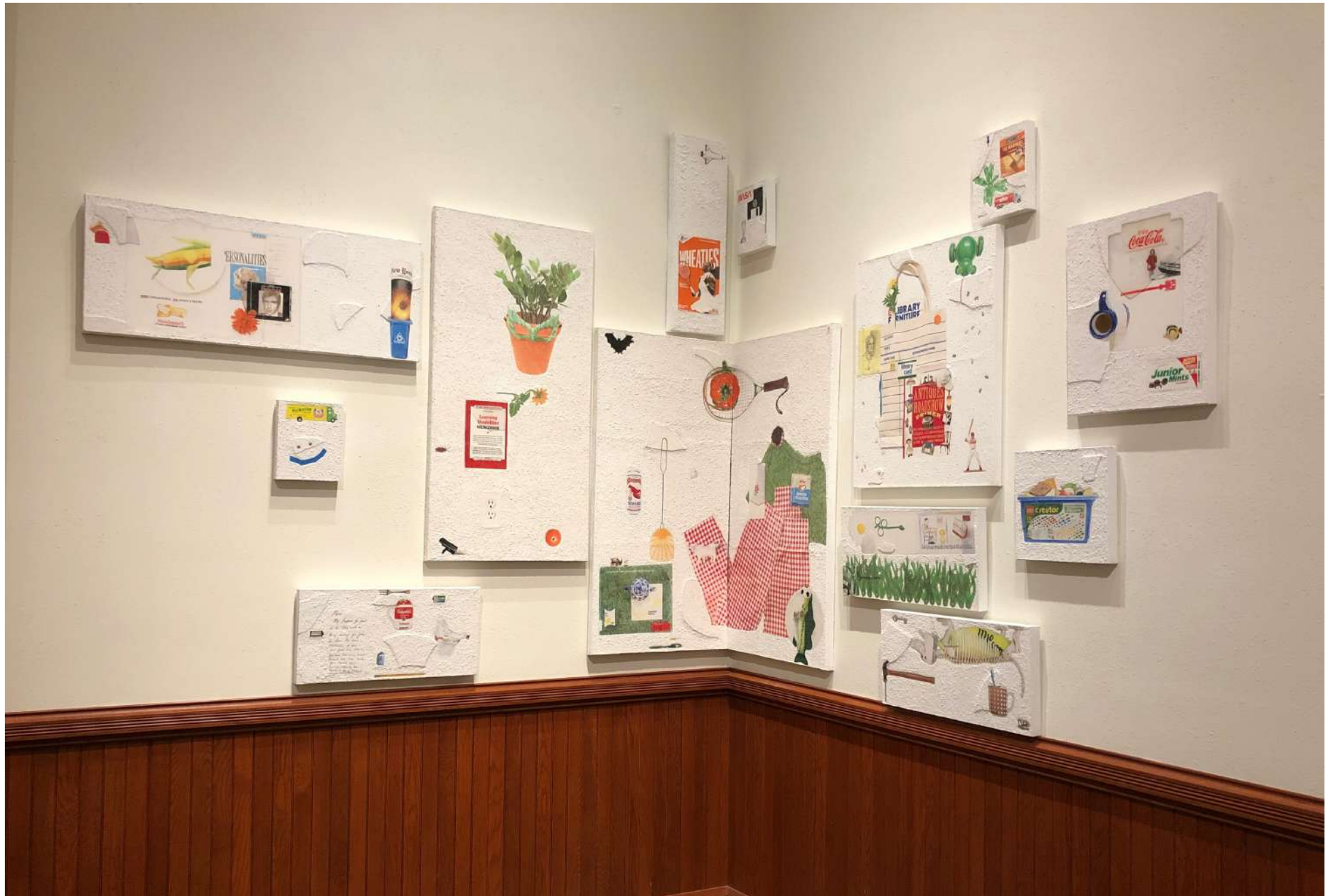
Julia McGehean, Shelf Life of A Memory , mixed media (solvent transfer, colored pencil, acrylic, sand, Plexiglas on Bristol mounted to canvas, 14' x 10', 2020