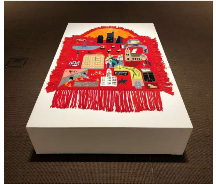
(Left) Tabitha Arnold, October , 34"x 56", tufted wool rug, 2018