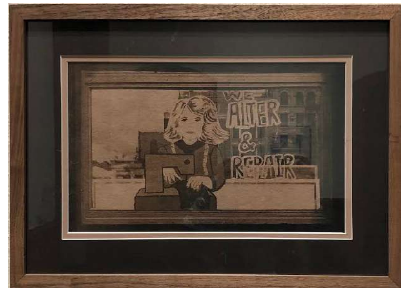
Doah Lee, We Alter and Repair , 11" x 15.5", gum bichromate over cyanotype, 2019

My studio process integrates diverse aspects of printmaking, textiles and installation elements into the format of painting. I dye my own fabric, iron and hand sew the digitally printed textile images, screen print along with drawing, painting, and finish with layering various images on top of the other. This creative process is a response to my experience of the complex nature of the two different environments, such as the politics of education systems and cities both foreign and familiar. My work is about reconciling all the fragmented and conflicted identities into a hybrid format by manipulating the full range of languages from sophisticated pictorial tools to the use of all the ingredients of childhood materials and cute, naïve and uninhibited ways."