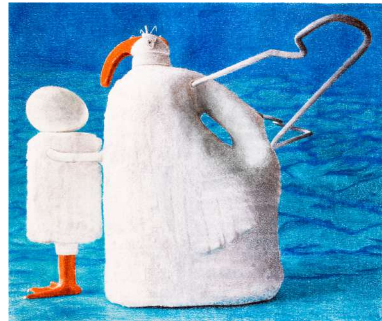
Julia McGehean, Snowmen Sleep in the Sea , 15"x12.75", Solvent transfer and colored pencil on Bristol, 2020

These physical collages seamlessly shift into works on paper that become abstracted interpretation of daily life, while playfully condensing time and space. These liminal environments often invite an unsteady slippage by collapsing multiple perspectives into one picture plane while juxtaposing color, size, scale, and function. I am drawn to the gauzy precision of solvent transfer as a rogue reproductive technique to carefully render and rapidly layer pictorial conversations. As a full-time library technician, I am ironically surrounded by this collision of visual and text based learning on a daily basis. Through this constant exposure, I have interpreted a rocky relationship with reading into an object based language that translates my strengths in creative problem solving and emotional sensitivity."