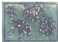
Chrysanthemums (2) 2021 Linoleum Reduction Print 17" x 21" (Framed) $3,500