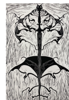
Untitled 2022 Linoleum Print 17" x 21" (Framed) $3,500