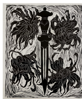
Untitled 2022 Linoleum Print 10" x 12" (Unframed) $3,500

Mehta's practice spans oil painting and printmaking, often drawing on surrealism, psychology, and film to construct dreamlike, introspective spaces. Her work explores the body's relationship with the unconscious, using limited color palettes, repeated imagery, and subtle surface treatments to evoke a sense of stillness, mystery, and emotional depth. Through layered compositions and tactile surfaces, Mehta creates psychological landscapes that blur the boundary between memory and sensation.