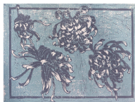
Chrysanthemums (1) 2021 Linoleum Reduction Print 12" x 16" (Unframed) $3,500