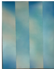
Something Left Unsaid 2025 acrylic on raw canvas 24" x 30" (framed) $1,440

The pieces in her recent series Traversing reflect on the act of moving through uncertainty—employing stitched canvases to examine how persistence and presence can shape one's path in the absence of clear answers.