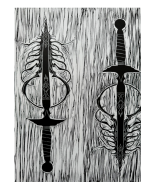
Untitled 2022 Linoleum Print 17" x 21" (Framed) $3,500

Wujian Wang is a visual and conceptual artist working across photography, animation, and video art. Originally from China and currently based in the United States, Wang applies a painterly sensibility to lens-based media, combining cinematic composition, poetic sound design, and whimsical narrative structures.