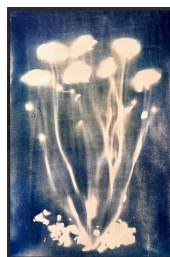
Past to the Future (series) 2025 cyanotype 24" x 36" (framed) $900 (each)

Drawing from lived experiences of isolation and cross-cultural dislocation, Wang's work explores emotional intimacy and the unconscious, seeking to break down social and psychological barriers. Her practice reimagines everyday moments with sensuality and humor, often focusing on the expressive potential of the human body and its relationship with nature. Women