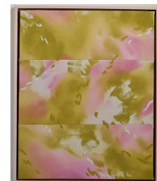
The Flowers You Planted 2025 acrylic & oil stick on stitched canvas 16" x 20" (framed) $920