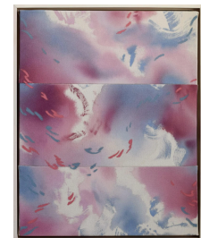
Faraway Places 2025 acrylic & oil stick on stitched canvas 16" x 20" (framed) $920