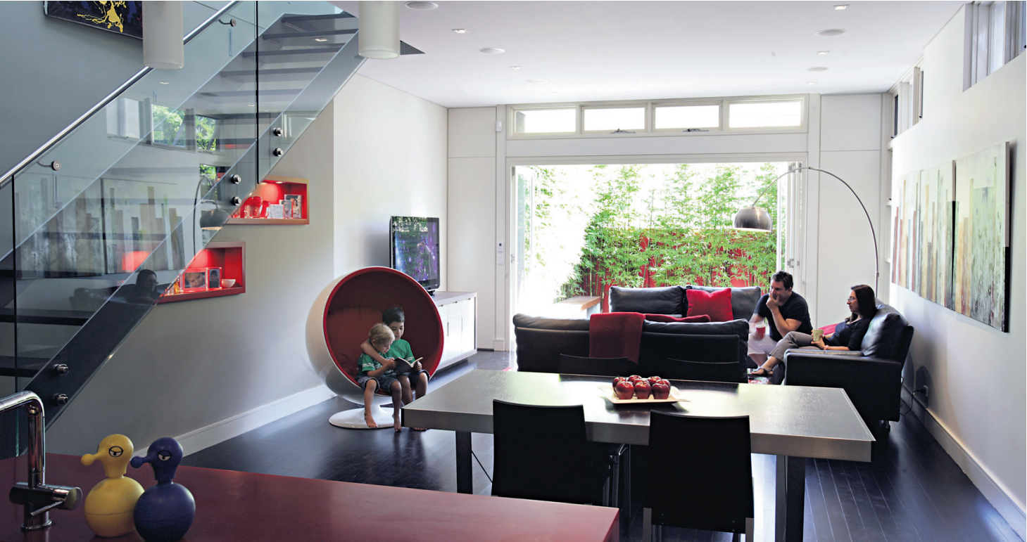
Out of sight ... open treads and a glass balustrade make the staircase less intrusive.

Colour and light have played a major part in overcoming dull, cold interiors and brightening up the look of this two-storey semi.