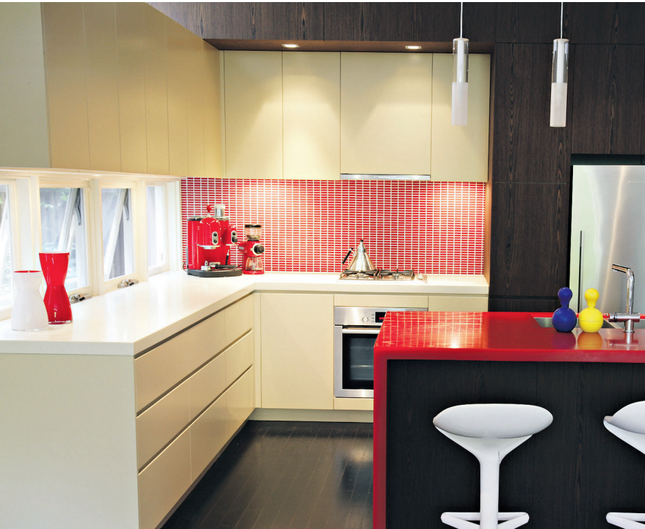
Red alert ... letter-box red is the standout colour in the new kitchen.