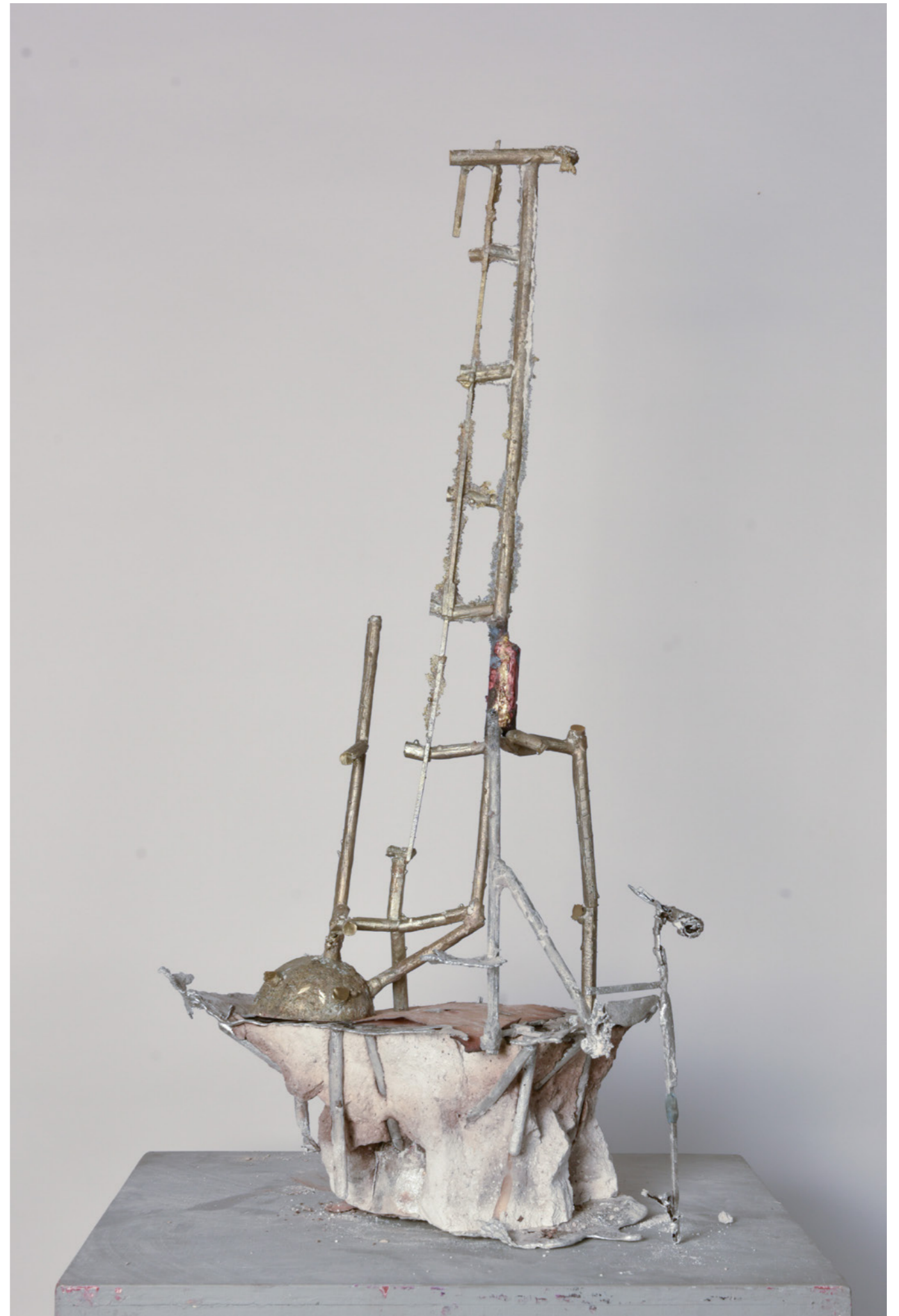
(Left) Untitled , Plaster, casted aluminium, (Right) Socalo , Plaster, casted aluminium, casted bronze