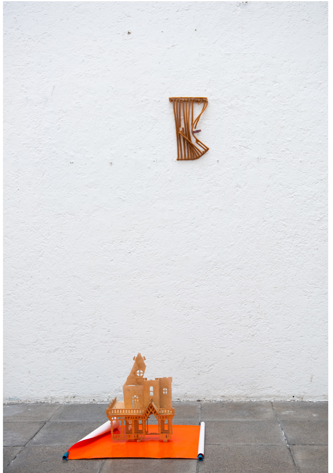
(Left) Centerpeace , bronzcast, (Right) Untitled , Interconected model house on orange paper and casted wax with pin