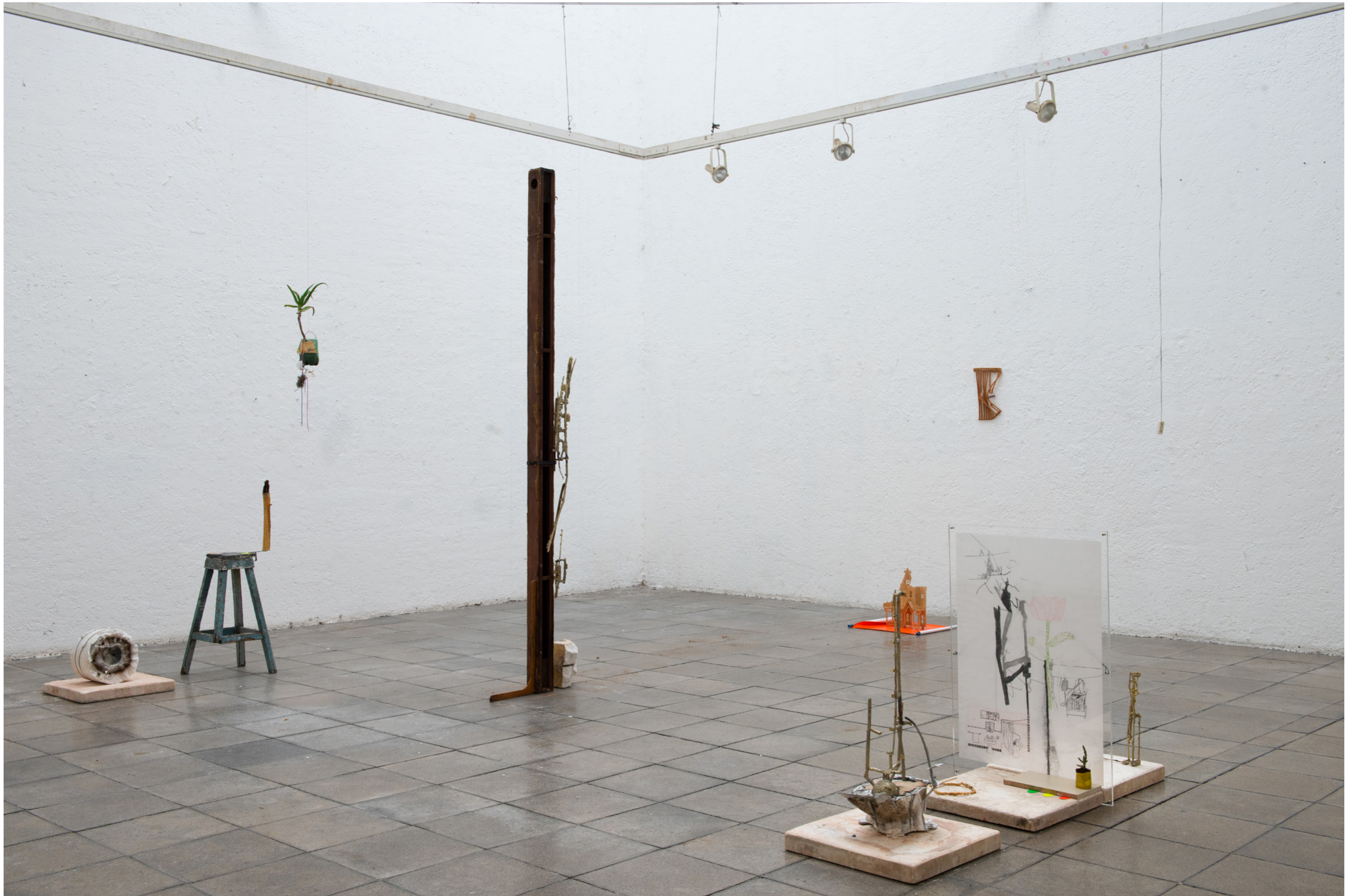
Vista Caracol , Installation view