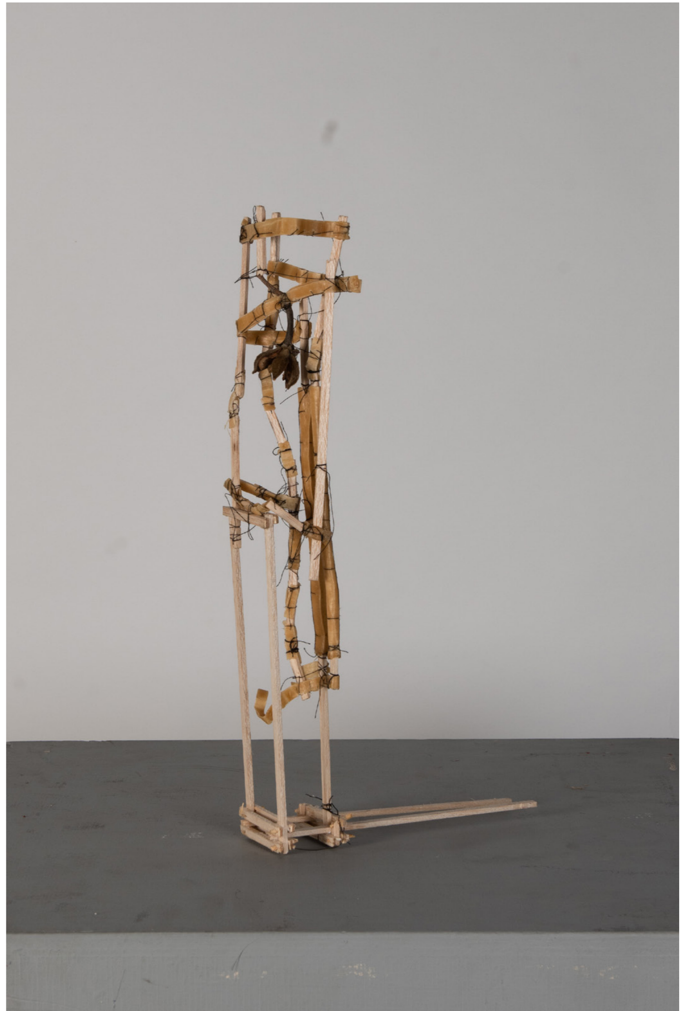
(Left) Untitled , organic fragments, waxcovered canvas, balsa wood (Right) Untitled , organic fragments, waxcovered canvas, balsa wood