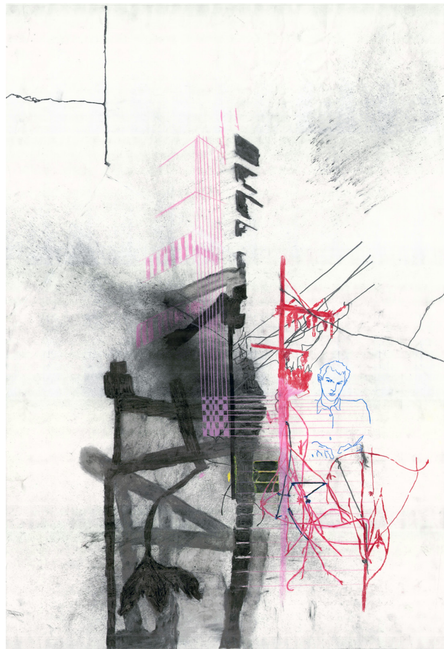
(Left) Untitled , Plaster, casted aluminium, canvas, balsawood, (Right) Self portrait in observation 2 , CDMX, Drawing on transparent film, 60x90cm