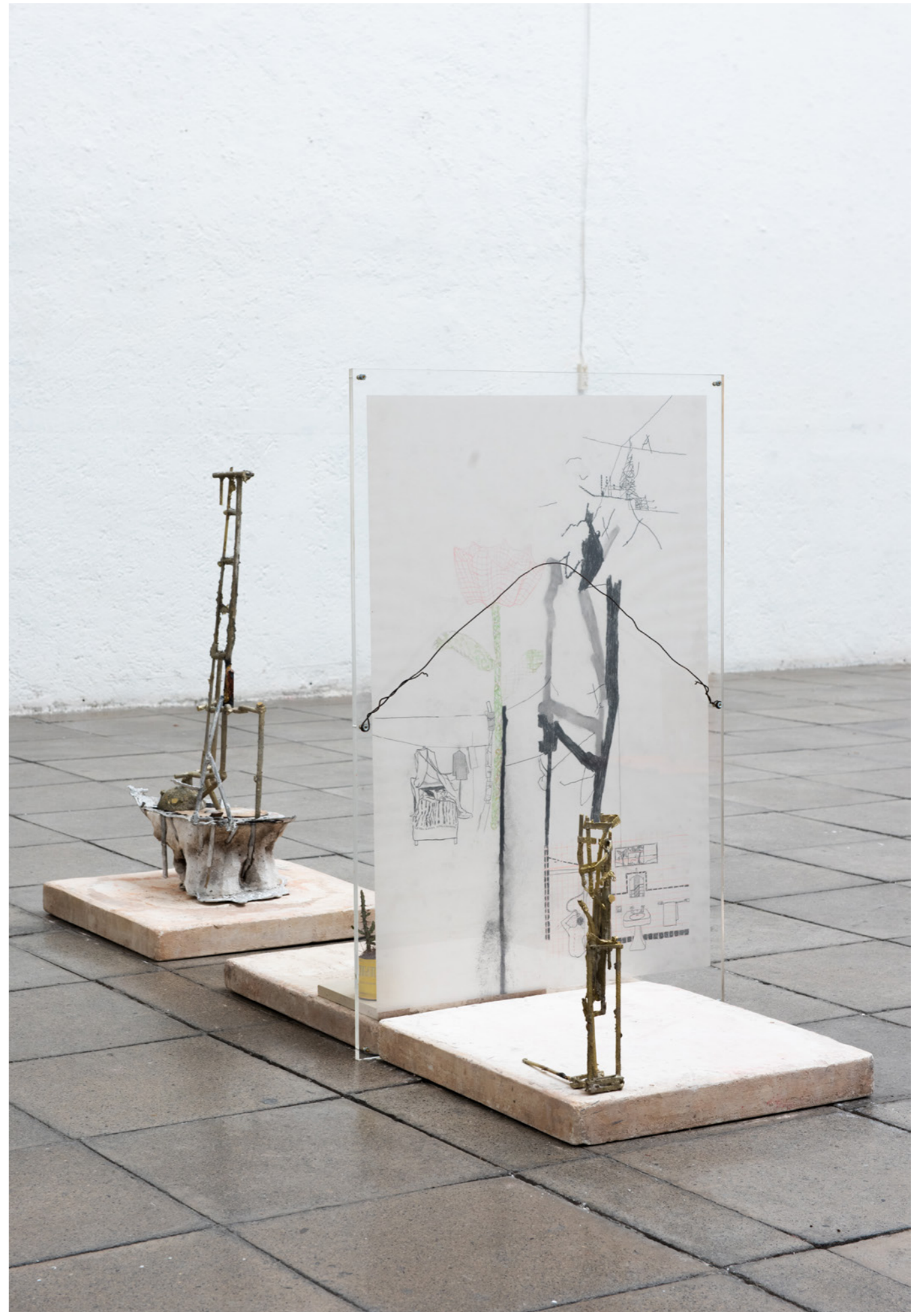
Vista Caracol, Installation views