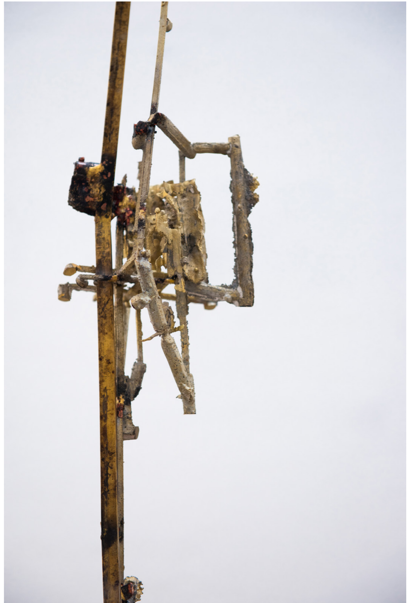
Accumulated remains of attempted improvements, bronze cast