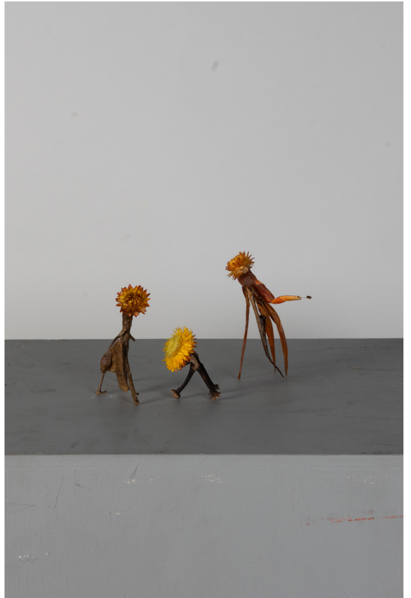
(Left) Untitled , wood, waxcovered canvas, (Right) Ojos del sol , Organic fragments, wax