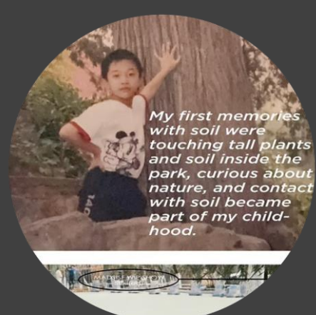
Soil Stories w/ Land in our Names