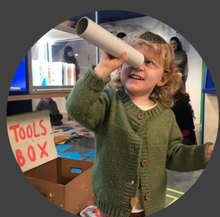
Curiosity w/ Walworth Library