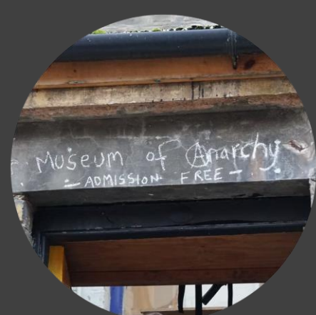
Nonsense @ 56A Infoshop