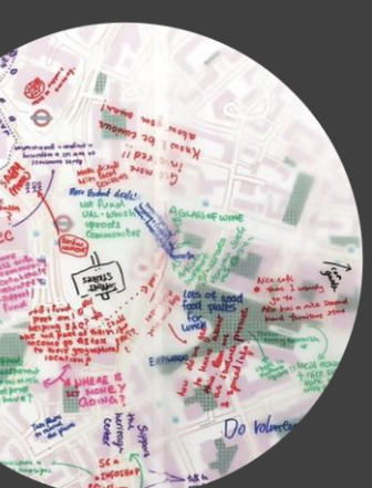
Mapping w/ The Remakery