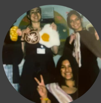
Eating w/ Camberwell Incredibles