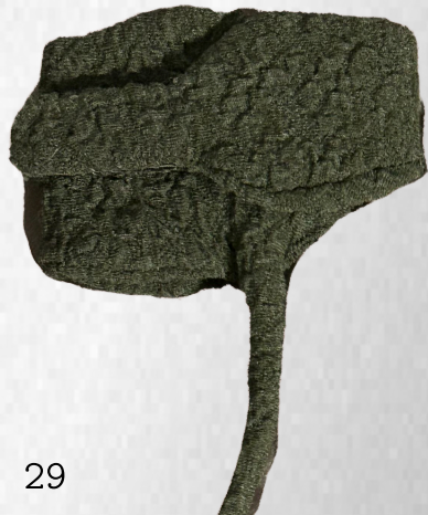
Version with an adjustable strap