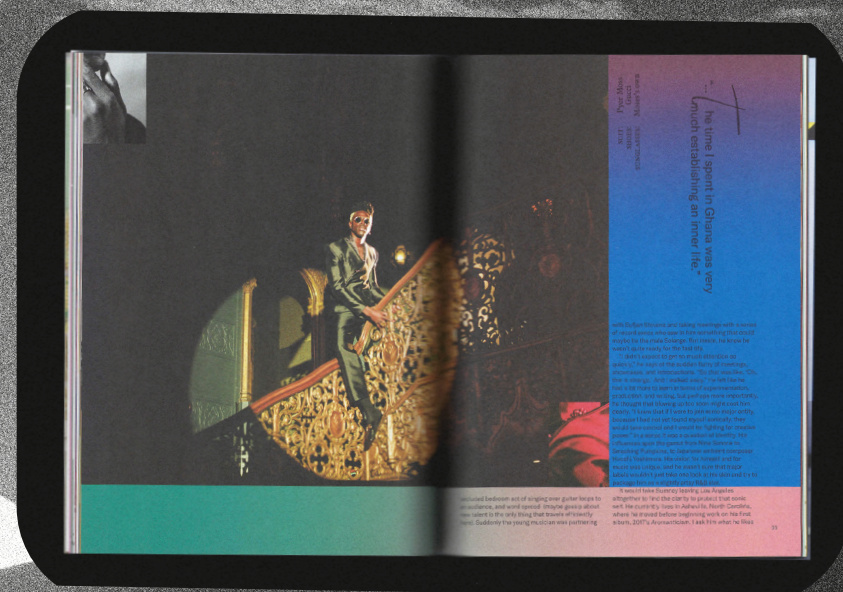
Inside page of Here Magazine.