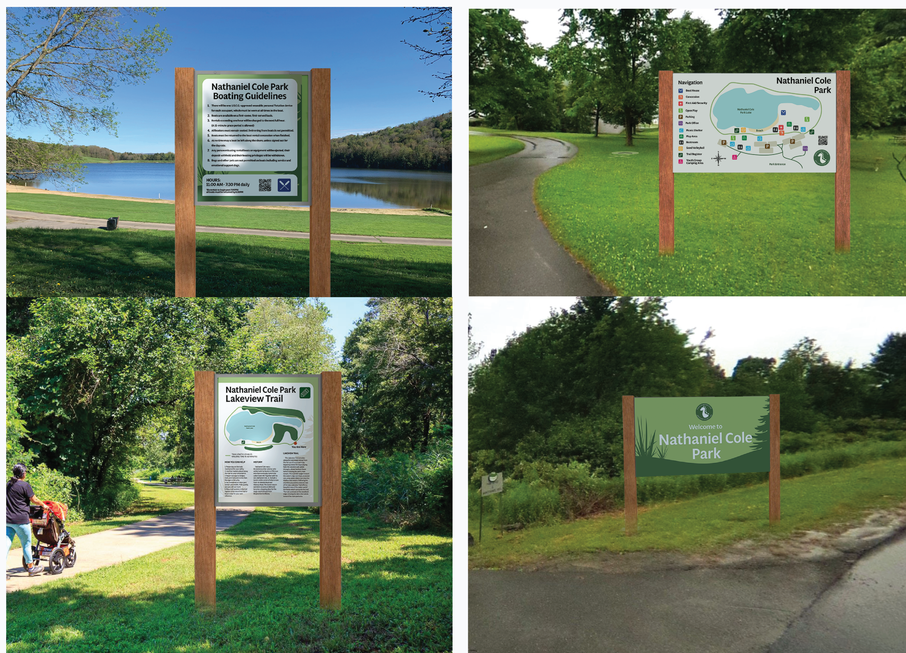
Building Guidelines, Map + Directory, Lakeview Trail, and Entrance Signage

MultiDisplay Regular: abcdefghijklmnopqrstuvwxyz