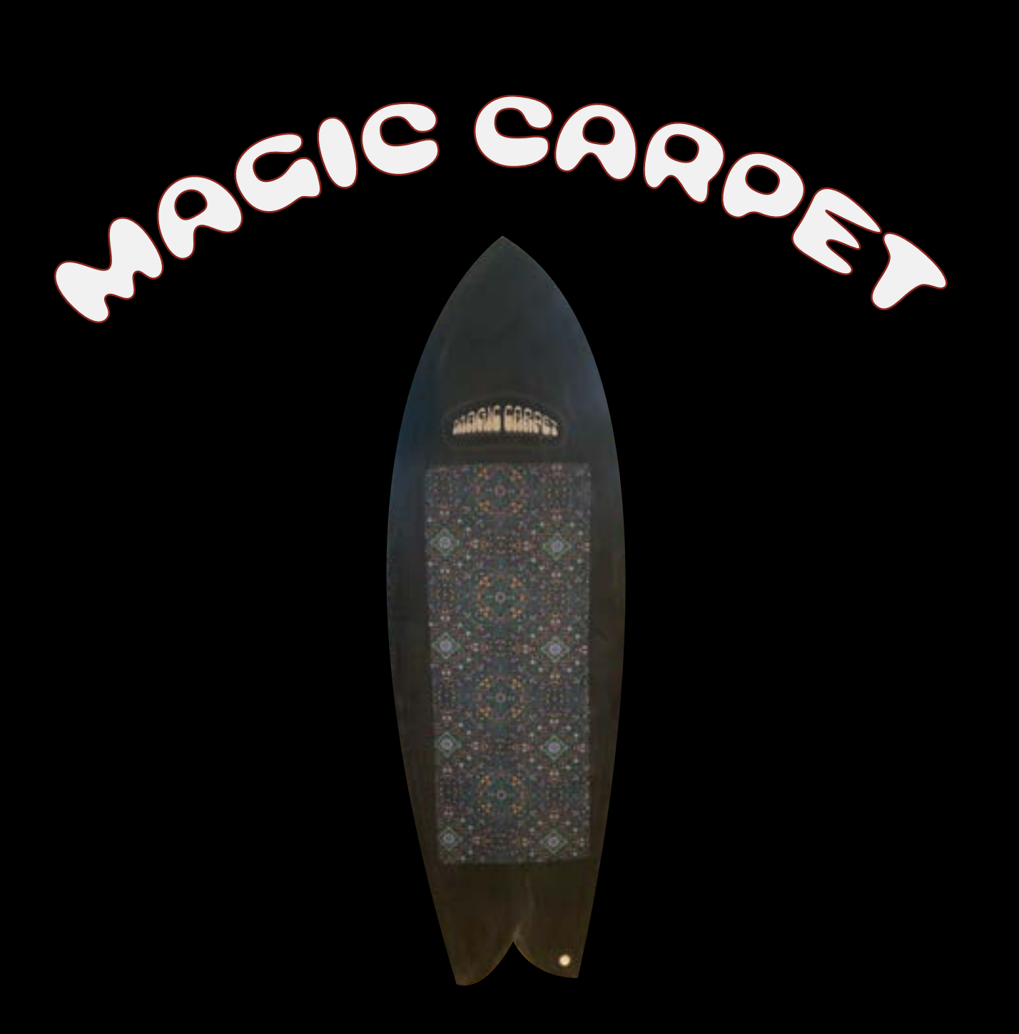
5'7 / 37 L / 22.3 W

Made in South Carolina, for South Carolina waves.