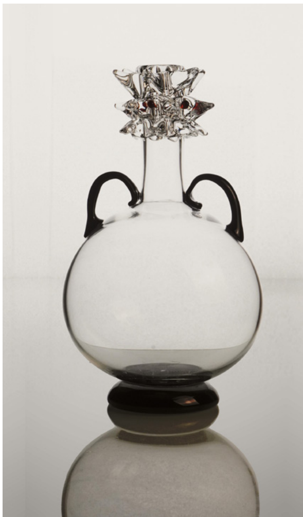
"Kyra" Glass blown glass in transparent, black and topaz 45cm x 20cm x 20cm