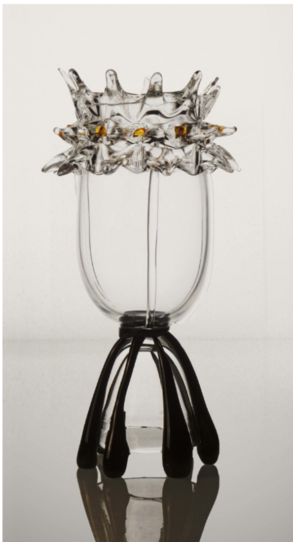
"Sofia" Glass blown glass in transparent, black and topaz 45cm x 20cm x 20cm