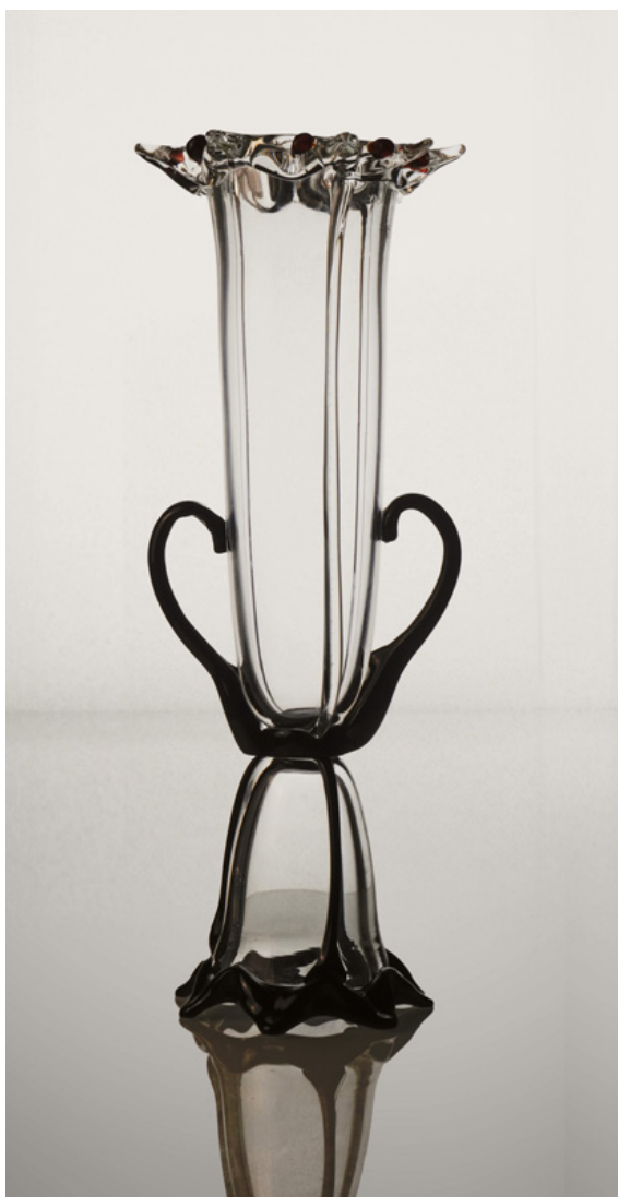
"Efi" Glass blown glass in transparent, black and topaz 45cm x 20cm x 20cm