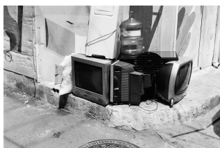
Federico Hurth, Untitled Seoul, 2024 C-print, framed 20 x 30 cm 1/5