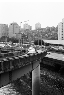
Federico Hurth, Untitled Seoul, 2024 C-print, framed 40 x 30 cm 2/5