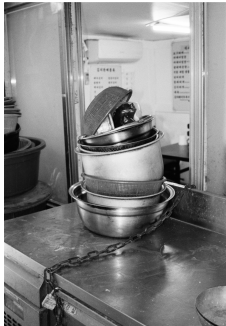
Federico Hurth, Untitled Seoul, 2024 C-print, framed 40 x 30 cm 1/5