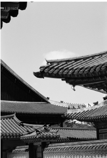
Federico Hurth, Untitled Seoul, 2024 C-print, framed 30 x 20 cm 2/5