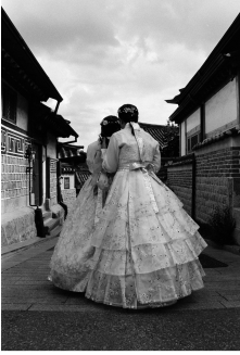
Federico Hurth, Untitled Seoul, 2024 C-print, framed 75 x 50 cm 2/5