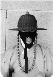
Federico Hurth, Untitled Seoul, 2024 C-print, framed 60 x 40 cm 1/3