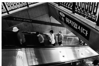
Federico Hurth, Untitled Seoul, 2024 C-print, framed 20 x 30 cm 1/5