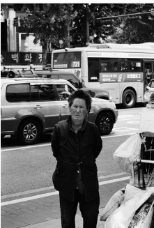
Federico Hurth, Untitled Seoul, 2024 C-print, framed 60 x 40 cm 2/5