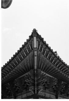
Federico Hurth, Untitled Seoul, 2024 C-print, framed 30 x 20 cm 1/5