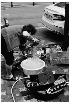
Federico Hurth, Untitled Seoul, 2024 C-print, framed 40 x 30 cm 1/5