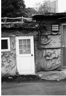
Federico Hurth, Untitled Seoul, 2024 C-print, framed 40 x 30 cm 1/5