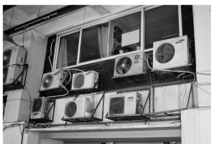
Federico Hurth, Untitled Seoul, 2024 C-print, framed 30 x 40 cm 1/5