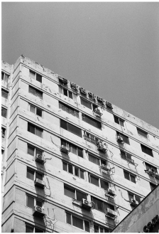
Federico Hurth, Untitled Seoul, 2024 C-print, framed 60 x 40 cm 1/3