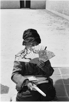
Federico Hurth, Untitled Seoul, 2024 C-print, framed 75 x 50 cm 2/5