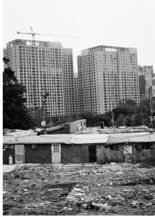
Federico Hurth, Untitled Seoul, 2024 C-print, framed 30 x 20 cm 1/5