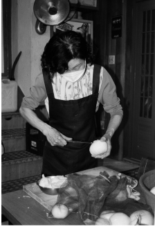
Federico Hurth, Untitled Seoul, 2024 C-print, framed 60 x 40 cm 1/3