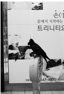
Federico Hurth, Untitled Seoul, 2024 C-print, framed 60 x 40 cm 1/3