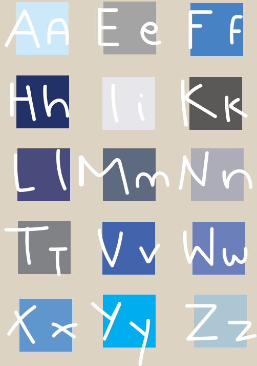
Letters formed by Straight/Angled Lines