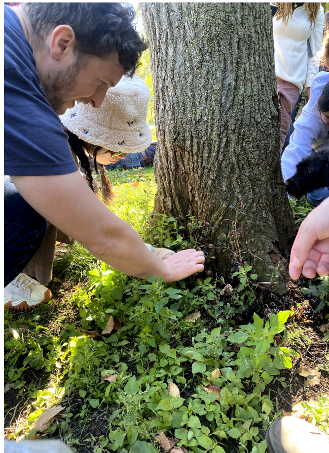
*Glistening InkCaps (Coprinellus micaceus)