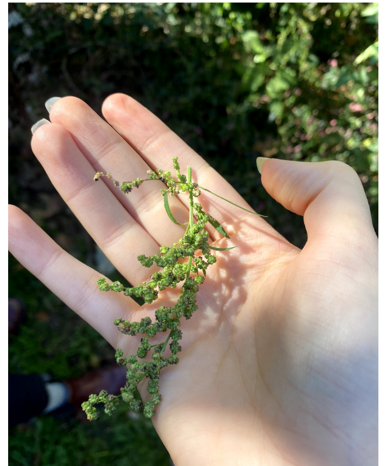
*Lambs quarters (Chenopodium album)