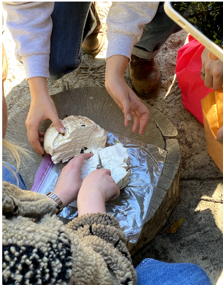
*Puffball Mushrooms (Lycoperdon perlatum)