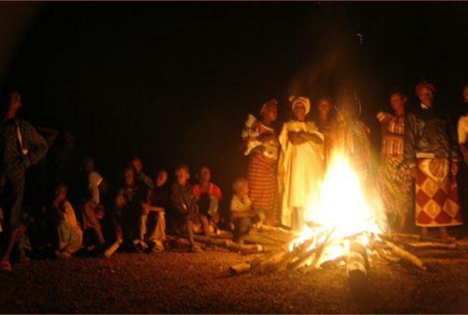
Sc. 4/Sc. 12