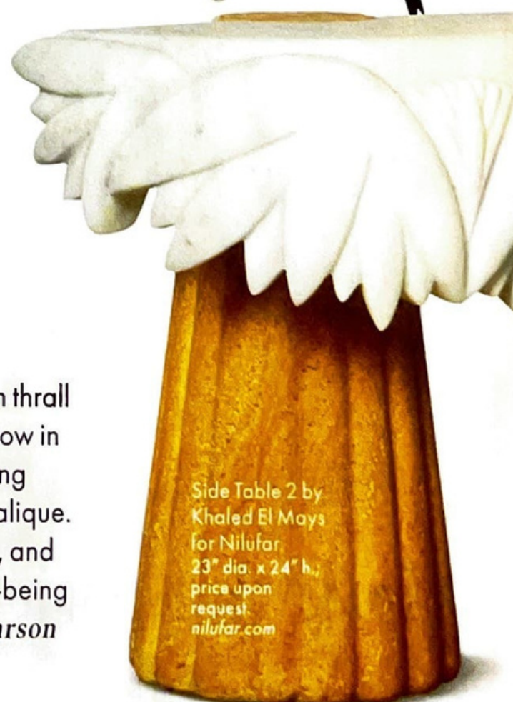
Side Table 2 by Khaled El Mays for Nilufar. 23" dia. x 24" h.; price upon request. nilufar.com

Homegrown and international designers alike are in thrall to Egypt. Dior staged its men's fall 2023 runway show in front of the pyramids, while James Turrell is paying homage to those world wonders in new pieces for Lalique. Primeval myth, too, is seen in the lions' feet, lotuses, and modes of transit—like Atet, the infamous boat of Ra—being reimaged as furniture pieces. —Parker Bowie Larson