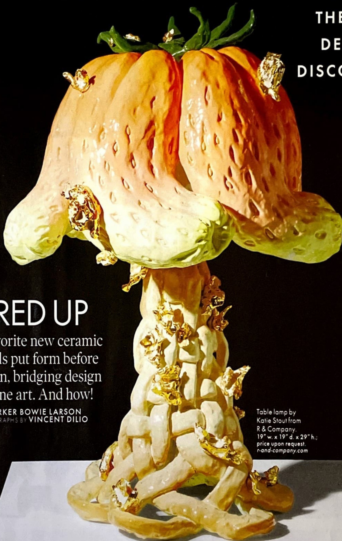
Table lamp by Katie Stout from R & Company. 19" w. x 19" d. x 29" h.; price upon request. r-and-company.com

BY PARKER BOWIE LARSON