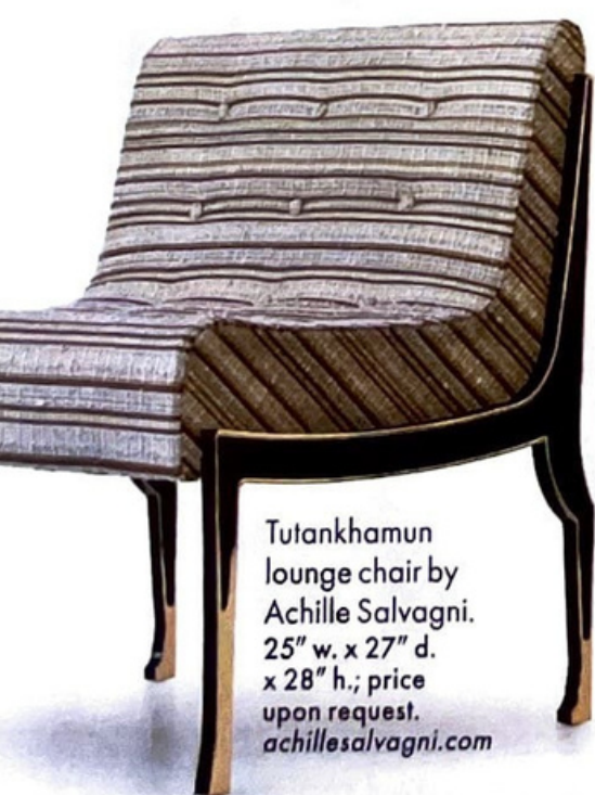
Tutankhamun lounge chair by Achille Salvagni. 25" w. x 27" d. x 28" h.; price upon request. achillesalvagni.com