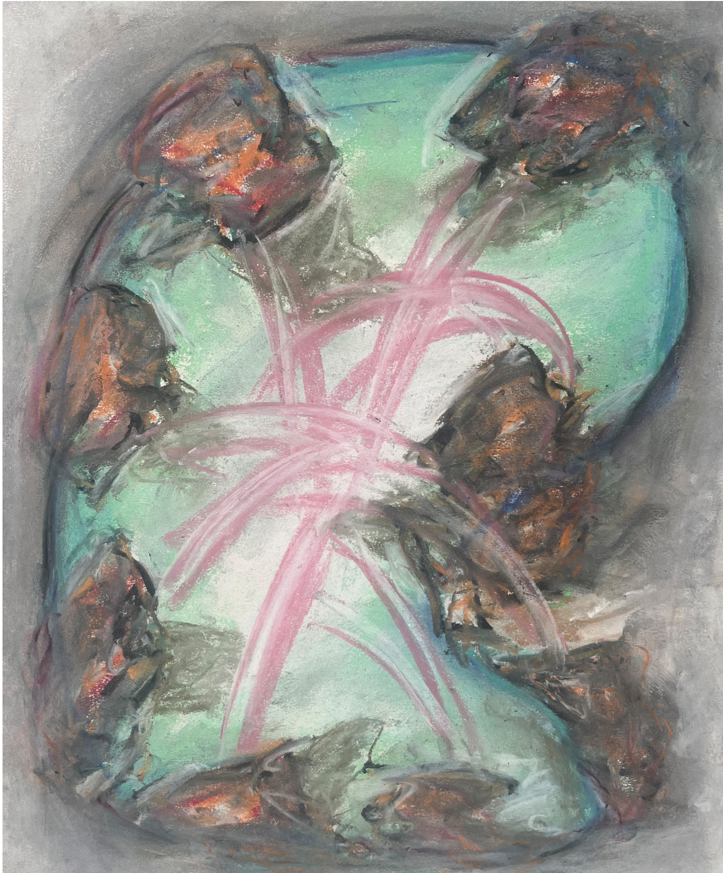
Surreal Abstraction No. 10 , 2024 Pastel on Stretchmore paper 17" x 14" (framed, 23" x 20")