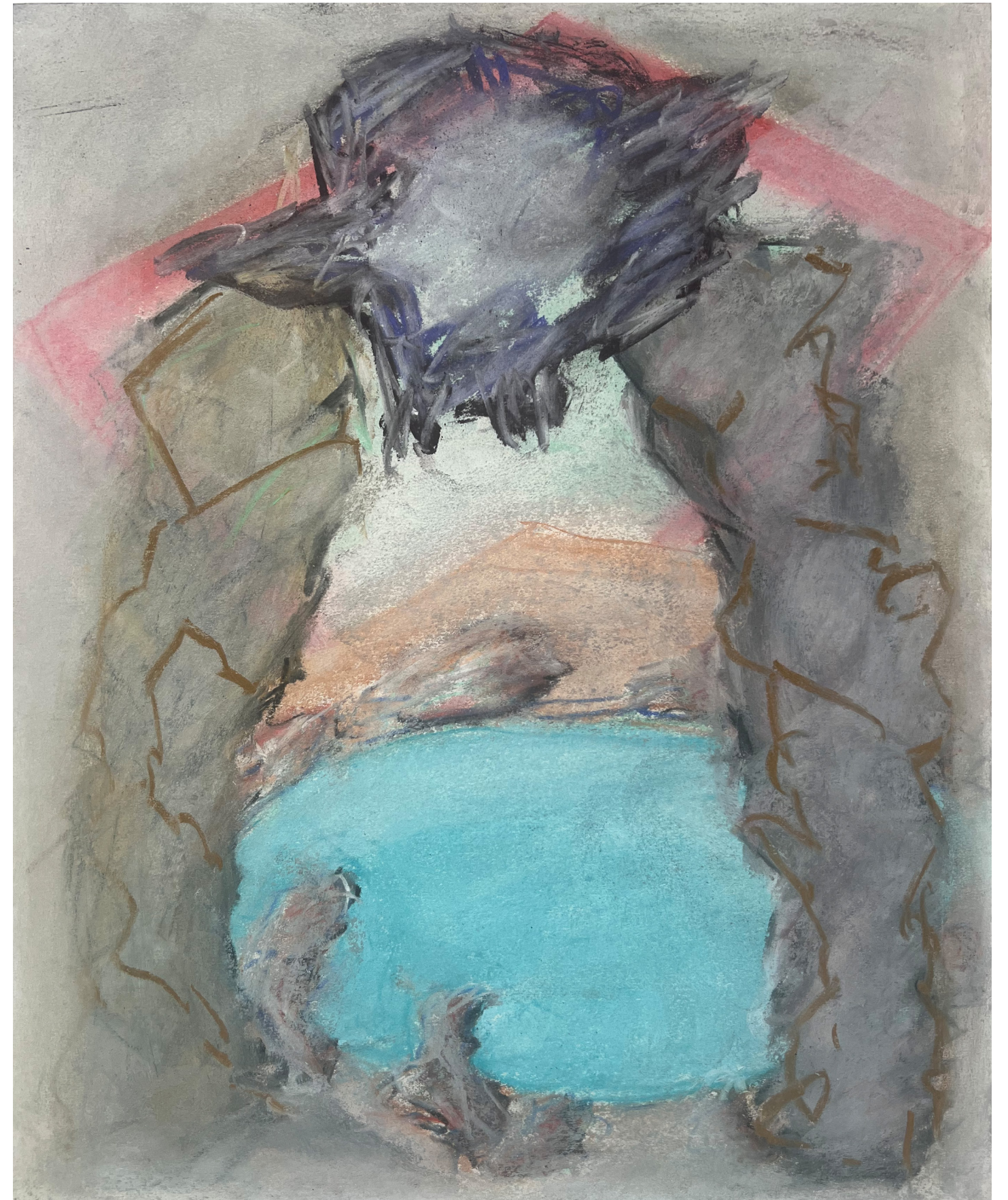
Surreal Abstraction No. 1, 2024 Pastel on Strethmore paper 17" x 14" (framed, 23" x 20")

We hope you can join us for this marvelous evening.