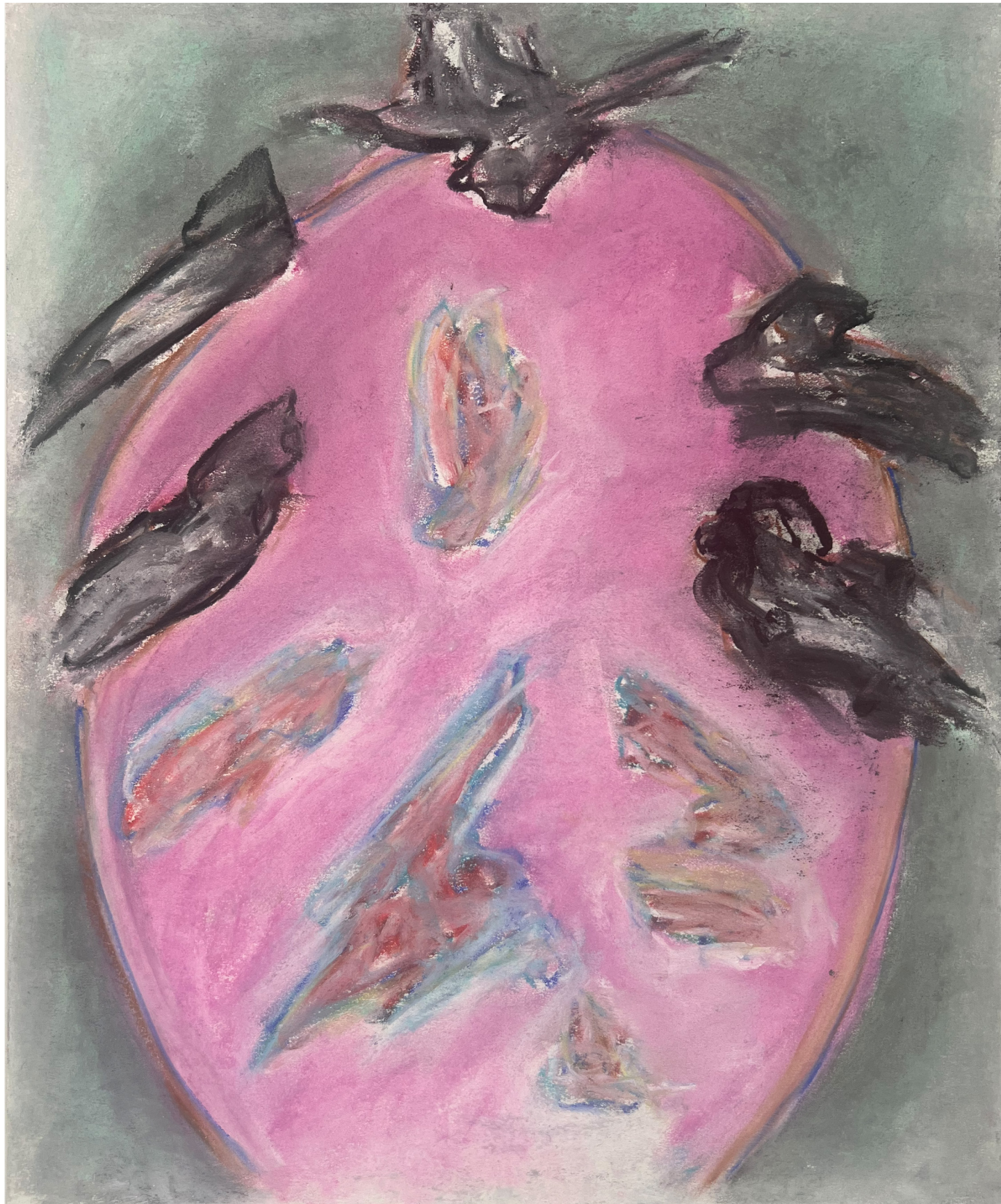
Surreal Abstraction No. 6 , 2024 Pastel on Stretchmore paper 17" x 14" (framed, 23" x 20")