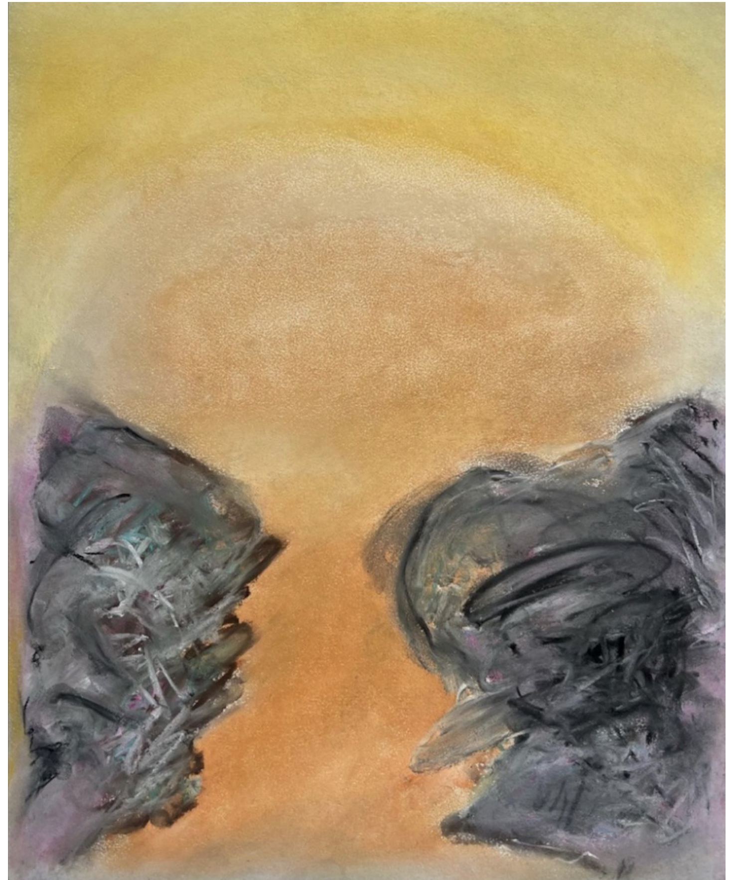
Surreal Abstraction No. 5 , 2024 Pastel on Stretchmore paper 17" x 14" (framed, 23" x 20")