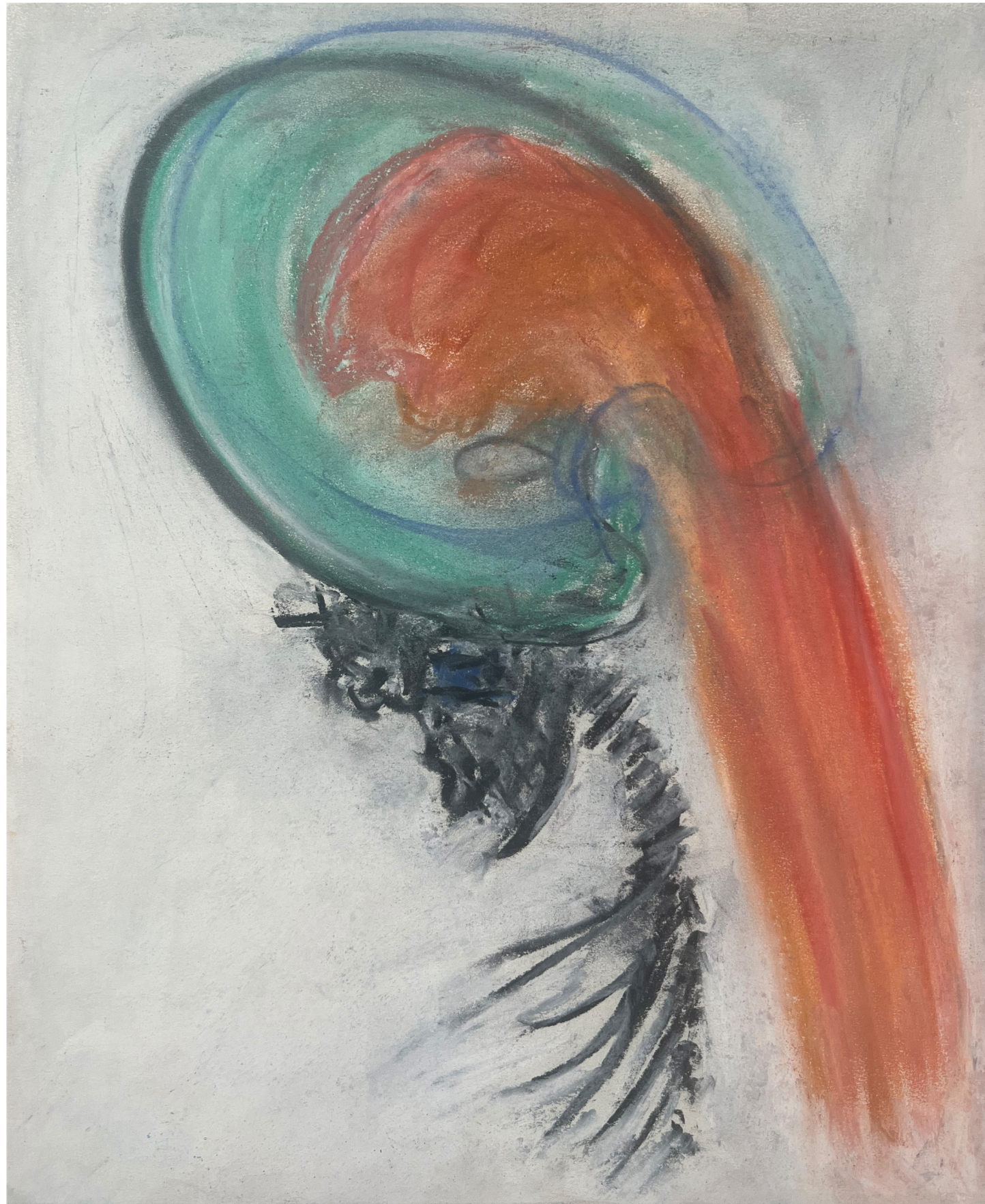
Surreal Abstraction No. 4 , 2024 Pastel on Stretchmore paper 17" x 14" (framed, 23" x 20")