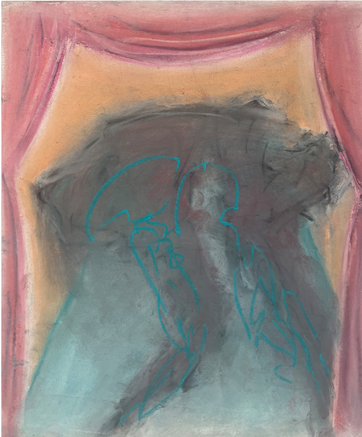
Surreal Abstraction No. 8 , 2024 Pastel on Stretchmore paper 17" x 14" (framed, 23" x 20")