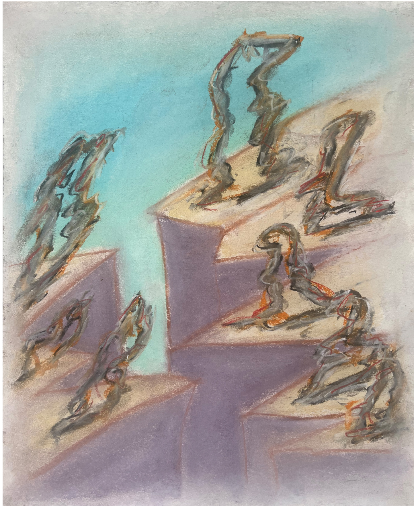
Surreal Abstraction No. 2 , 2024 Pastel on Stretchmore paper 17" x 14" (framed, 23" x 20")