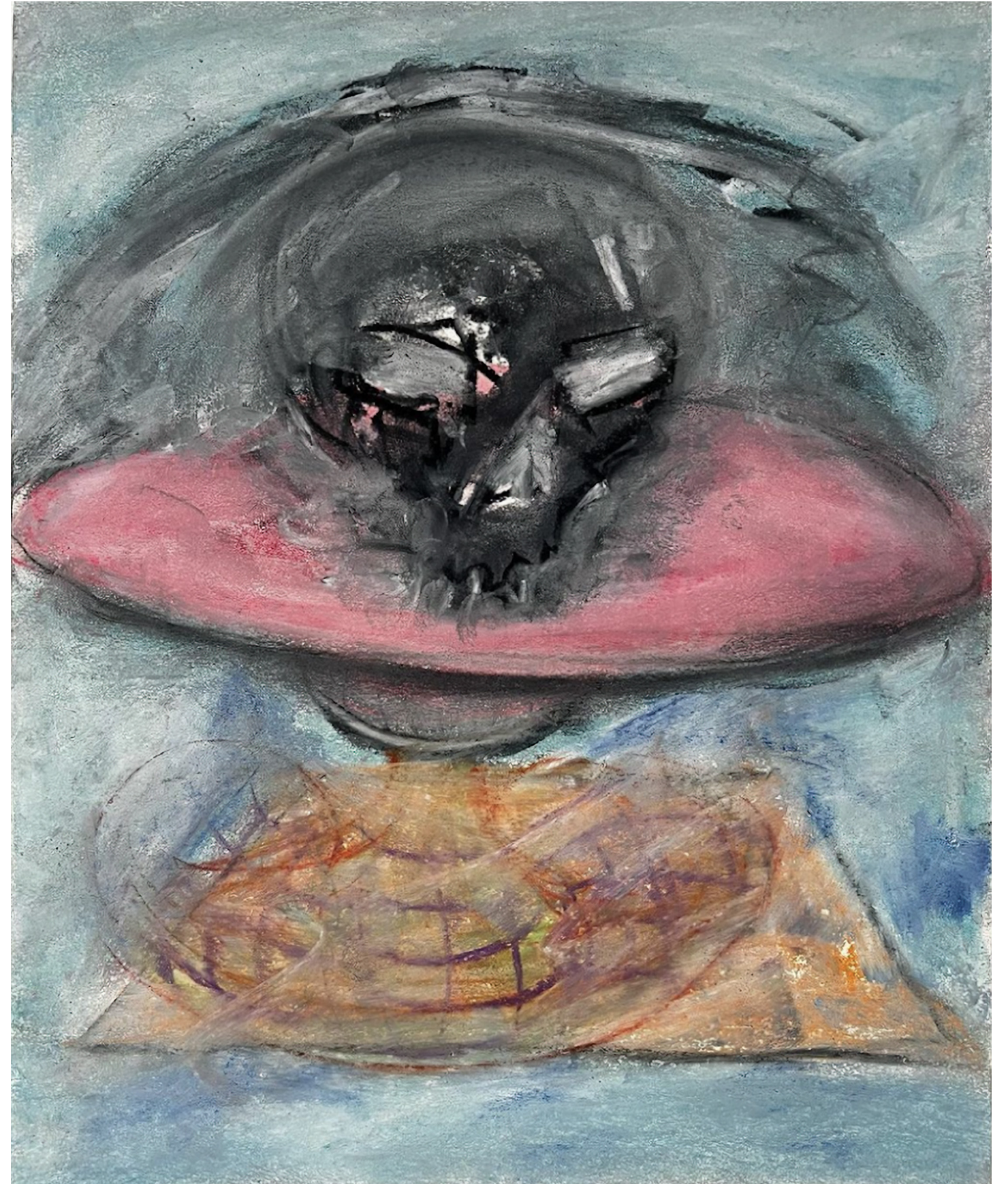
Surreal Abstraction No. 11 , 2024 Pastel on Stretchmore paper 17" x 14" (framed, 23" x 20")