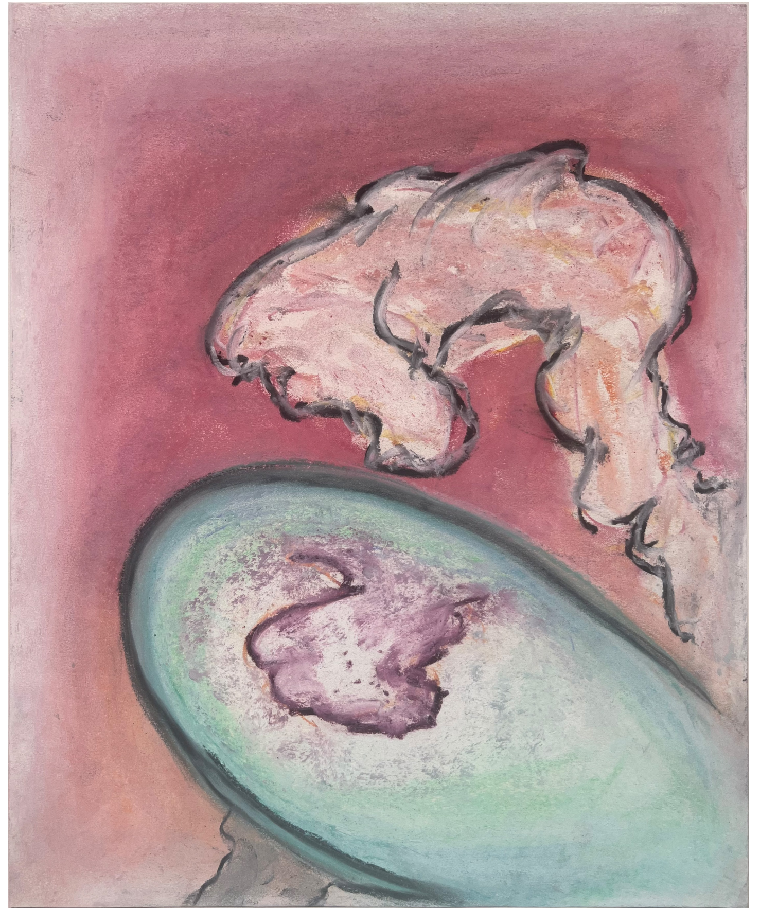
Surreal Abstraction No. 3 , 2024 Pastel on Stretchmore paper 17" x 14" (framed, 23" x 20")