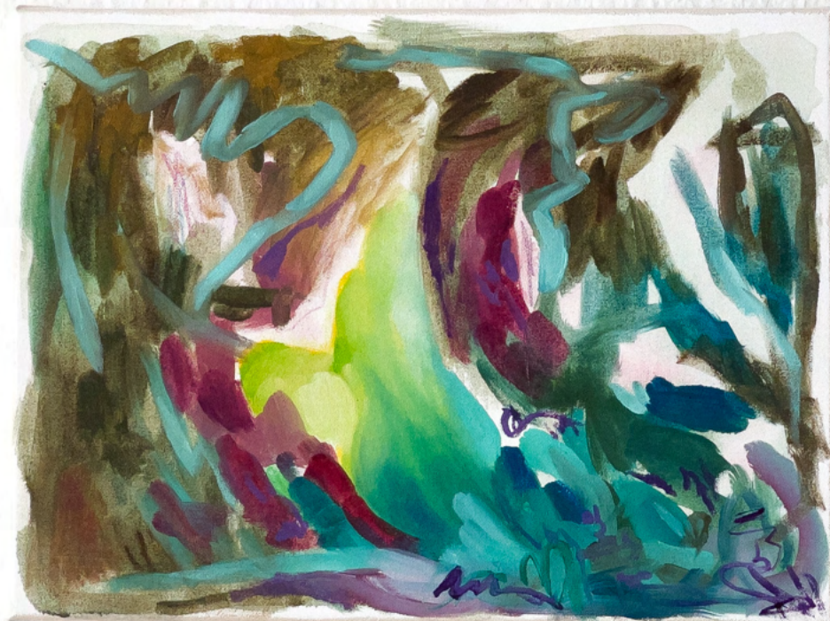
Fallen trees are now bridges to avoid the water, 2025 Oil paint and coloured pencil on canvas 30 × 40 cm