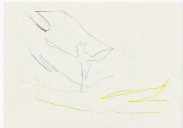
Drawings, 2023 ongoing Colored pencil on paper 14.8 × 21 cm each