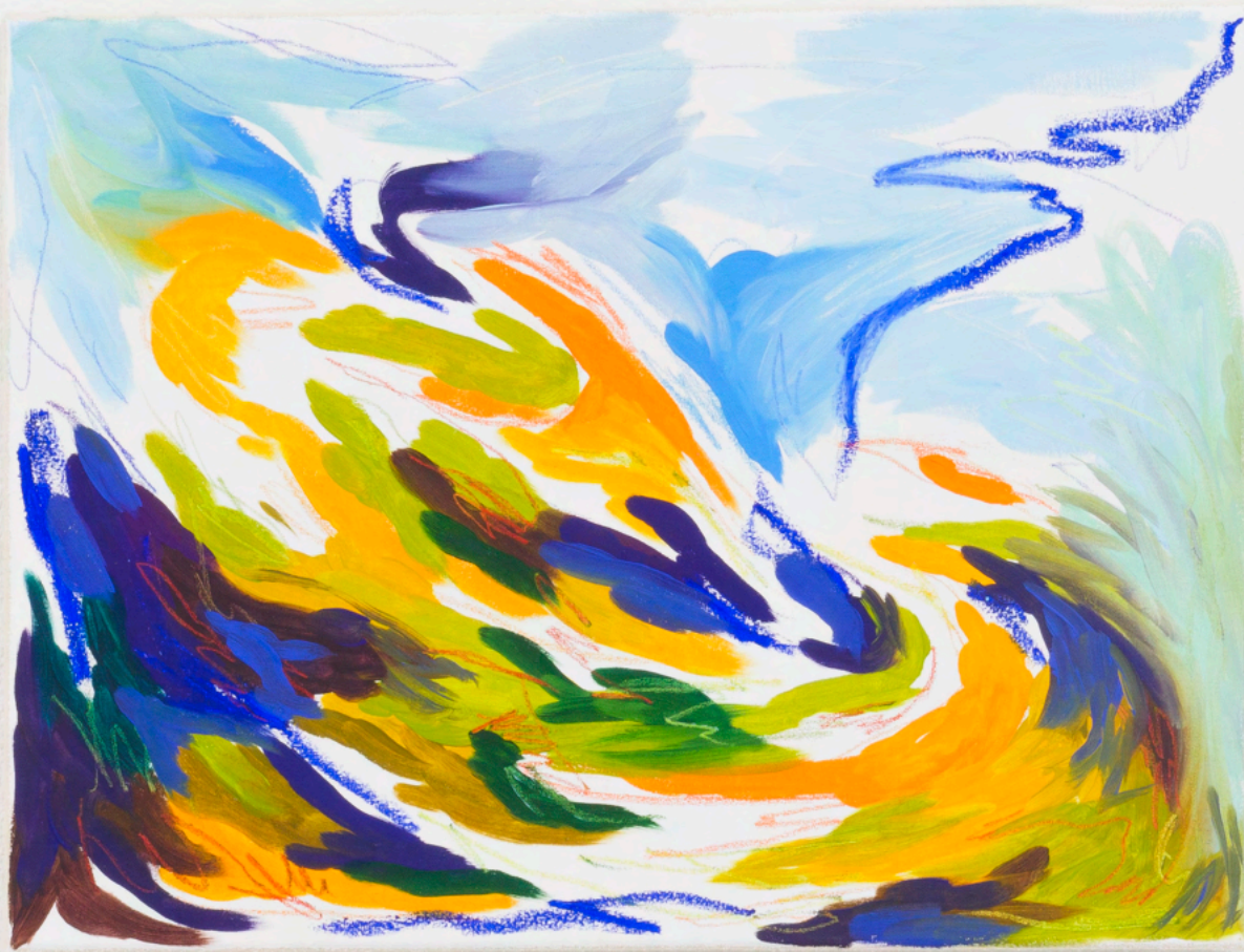
Sotto il sole dorato , 2023 Oil paint, oil stick and colored pencil on canvas 30 × 40 cm