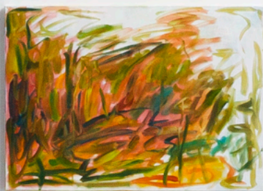
Boiling ground, 2023 Acrylic and oil paint on canvas 50 × 70 cm