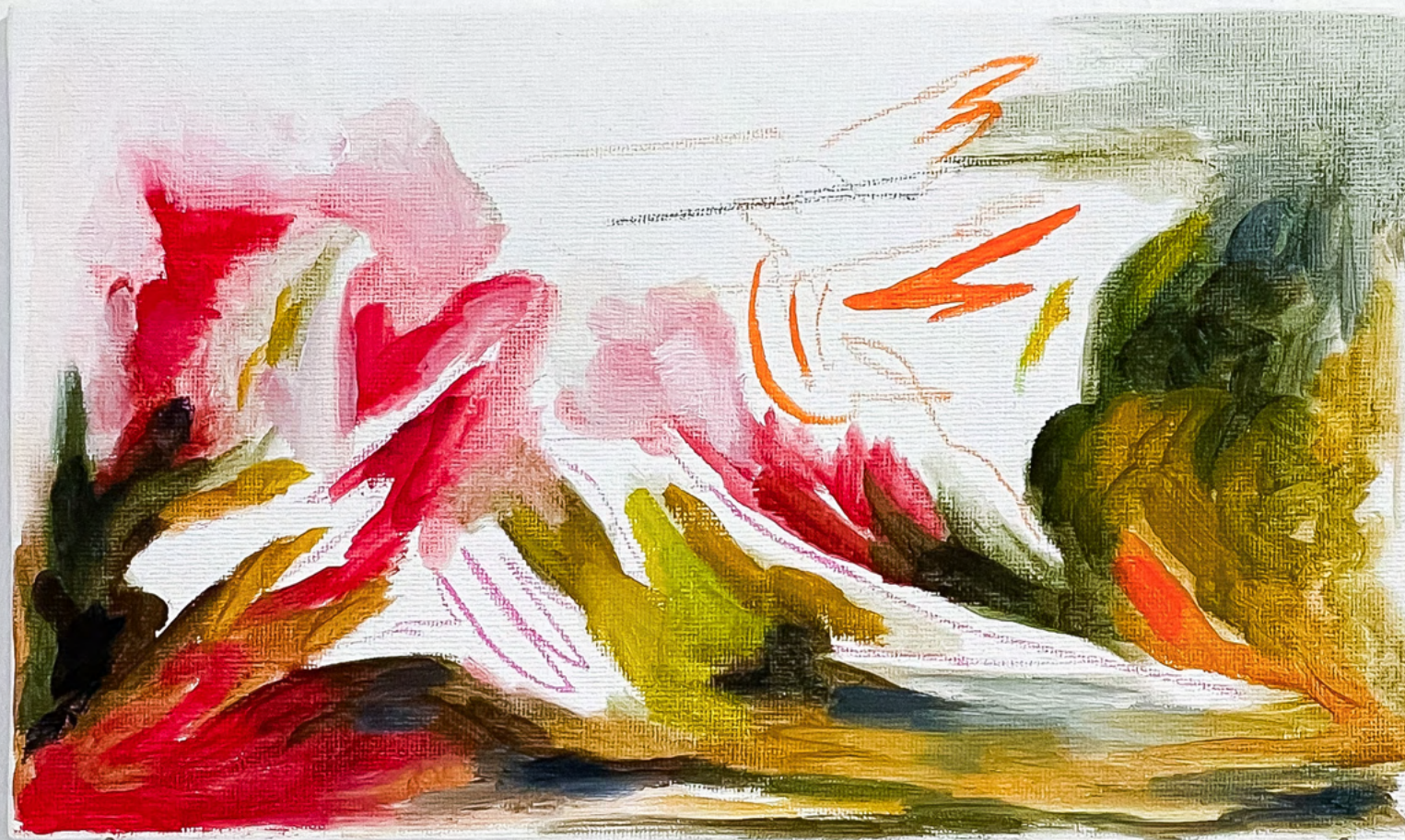
Non voglio mai vedere il sole tramontare , 2025 Oil and coloured pencil on canvas board 15 x 25 cm