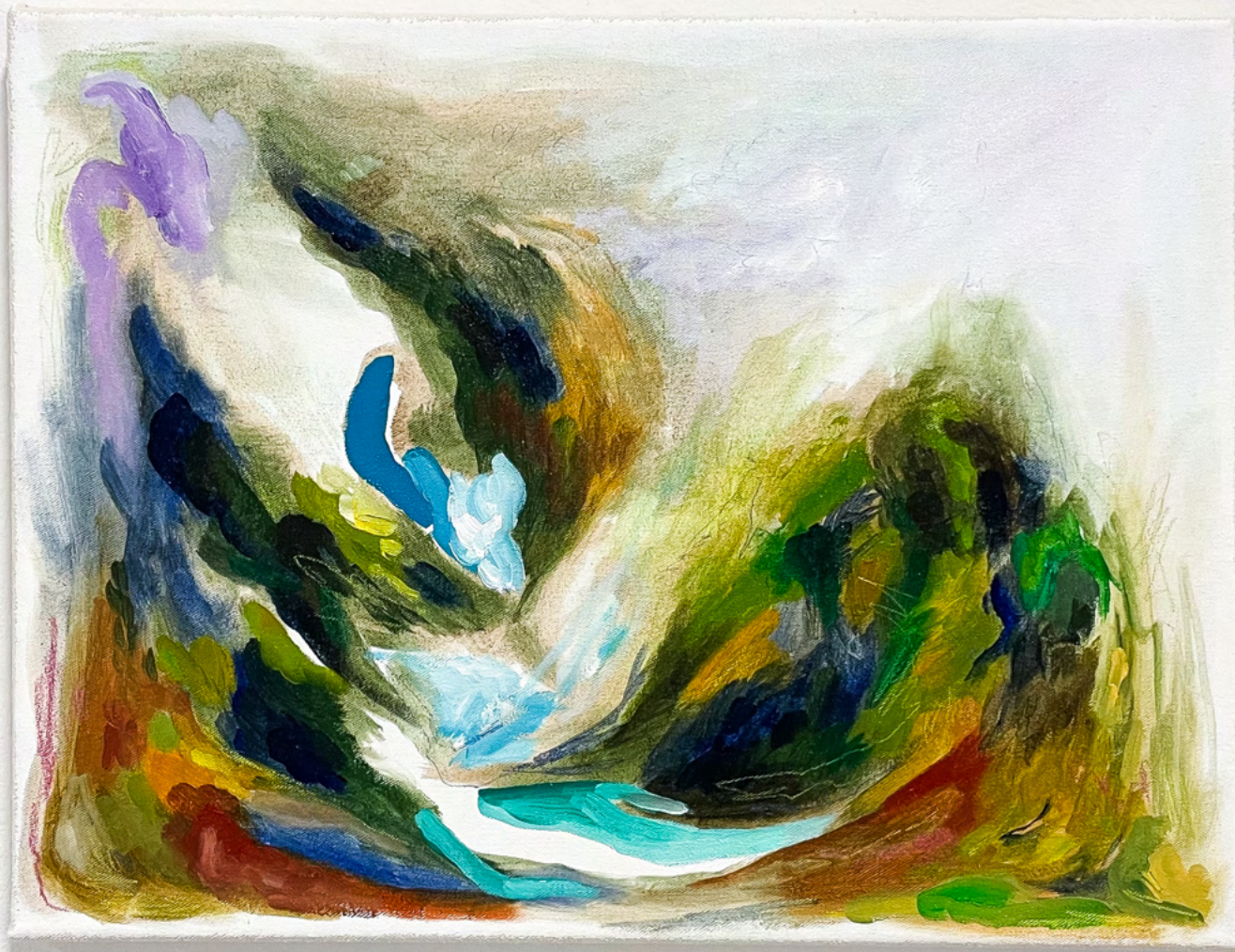
Untitled, 2024 Oil paint and coloured pencil on canvas 30 × 40 cm