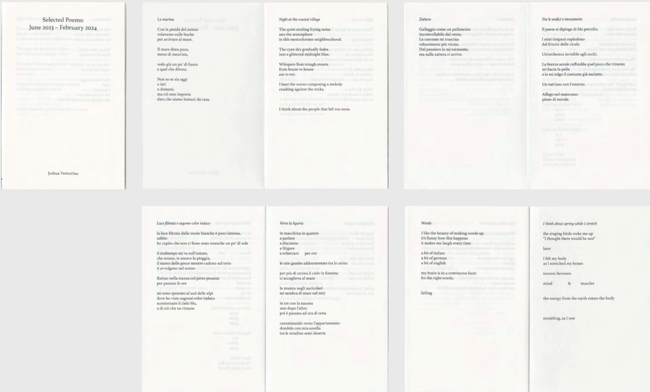
Pages extract of Selected Poems: June 2023 – February 2024 Poetry zine in English and Italian 17.5 × 11.5 cm, 20 pages