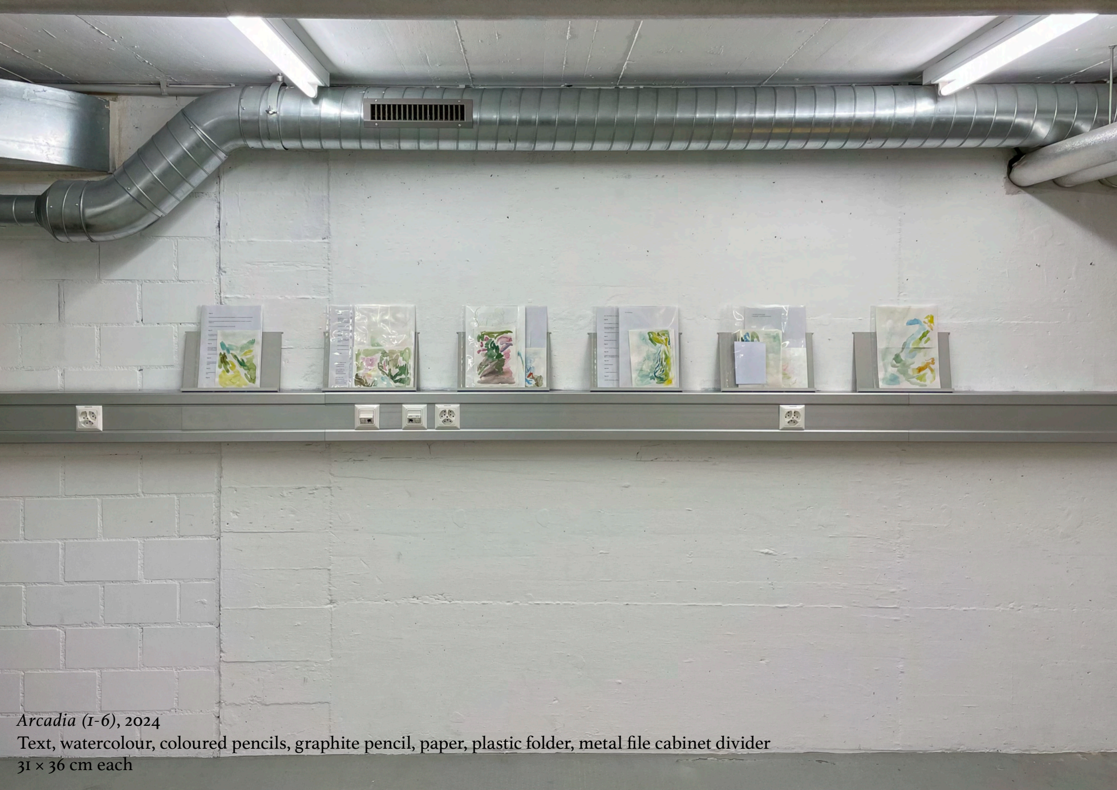
Arcadia (I-6), 2024

Text, watercolour, coloured pencils, graphite pencil, paper, plastic folder, metal file cabinet divider