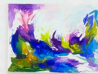
Open sky terrarium, Undiscovered roots under my feet, 2023 Oil paint and colored pencil on canvas 30 × 40 cm each