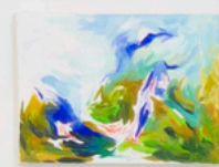
Untitled, A cloud slowly covered my body, Pointing tips protect the inside, 2023 Oil paint and colored pencil on canvas 30 × 40 cm each