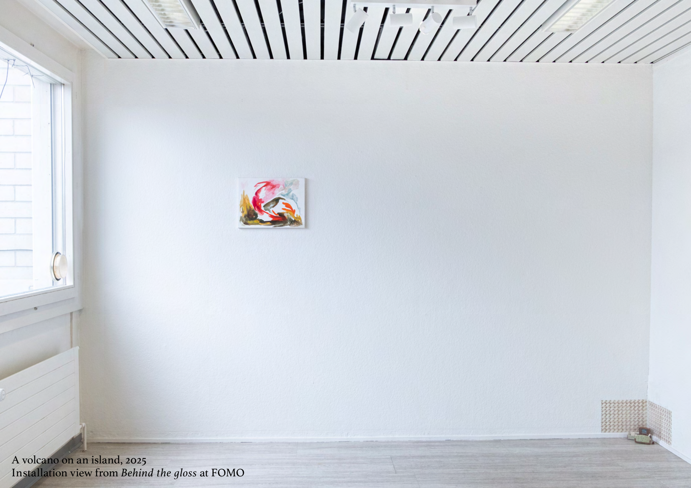
A volcano on an island, 2025 Installation view from Behind the gloss at FOMO