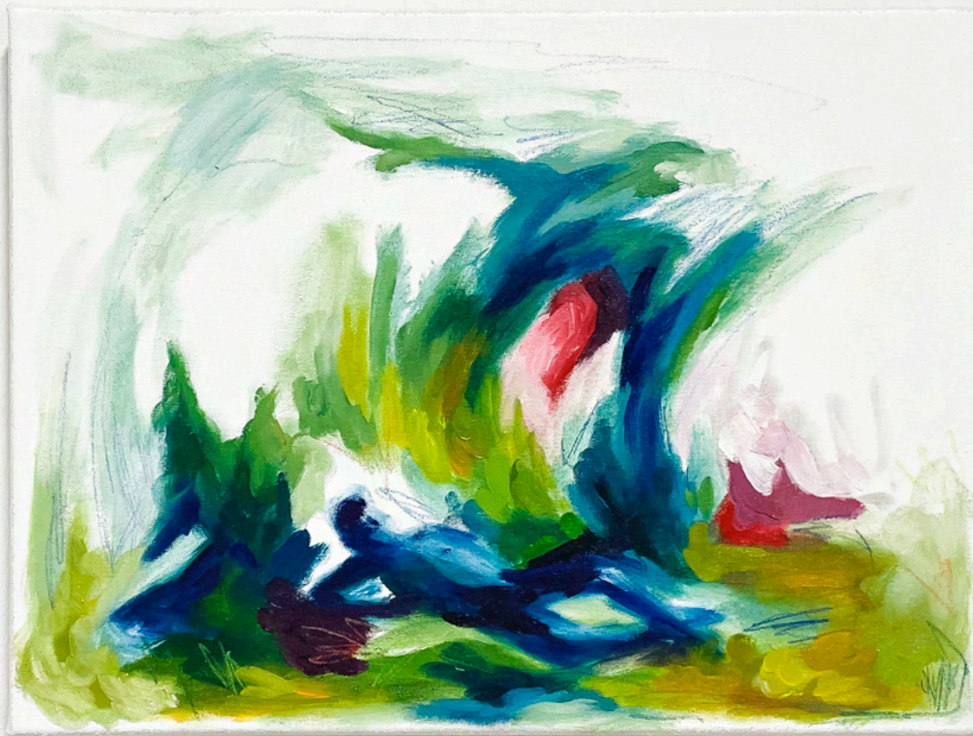
Spring (under the tree) , 2024 Oil paint and coloured pencil on canvas 30 × 40 cm