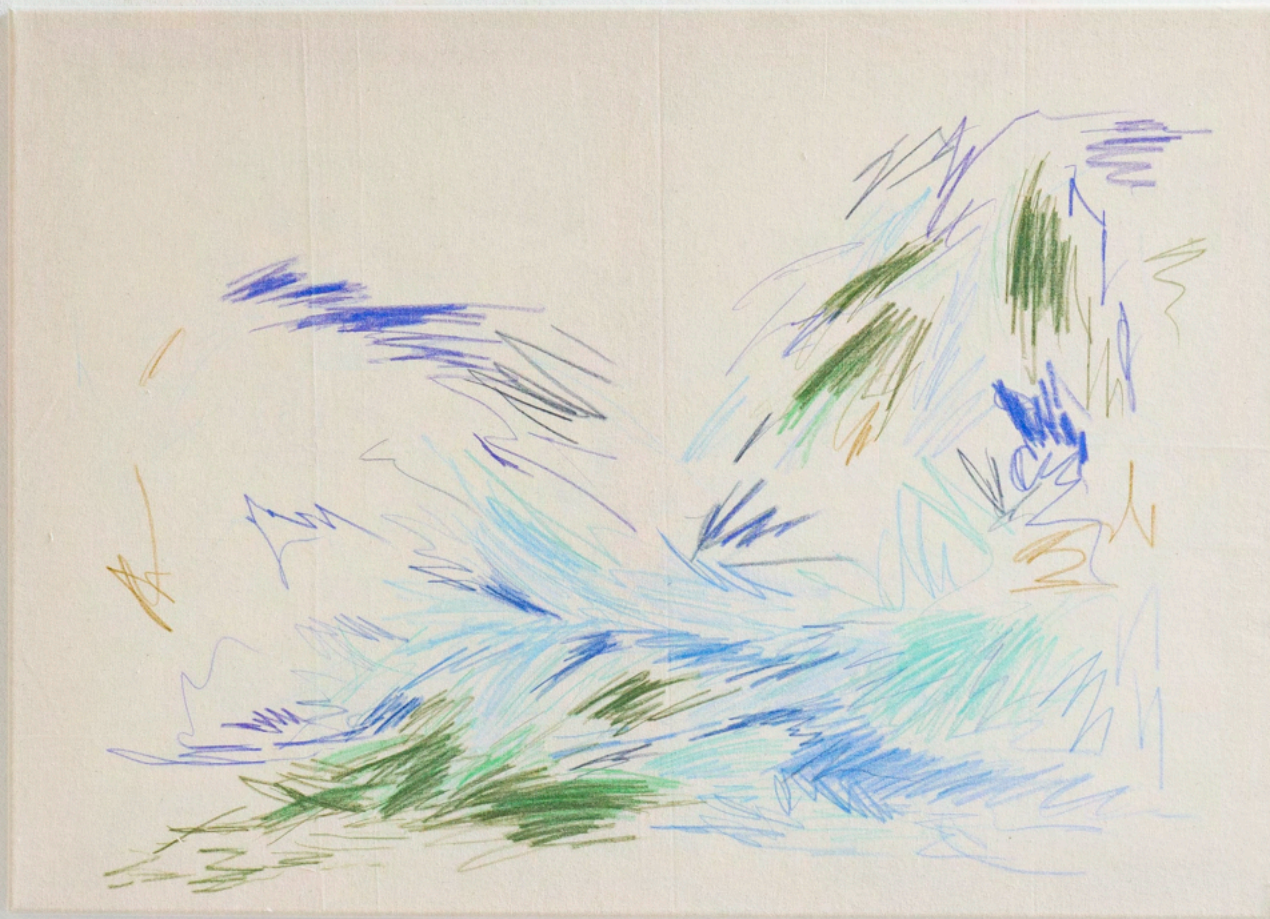
Digging into water, 2023 Colored pencil on raw canvas 50 × 70 cm