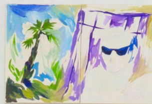
I miss the summer not the heat, 2024 Oil paint and colored pencil on canvas 40 × 60 cm