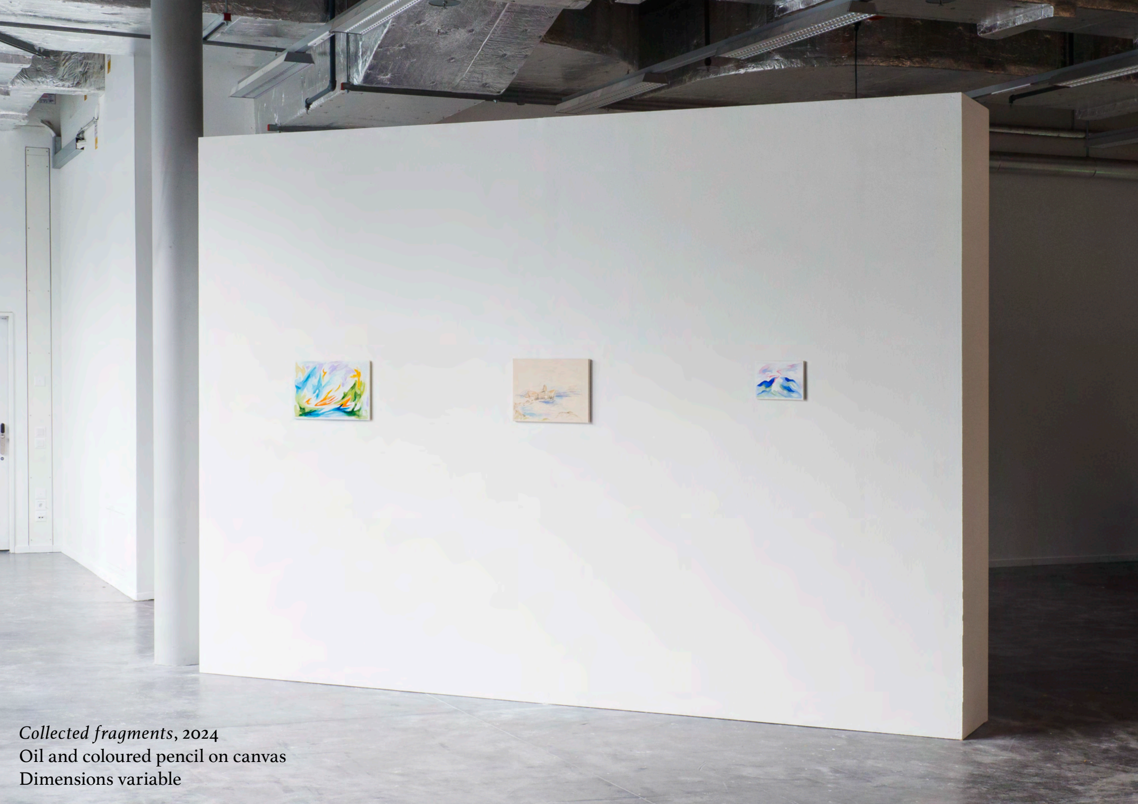
Collected fragments, 2024 Oil and coloured pencil on canvas Dimensions variable