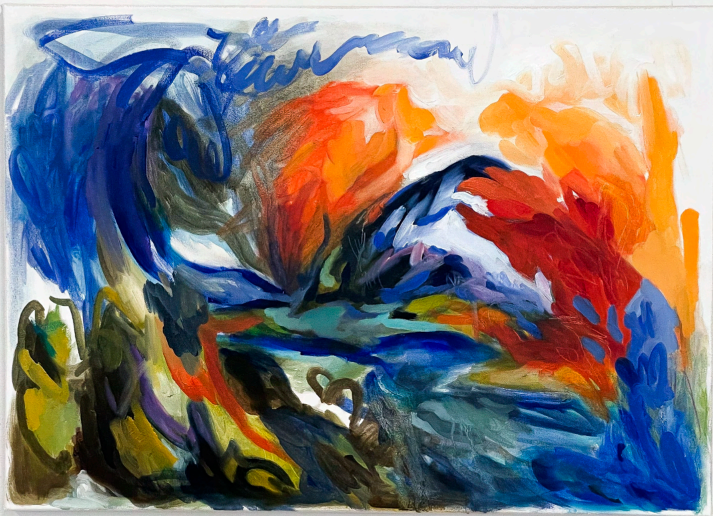
Untitled, 2025 Oil and coloured pencil on canvas 50 x 70 cm