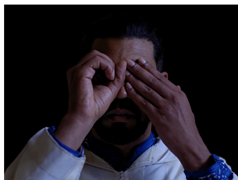
Bouchra Khalili, The Public Storyteller . Courtesy of the artist

Al Assifa and Al Halaka (Arabic for “the circle” and “the assembly”), were central to the MTA’s activism. The circular formation is the guiding force behind the exhibited works and their display at The Mosaic Rooms, manifesting the power of storytelling and performance in forming communities.