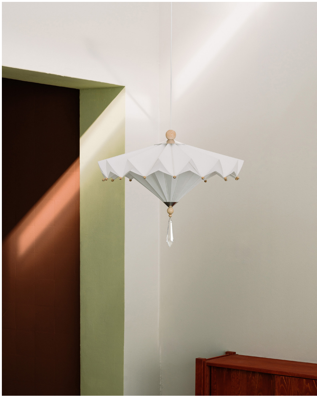
Harlequin Pendant Light