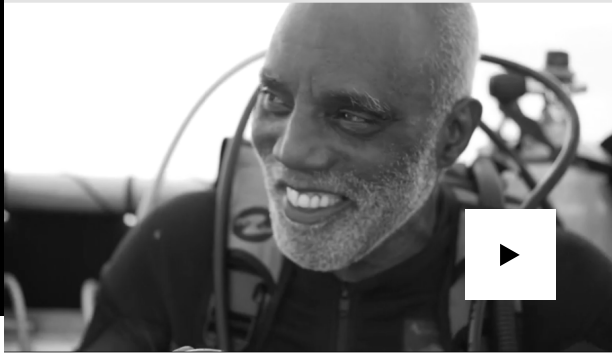
Diving With A Purpose – National Geographic