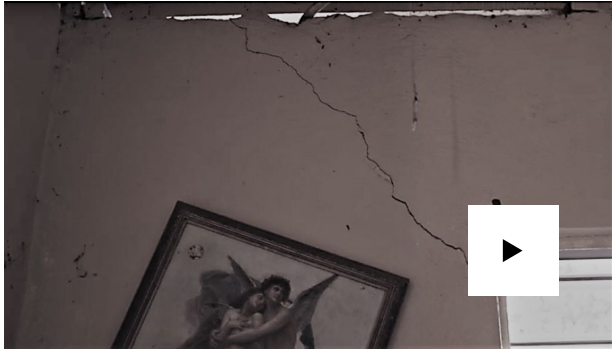
How to Survive an Earthquake - CBS