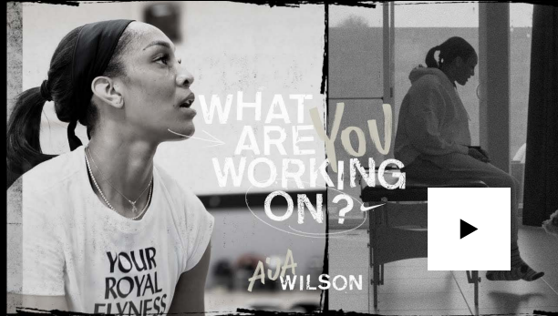
What Are You Working On? (Season 1 and 2) - NIKE