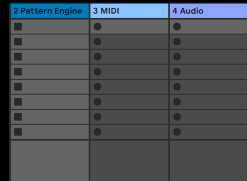
MIDI and Audio tracks set to record output from Pattern Engine