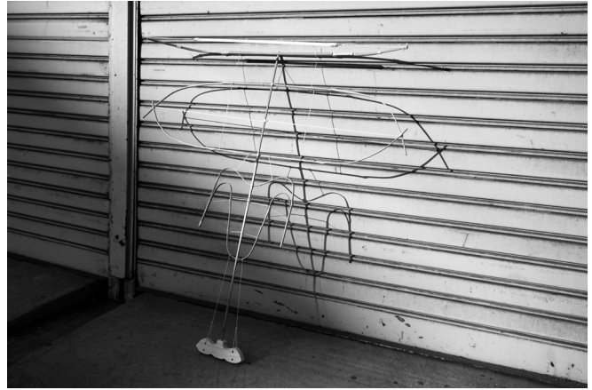
When the framework for the kite was just finished at the studio in Tokyo.

Over time, the significance of kite flying changed with evolving agricultural practices and belief systems. The tradition faced near extinction several times, notably during the oppressive Khmer Rouge regime in the 70s, which even imposed a ban on kite flying. Until the early 90s, only a few elderly individuals retained knowledge of crafting traditional Cambodian kites due to cultural suppression and threats like landmines. However, active efforts to keep this tradition alive began in 1994 with kite festivals, competitions, and educational events. The revival of Khleung Ek holds great cultural significance for Cambodians, symbolizing peace and serving as a link to their cultural identity.