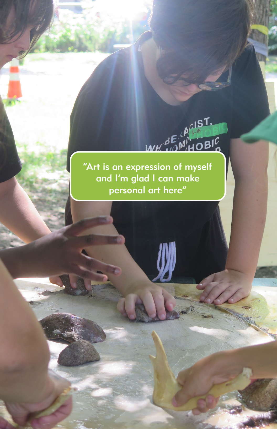
"Art is an expression of myself and I'm glad I can make personal art here"