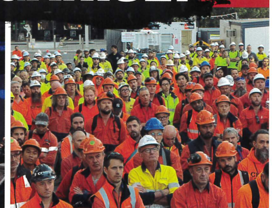
CONSTRUCTION MEMBERS MEETING WA