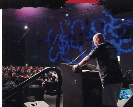
MUA NATIONAL CONFERENCE