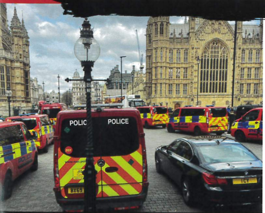
COPS TURN OUT IN FORCE AT LONDON RALLY