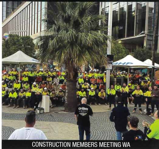
CONSTRUCTION MEMBERS MEETING WA