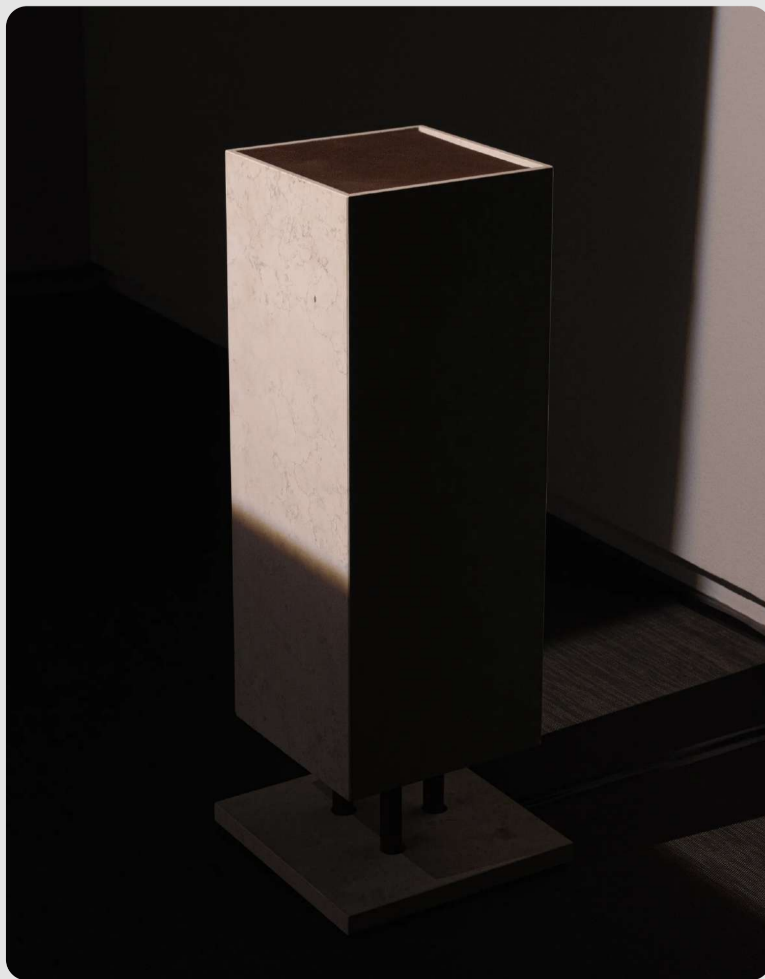
OD-11 IN MARBLE

The exhibition is dark, the marble figures dissected and raw. A rolling drone sounds in the distance as a murmur of a voice becomes louder upon approach. One of the pieces in the exhibition is a poem written and read by 070 Shake, playing out of an OD-11 subtly encased inside a hollow marble pillar.