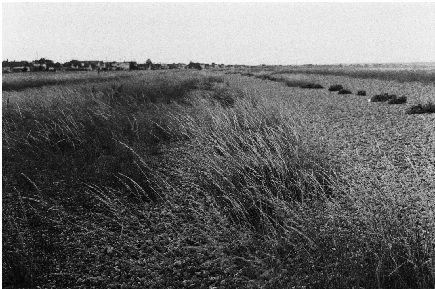
A heart in the distance.