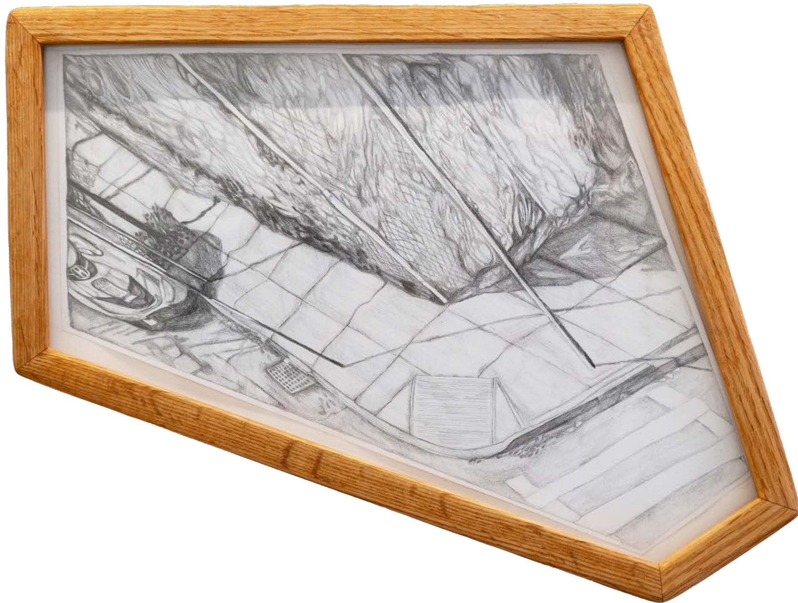
Neal Cashman Sidewalk Perspective [pair], 2024 Graphite on Paper, Oak Frame 16 x 12 in $600