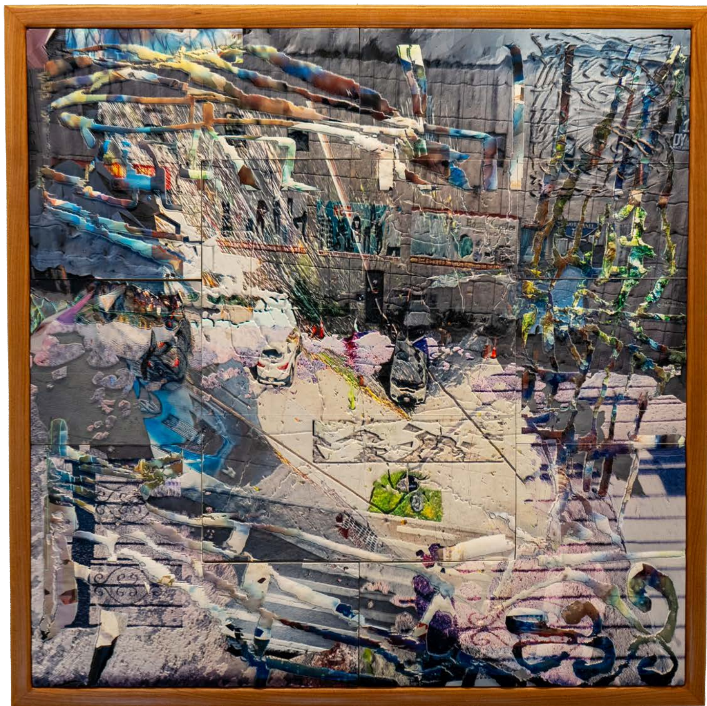
Neal Cashman Compression Projector, 2025 Cast Plaster, UV print, Cherry Frame 27 x 27 in $2500