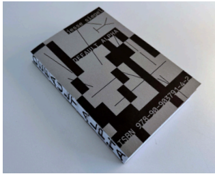
Book: Default Alpha, 2024 18 x 12 cm Edition 300

Default Alpha: Mapping the Emergence of Synthetic Culture in New Town is a literary bridge between one cultural non-place to another; from Cancun, Mexico — a popular resort created as a planned new town by the Mexican government to increase foreign tourism — to Almere — a planned city created by the Dutch government to ease the housing concerns in Amsterdam. Both cities were founded around the same time, yet in two vastly different countries. The book is a personal journey tracing the unlikely commonalities between both places.