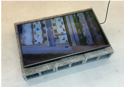
Correspondencias (Cancun) , 2017 7 min 22 sec (Loop, no audio), drone operator: Eli Siegel TV Monitor, cinderblocks 28x 117 x 77 cm Edition 1/3 + 1 AP

This book was made possible with the support of Amsterdams Fonds voor de Kunst