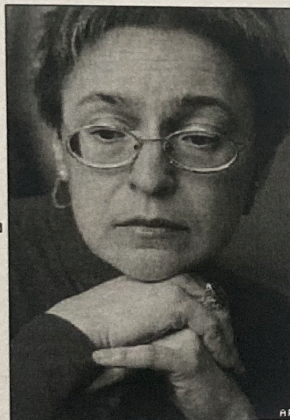
Politkovskaya's reports exposed alleged abuses of power by officials