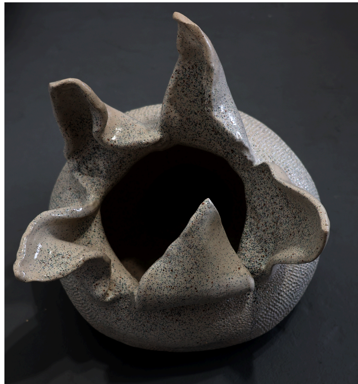
CAMINO HACIA LA RAÍZ DE UNA GEOMETRÍA INTERRUMPIDA, 2025 GLAZED WHITE GRES 40 X 30 X 28 CM.