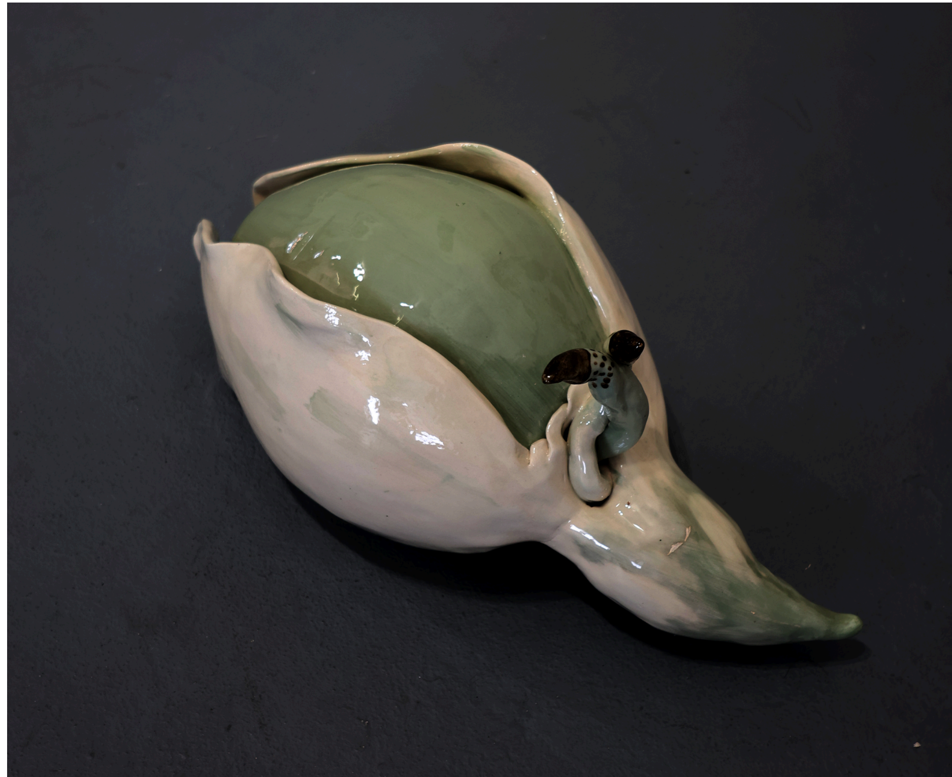
I BLOOM WHERE THERE IS LOVE, 2025 PIGMENTED WHITE GLAZED CLAY 10 X 20 X 15 CM