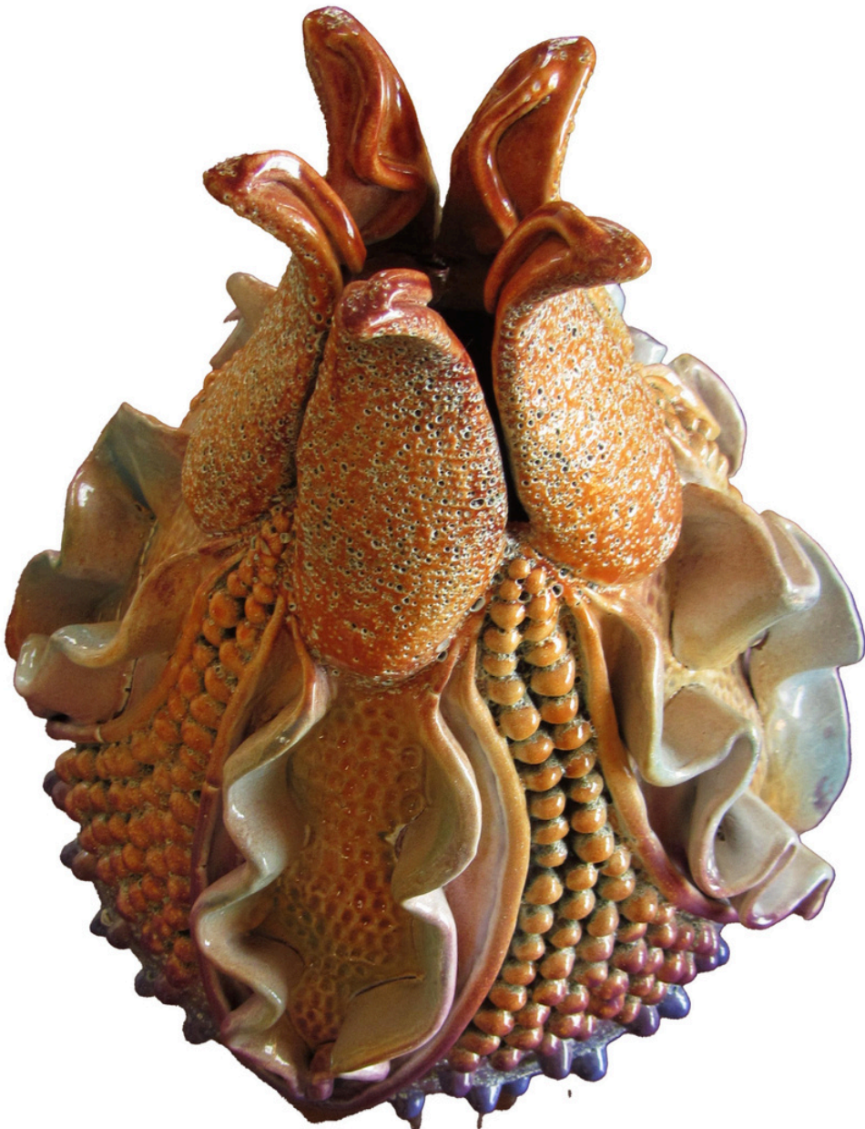
GLAZED TERRACOTTA 40X30X40CM