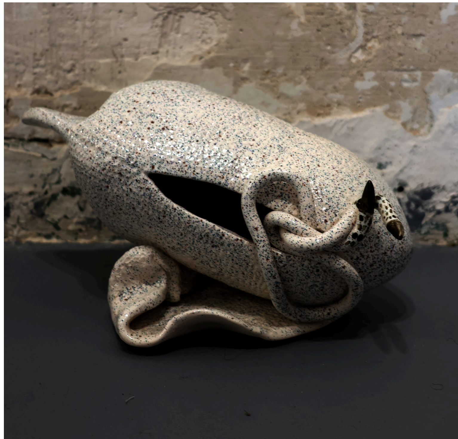
MITO DE LUZ , 2025 GLAZED WHITE CLAY 25 X 15 X 10 CM