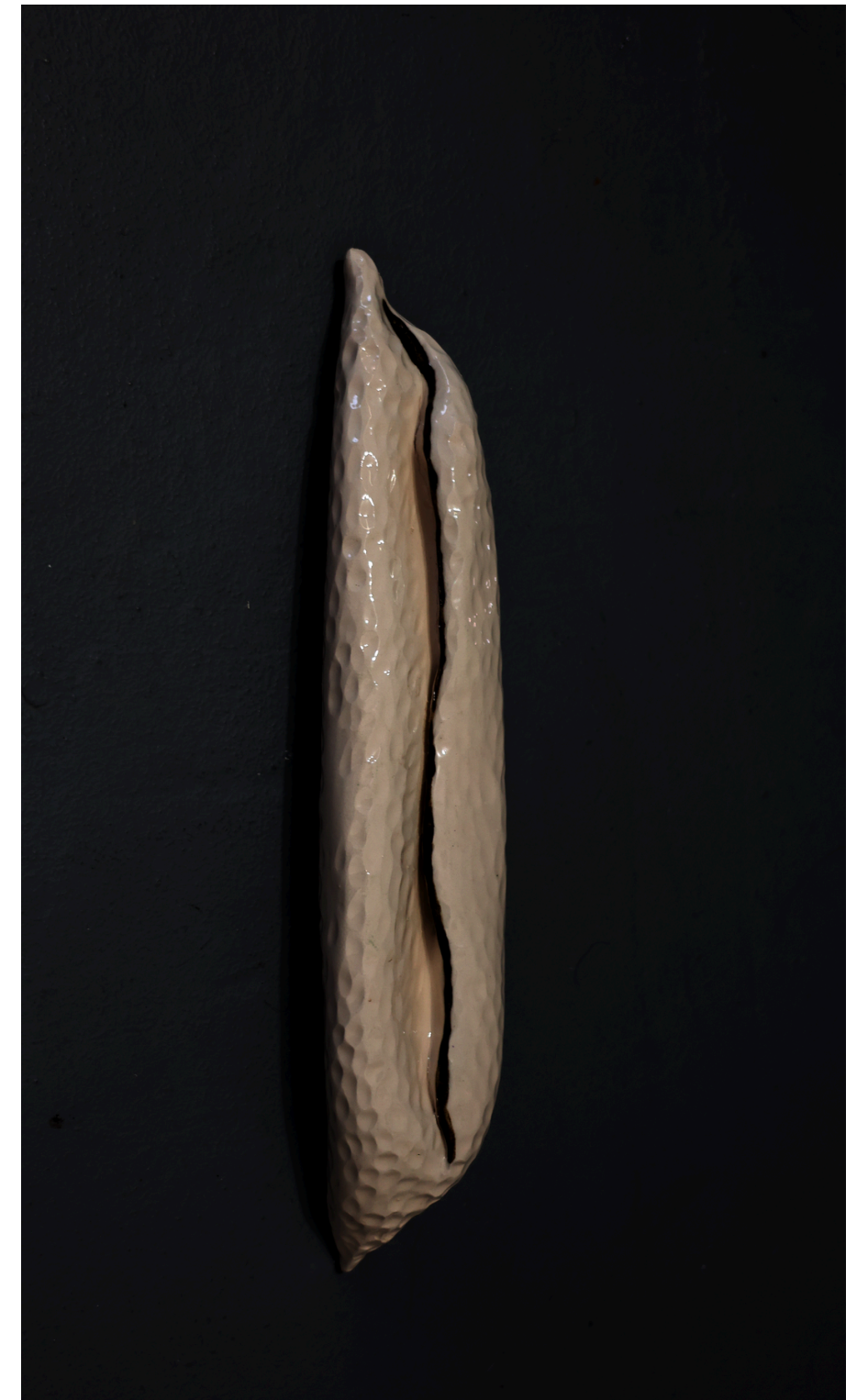
BROTOS , 2025 GLAZED WHITE CLAY 35 X 24 X 18CM