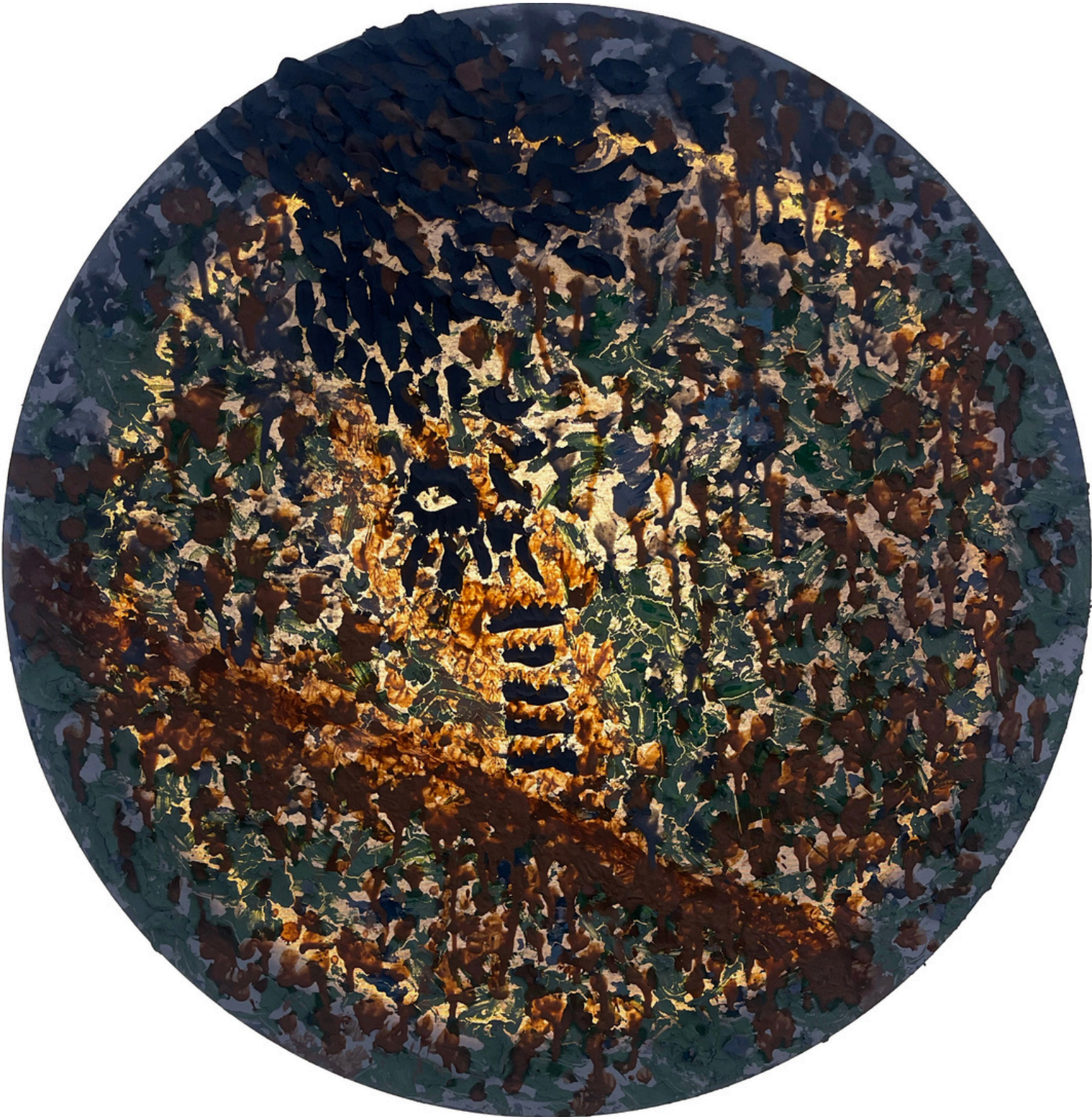
PIGMENTED CLAY Ø80