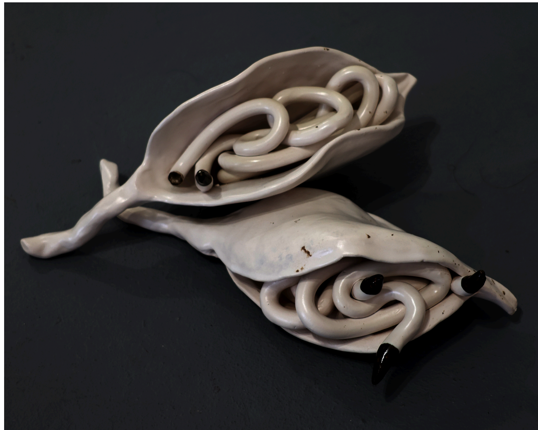
UNEXPECTED BIRTH, 2025 GLAZED WHITE CLAY 8 X 15 X 10 CM