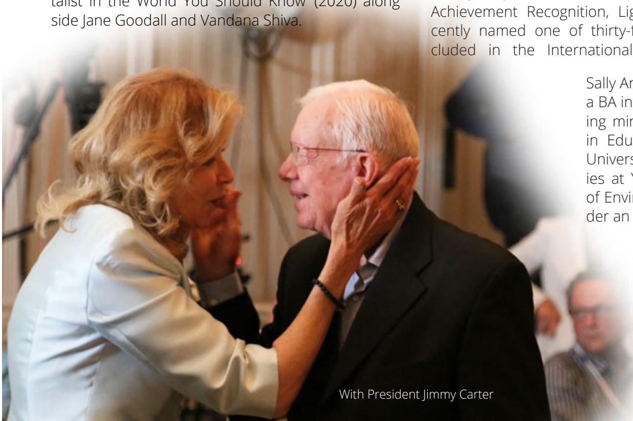
With President Jimmy Carter