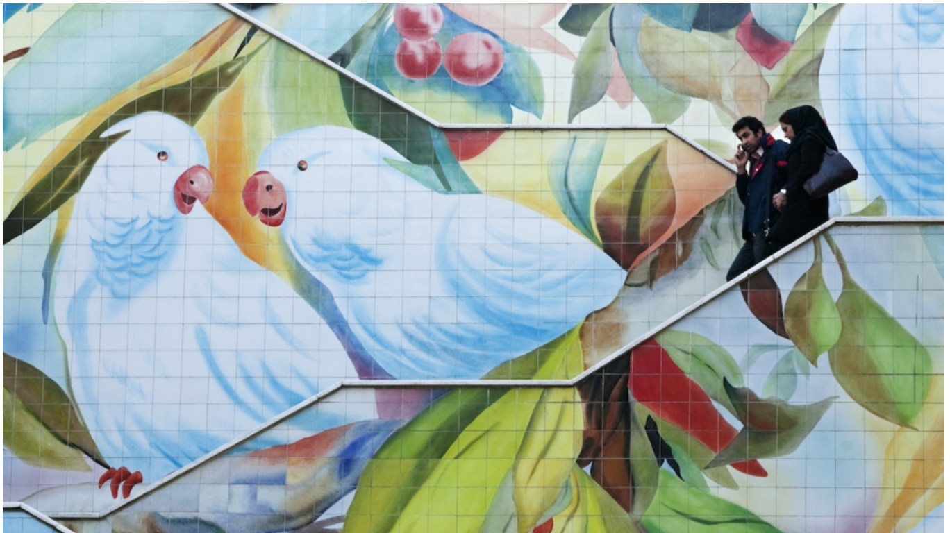
An Iranian couple walks down a stairway decorated with a tile mural in northern Tehran, Feb. 26, 2012.