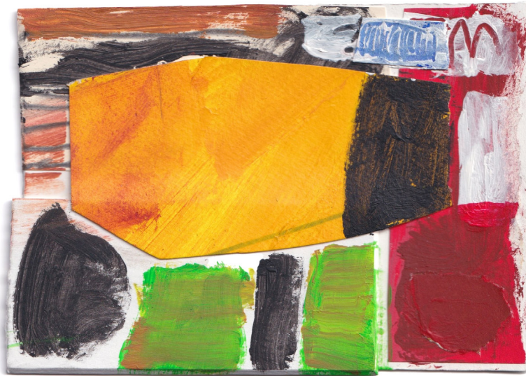
Tanjengong 2024 mixed media collage 10 x 15cm $100 AUD