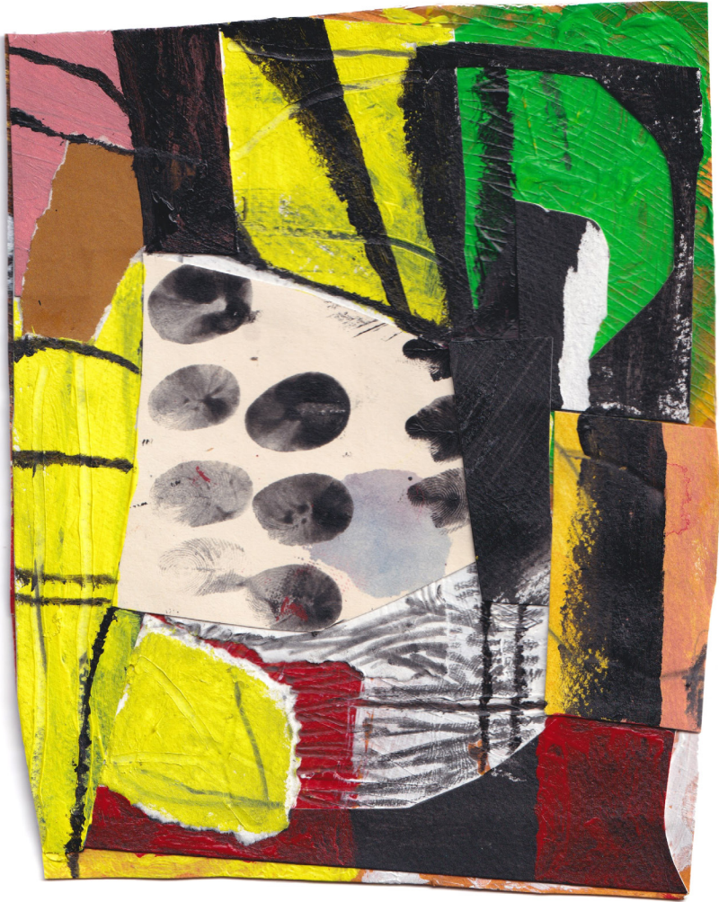
Second Life 2024 mixed media collage 20 x 16cm