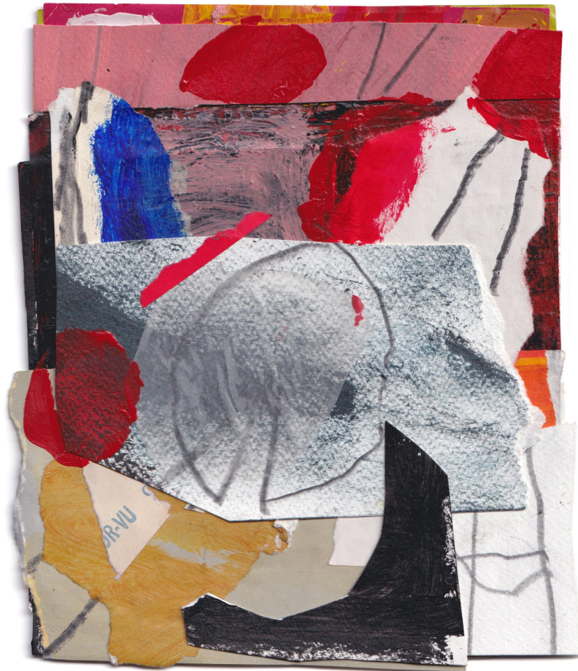
Foreign Sensations 2024 mixed media collage 19 x 16cm