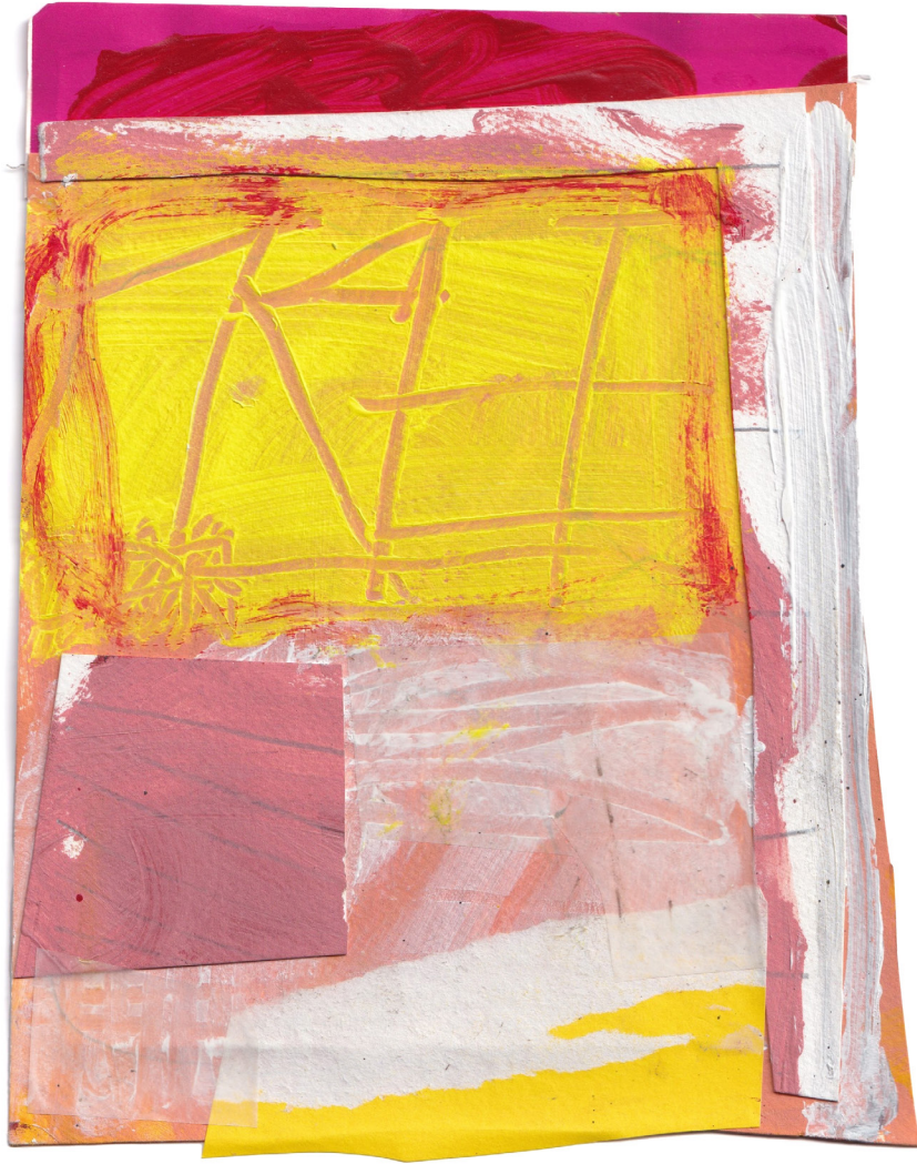
FREE 2024 mixed media collage 21 x 15cm $120 AUD