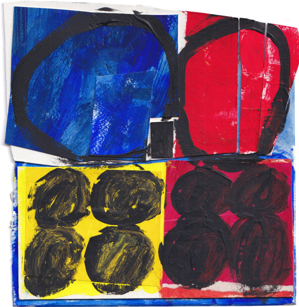
Open 2024 mixed media collage 21 x 20cm