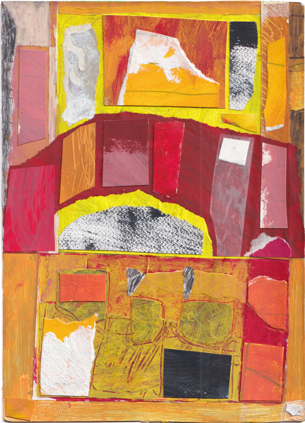
SLOW DOWN 2024 mixed media collage 29 x 21cm