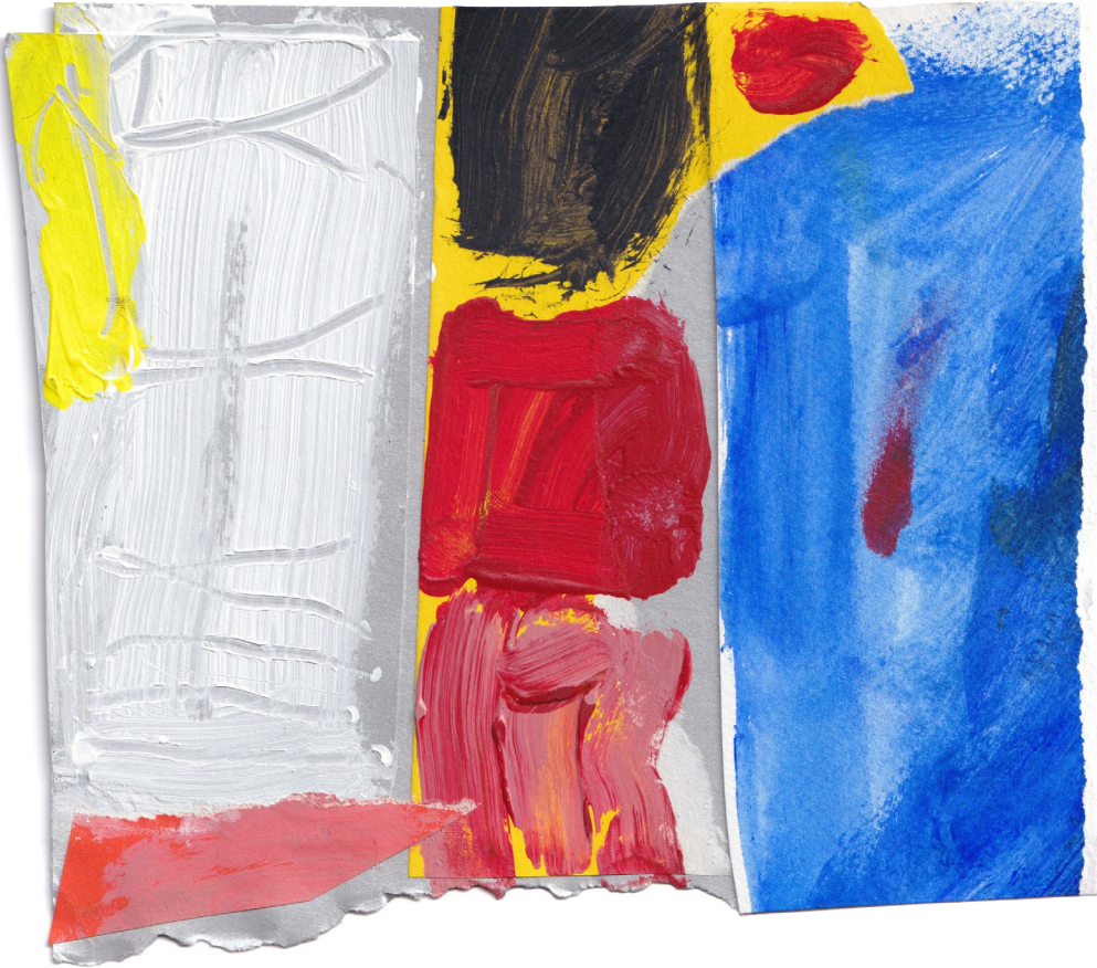
Vicarious Living 2024 mixed media collage 17 x 19cm