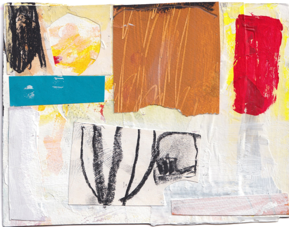
Over Under 2024 mixed media collage 14 x 19cm