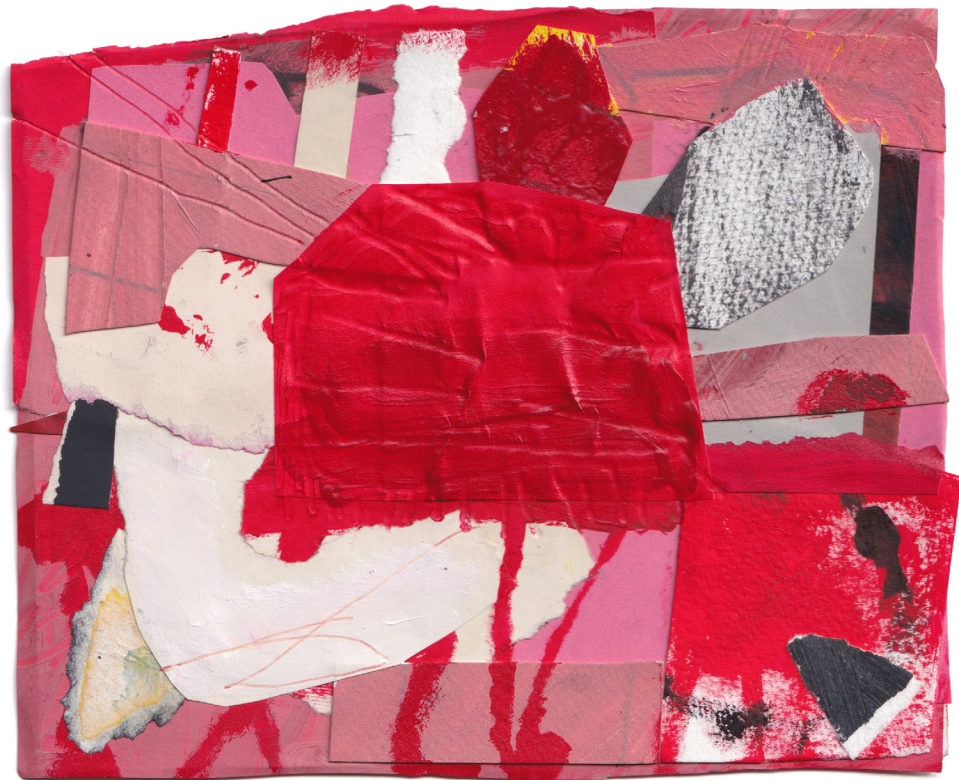
Broken Body 2024 mixed media collage 15 x 19cm