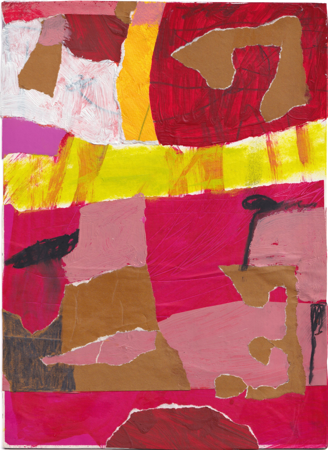
Through It All 2024 mixed media collage 29 x 21cm