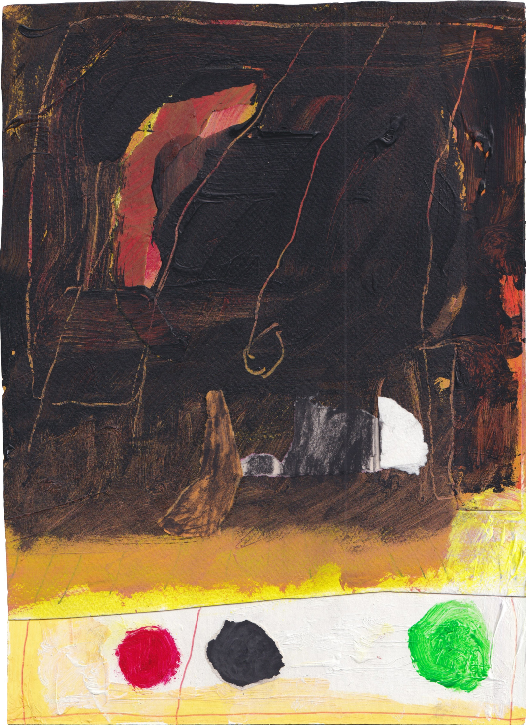
Solemn Dirge 2024 mixed media collage 29 x 21cm