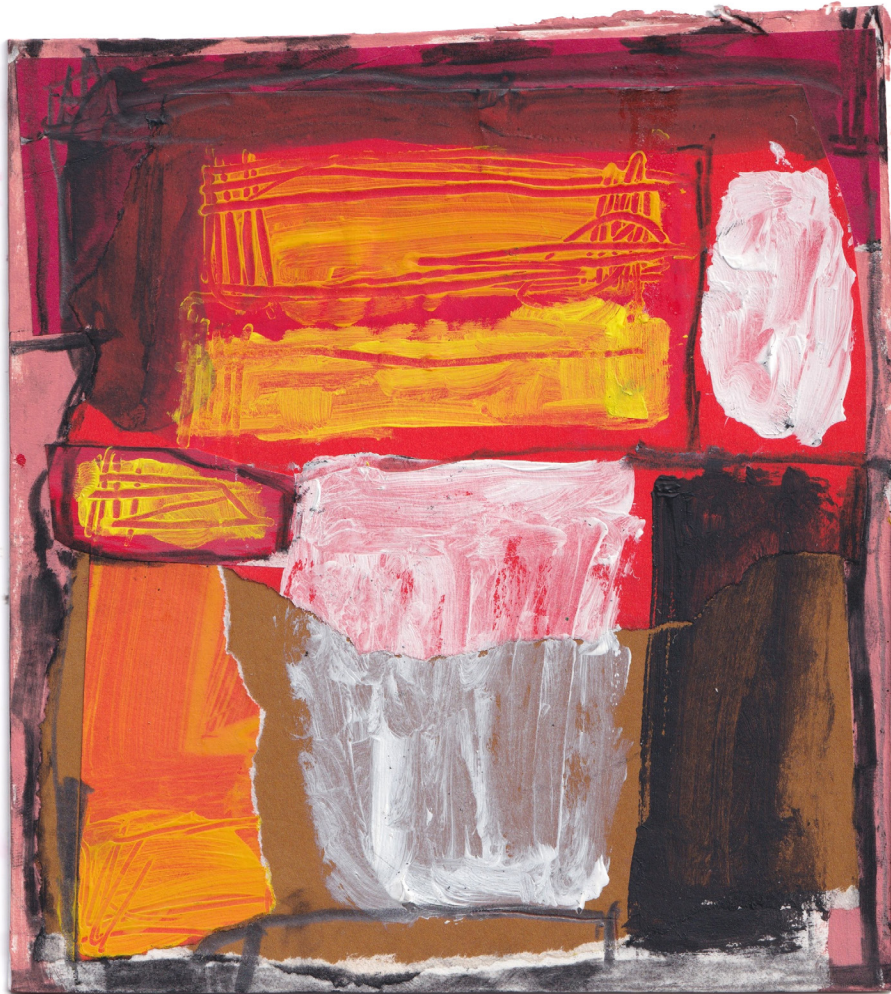
Further Along 2024 mixed media collage 20 x 18cm