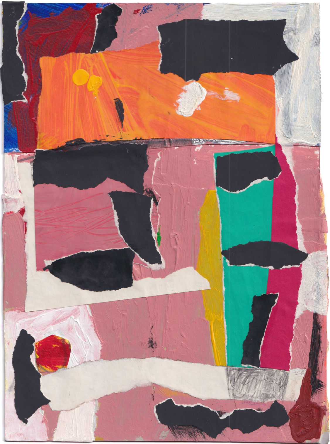
Impaired Vision 2024 mixed media collage 29 x 22cm