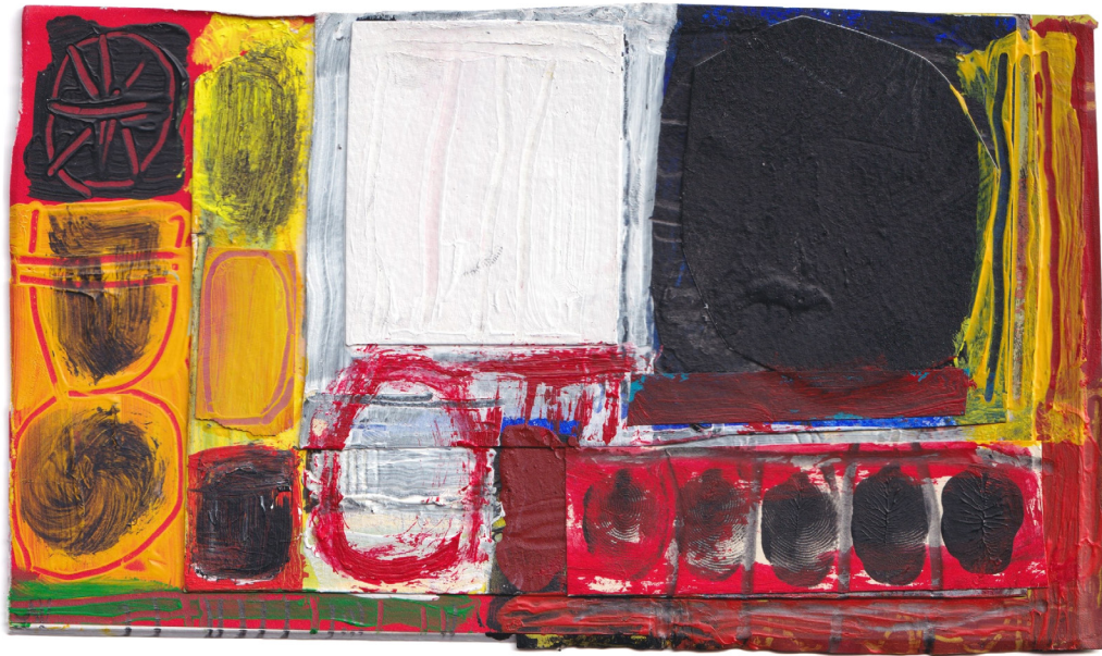
Peaks & Valleys 2024 mixed media collage 12 x 20cm