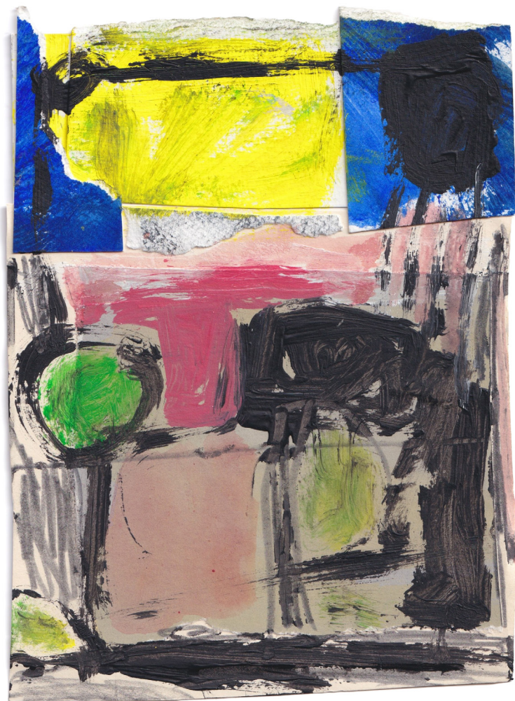
Flare-up 2024 mixed media collage 19 x 14cm