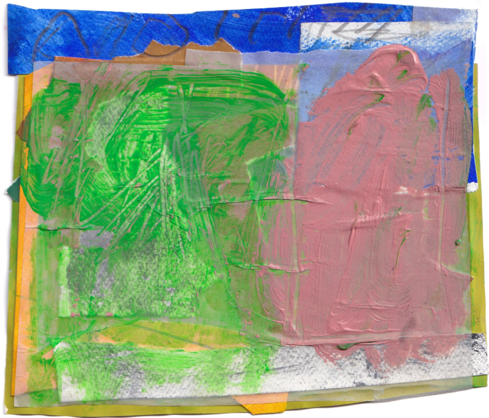
Room With A View 2024 mixed media collage 16 x 19cm