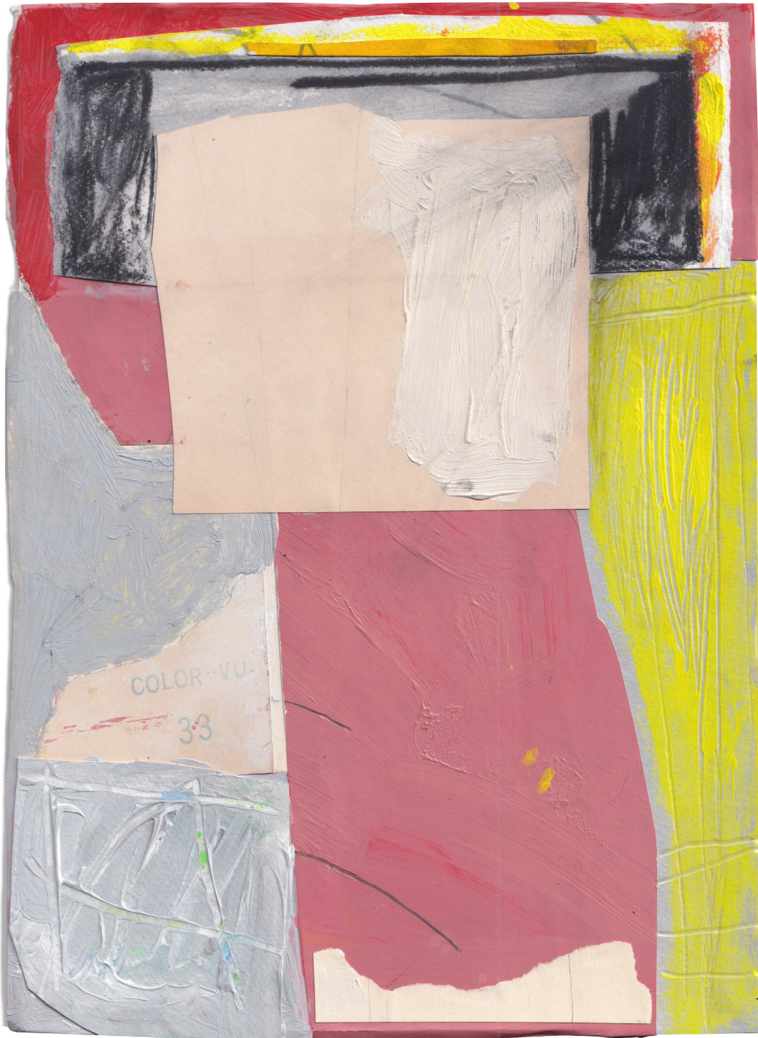
Harmony 2024 mixed media collage 30 x 21cm