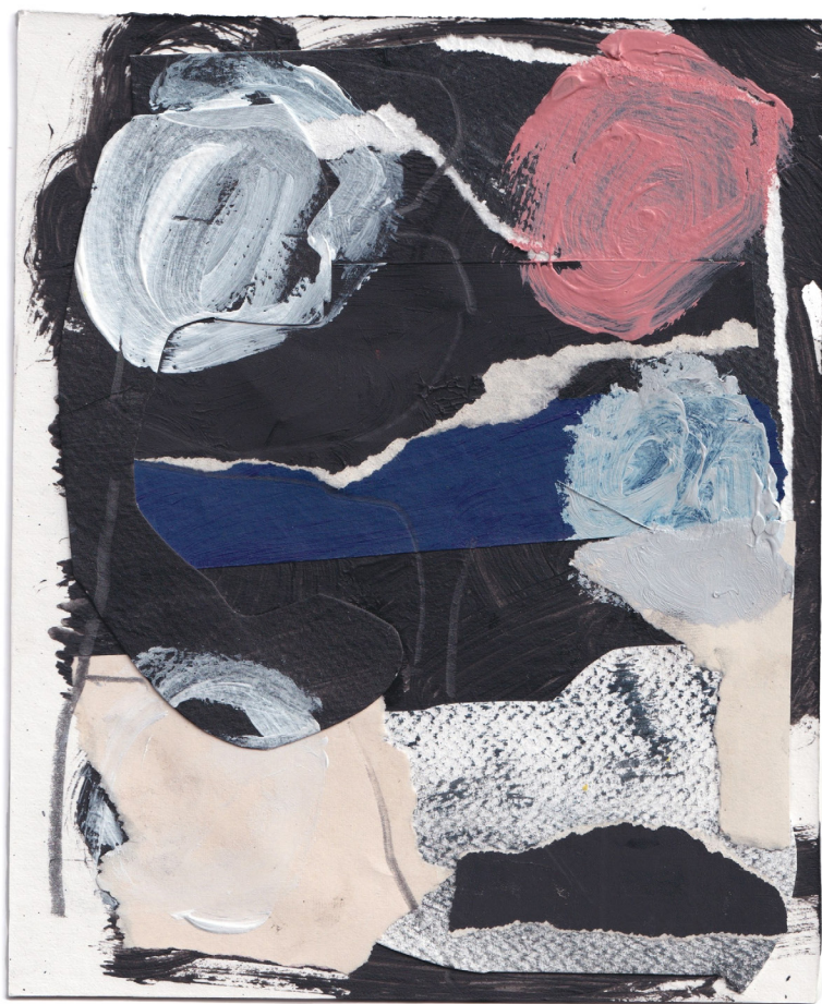
Energy Taken At Night 2024 mixed media collage 18 x 15cm