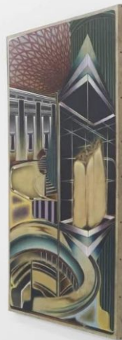
Install Shots from Through closed eyes, Darkly, Gallery Belenius, Stockholm (Group Show) 2025.