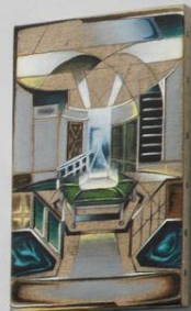
Install Shots from Nowhere To Be, L.U.P.O. Lorenzelli Projects, Milan (Group Show) 2025.