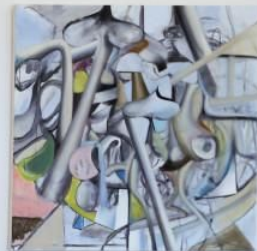
Beautiful Little Rapture at The Something Machine, Bellport, New York, (Solo Show) 2024.