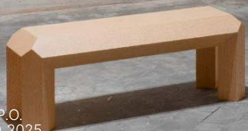
Install Shots from Nowhere To Be, L.U.P.O. Lorenzelli Projects, Milan (Group Show) 2025.