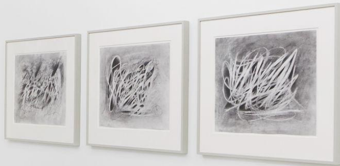
Install Shots from Through closed eyes, Darkly, Gallery Belenius, Stockholm (Group Show) 2025.