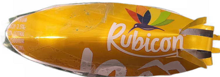
Birdseye view of the metal slug.

A material experiment using a waste object (aluminium cans). Instead of melting the cans down using a highly energy intensive process and using moulds made from environmentally damaging plaster, I created a net that would use one shape (with cut-outs) to form a three-dimensional slug.