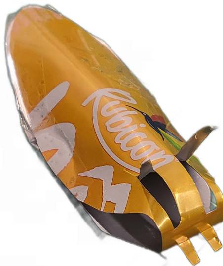
Diagonal front view of the metal slug.