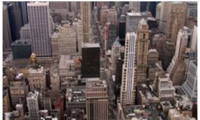
ART GUIDE New York