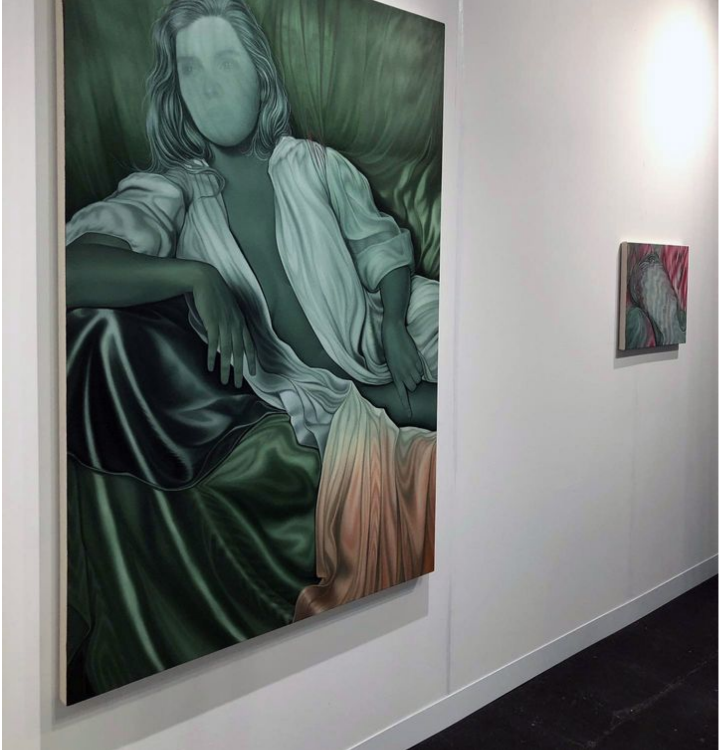
Jenny Morgan, Cloaked (2022). Oil on canvas. 177.8 x 121.9 cm.