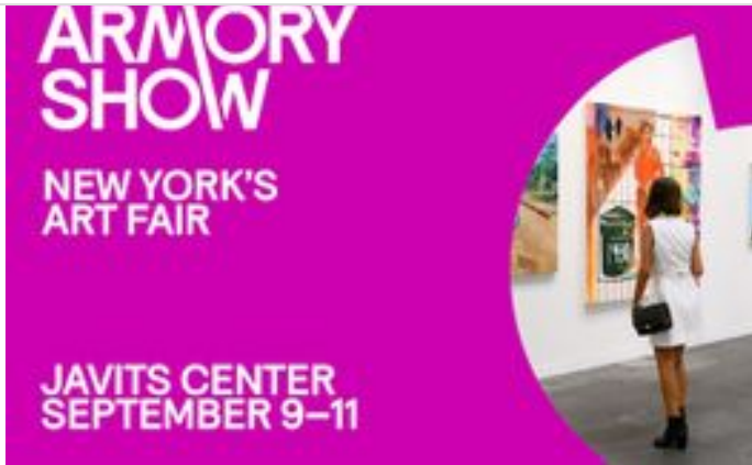
ART FAIR The Armory Show 2022