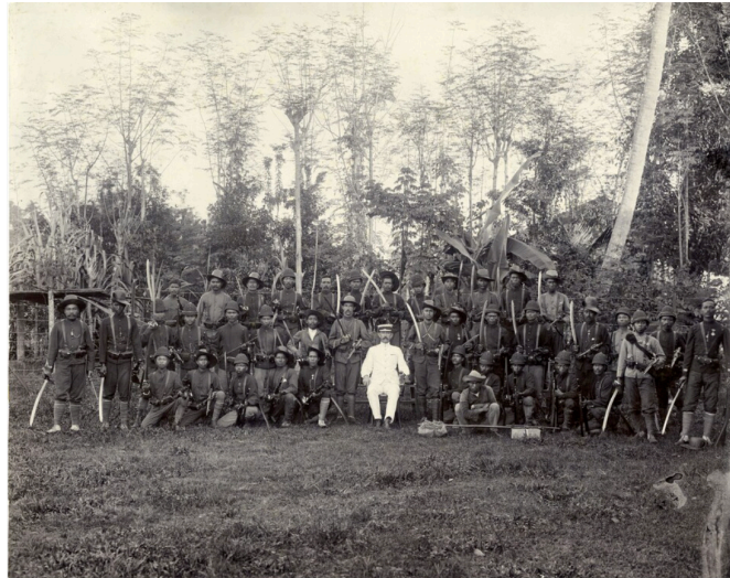
FIGURE 7 Group portrait of KNIL soldiers, probably in Aceh at the beginning of the twentieth century. The soldiers are holding M95 rifles and 'klewangs' (swords). Collection Museum Bronbeek, 2006/00-42-8.