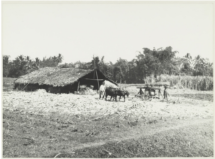
FIGURE 3 Enforced planting of sugar cane due to the Cultivation System, on the Malang plain, Kreet area, 1870.

for the Dutch and famine among the Javanese.