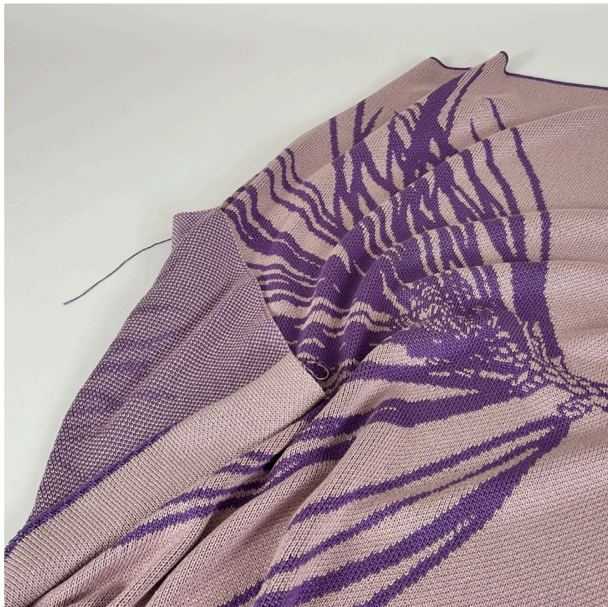
torrey pine knit, bamboo yarns