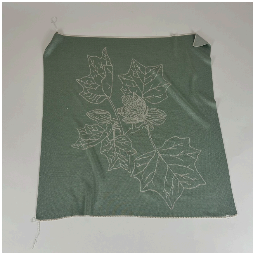
tulip tree knit, bamboo yarns