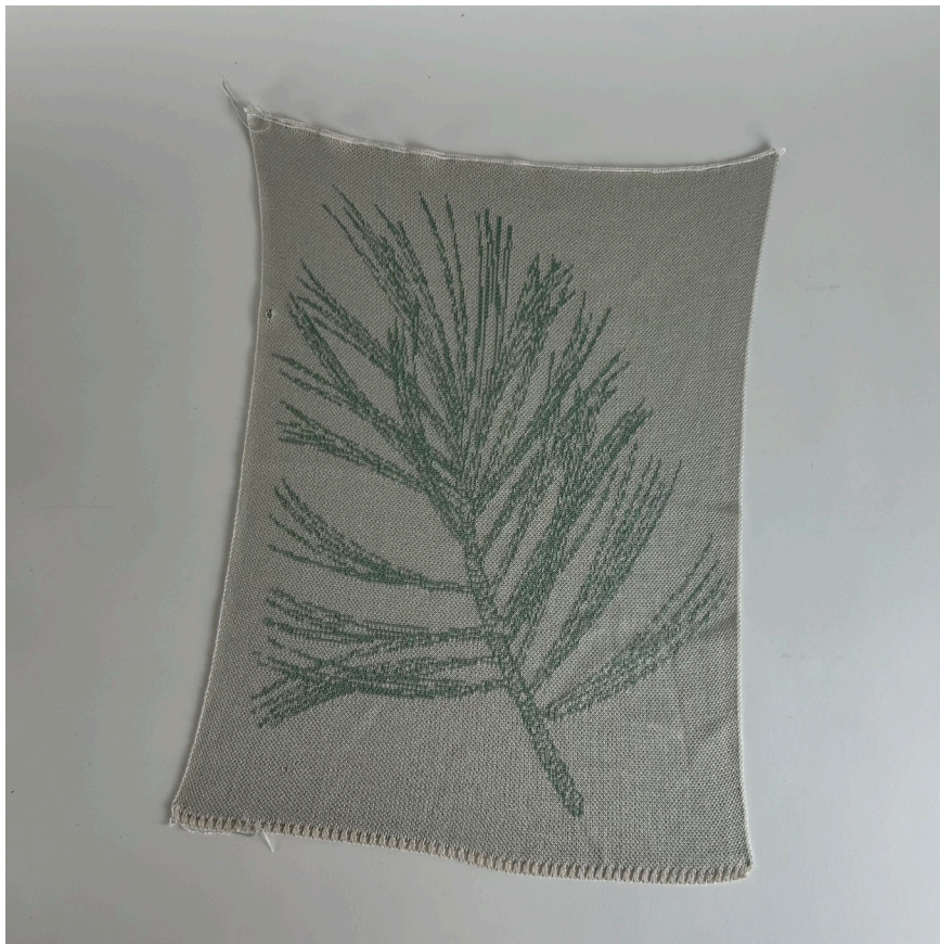
eastern pine knit, bamboo yarns