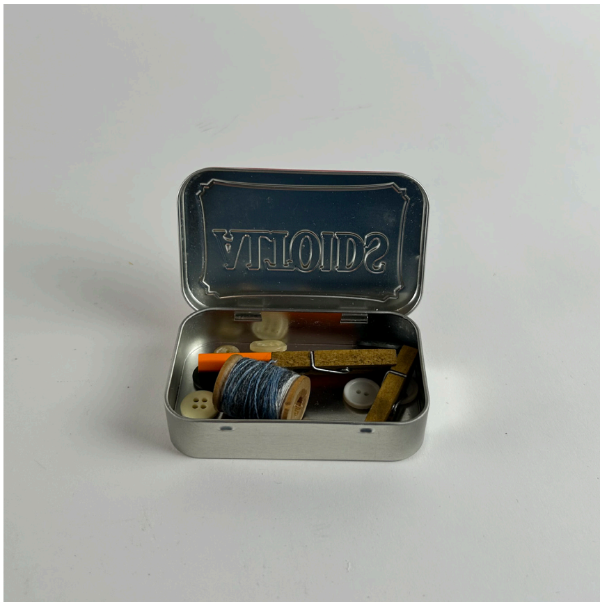
sewing kit, altoid tin and recovered sewing supplies