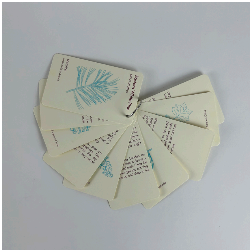
plant identification cards, risograph