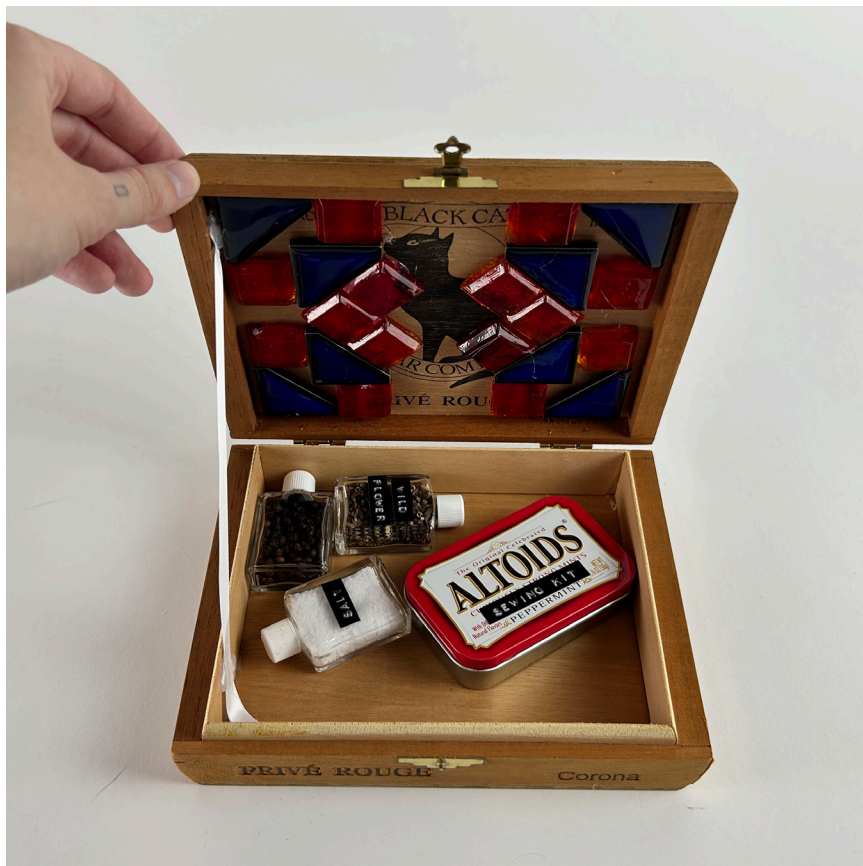
memory box, cigar box and recovered tiles