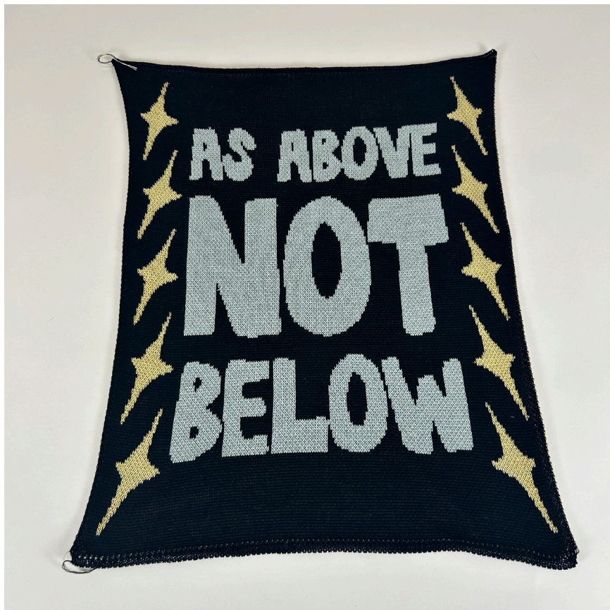
the below collective banner, cotton yarns