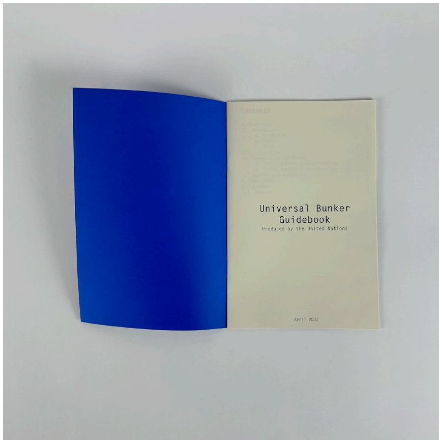
universal bunker guidebook