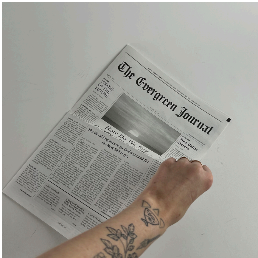
the evergreen journal, newsprint