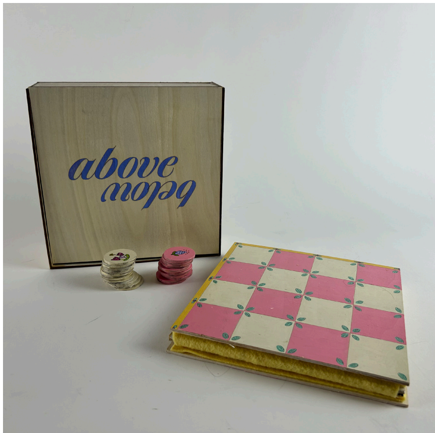
checkers board, basswood and paint