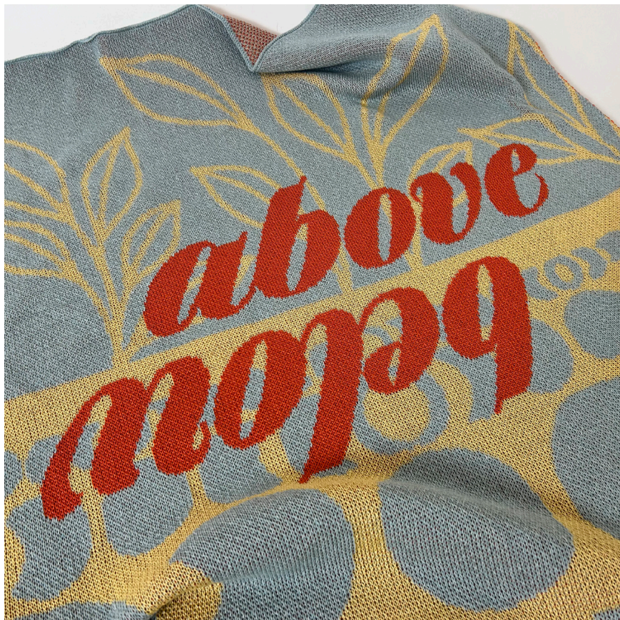
above/below blanket, bamboo and cotton yarns