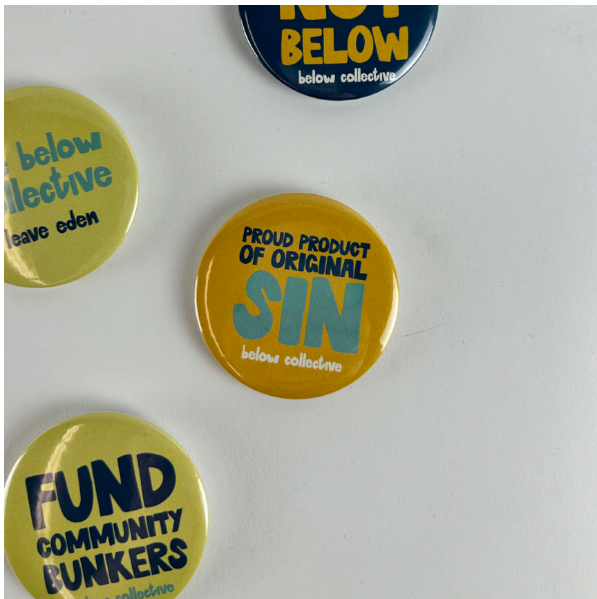
the below collective pins