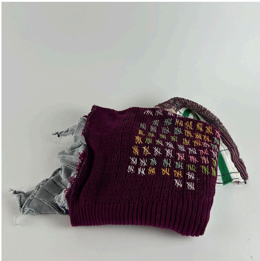
scrap blanket, various fibers