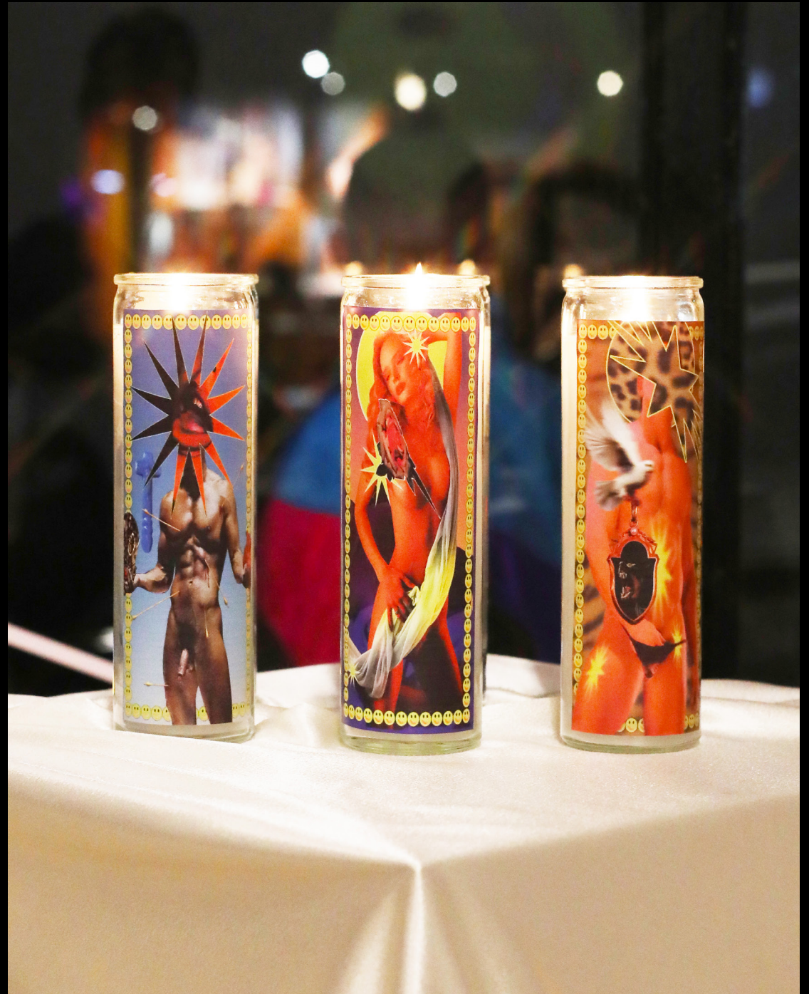
ST SEBASTIAN CANDLE ST ROSE OF LIMA CANDLE ST FRANCIS OF ASSISI CANDLE