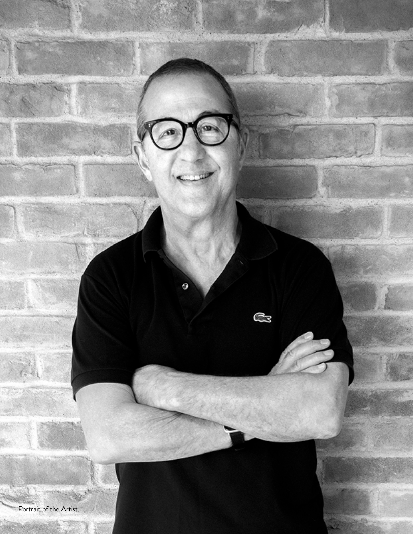
Portrait of the Artist.