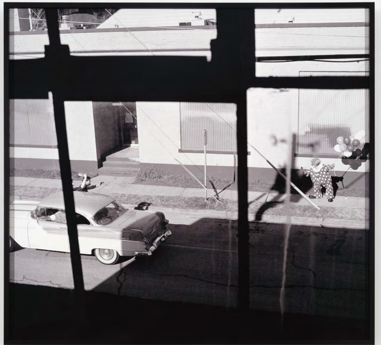
Real Pictures #8 1988 Archival print on photo paper Edition 10 of 10 49 x 53 x 2 in (framed) (123.19 x 130.18 x 5.08 cm) $50,000