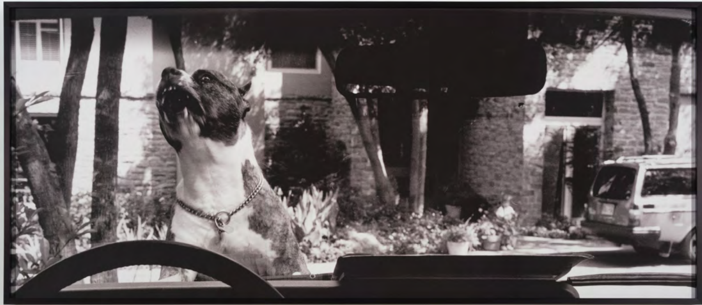
Real Pictures #10 (installation view)