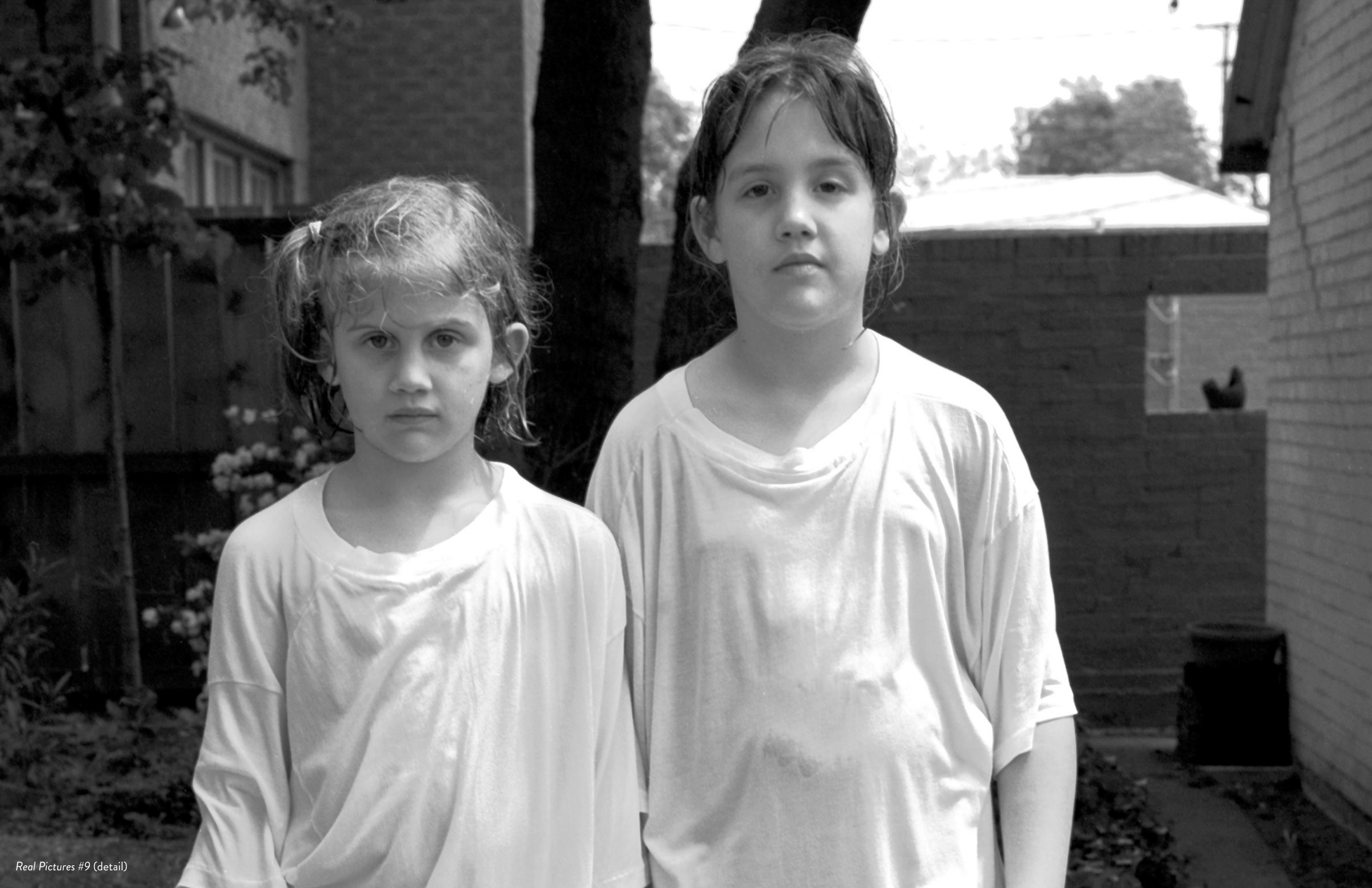
Real Pictures #9 (detail)