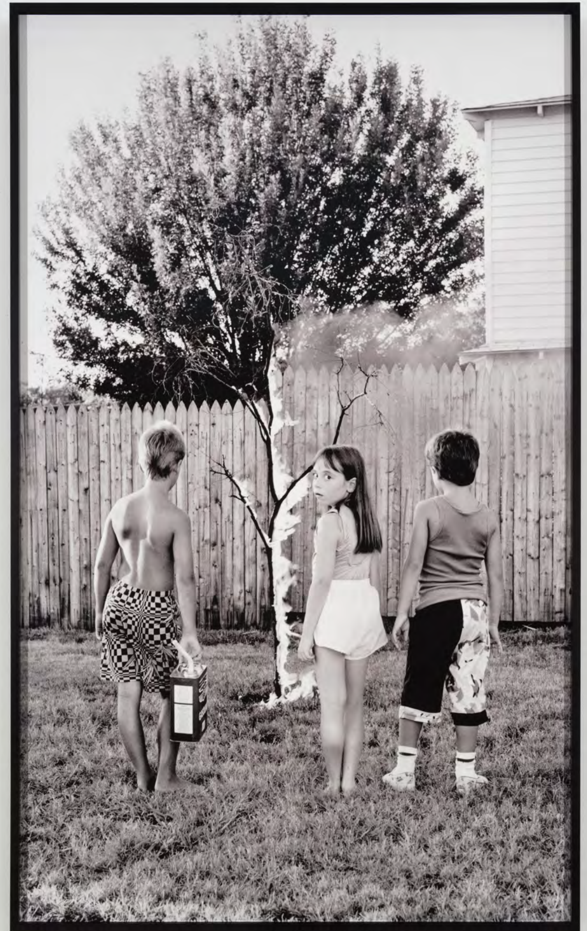
Real Pictures #11 1988 Archival print on photo paper PP 1/1 80 x 49 x 2 in (framed) (203.20 x 124.46 x 5.08 cm) $100,000