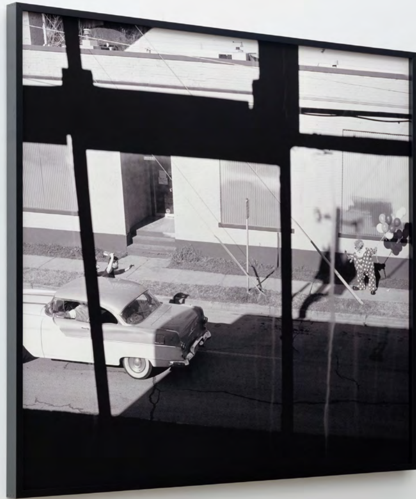
Real Pictures #8 (installation view)