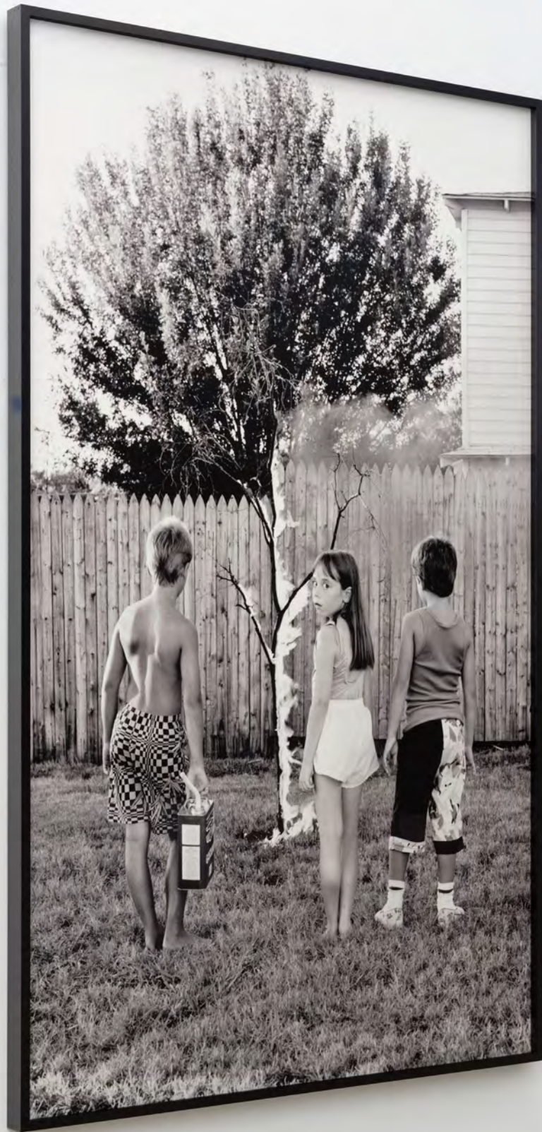
Real Pictures #11 (installation view)