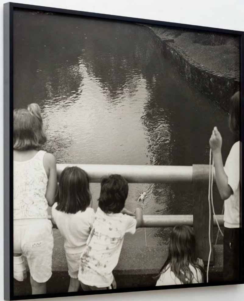
Real Pictures #15 (installation view)