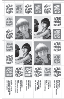
STAMP SHEET $10.00 (PROCEEDS BENEFIT POW GIRLS)