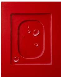
Harald Erath , Moist Crimson , 2024 Egg tempera on canvas 24 x 30 cm