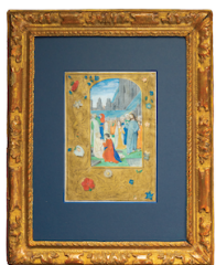
Master of Mary of Burgundy (workshop of) , The Resurrection of Saint Lazarus , c. 1480-1485 One illuminated leaf from a Book of Hours (tempera, ink and gold on vellum) 12.3 x 17.1 cm (framed: 26.3 x 32.6 x 2 cm)