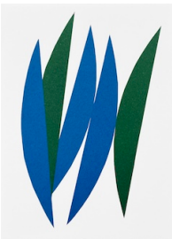
Tetiana Kartasheva , Color Studies #2 , 2024

Origami paper collage 16 x 22 cm (framed: 20 x 26 x 3 cm)