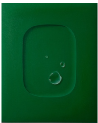
Harald Erath , Soaked Chartreuse , 2024