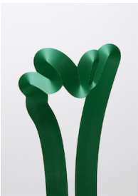
Audrey Julien & Arno Mathies , Print 019 Ultra Green , 2024 Unique print on paper 29.7 x 42 cm (framed: 31.5 x 43.5 x 3 cm)