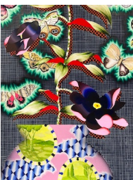
Laura Thiong-Toye , Murmures d'été , 2024 Acrylic and ink on paper mounted on wood 59 x 79 x 4.5 cm