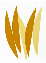
Tetiana Kartasheva , Color Studies #3 , 2024

Origami paper collage 16 x 22 cm (framed: 20 x 26 x 3 cm)