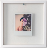
Stuart Sandford , Polaroid Collage LXVI , 2021 Unique, signed en verso, framed with museum glass 21 x 21 x 2 cm