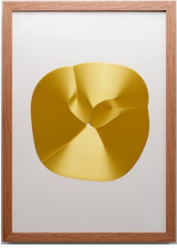
Audrey Julien & Arno Mathies , Print 000 Gold , 2024

Unique print on paper 21 x 29,7 cm (framed 22.5 x 31.5 x 3 cm)