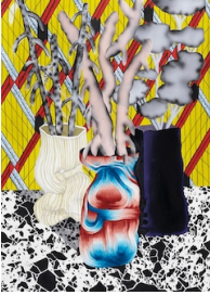
Laura Thiong-Toye , Waiting for summer , 2020 Acrylic and ink on paper 56 x 75 cm (framed: 61.5 x 81.5 x cm)