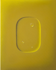
Harald Erath , Drenched Gold , 2024