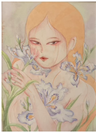
Yen Melia Andreas , Kissed by Iris , 2024 Watercolor on paper 17 x 23 cm (framed: 18.5 x 24.5 x 2 cm)