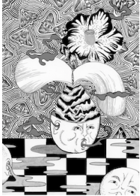
Laura Thiong-Toye, NB 4 , 2022 Chinese ink and pen on paper 25 x 36 cm (framed: 29.5 x 40.5 x 2.5 cm)