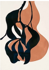
Simon Heusser , Hanging Garden , 2024

Monotype, algae pigment on paper 69 x 99 cm (framed: 78 x 108 x 3.5 cm)