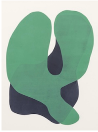
Simon Heusser , Endless Growth (L) , 2024 Monotype, algae pigment on paper 118 x 137 cm (framed: 125.5 x 145 x 4.5 cm)