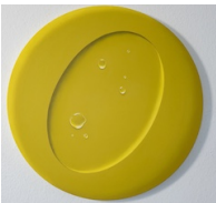
Harald Erath , Dripping Gold , 2024 Egg tempera on canvas ø 40 cm