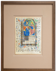
Master of Boucicaut (follower of) , The Coronation of the Virgin , executed in Paris, circa 1430 One illuminated leaf from a Book of Hours (tempera, ink and gold on vellum) 9.6 x 13.6 cm (framed: 19.5 x 25.5 x 3 cm)