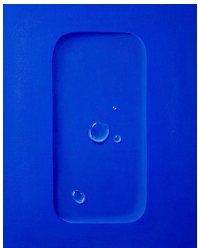
Harald Erath , Saturated Sapphire , 2024