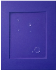
Harald Erath , Damp Purple , 2024