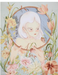
Yen Melia Andreas , Unseen Reality , 2023 Watercolor on paper 80 x 100 cm (framed: 86 x 106 x 3 cm)