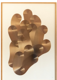
Audrey Julien & Arno Mathies , Print 038 Olive Gold , 2024

Unique print on paper 70x100 cm (framed: 72.5 x 102.5 x 3 cm)