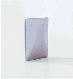
L.2018-135.7 Conversation Piece "Kino" series, 2014-2016 Optical film used in smart phones, gold, and titanium 3 × 2 × 1/2 in. (7.6 × 5.1 × 1.2 cm)