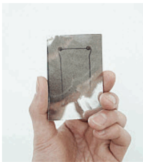
L.2018-135.8 Conversation Piece "Kino" series, 2014-2016 Optical film used in smart phones, gold, and titanium 2 15/16 × 2 × 9/16 in. (7.5 × 5.1 × 1.5 cm)