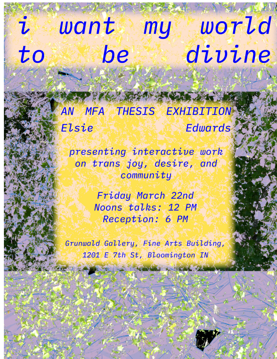
Thesis show poster, 2024