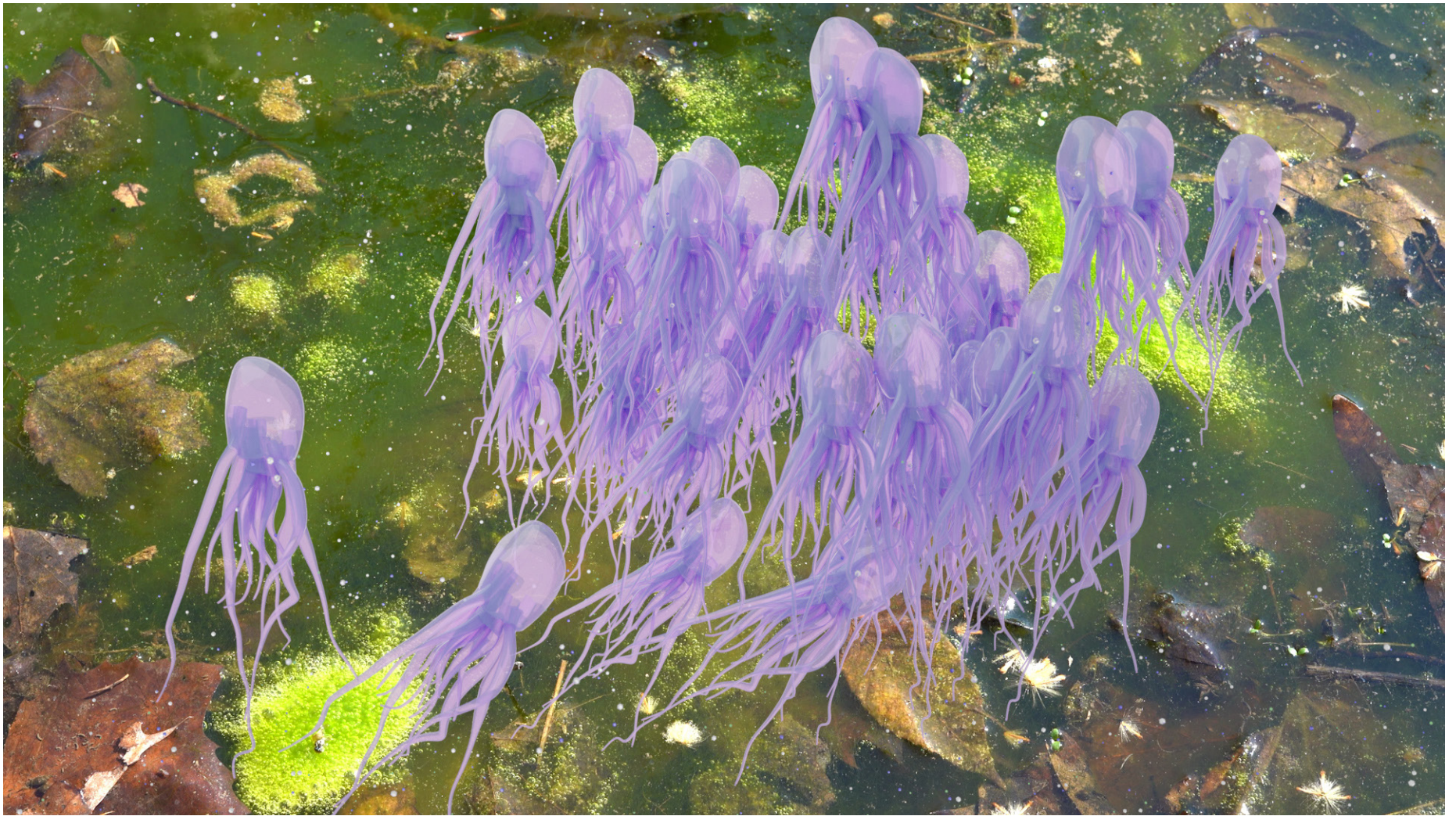
Still from “for Mom”, video, 2024 https://youtu.be/HfUyq49bn9c