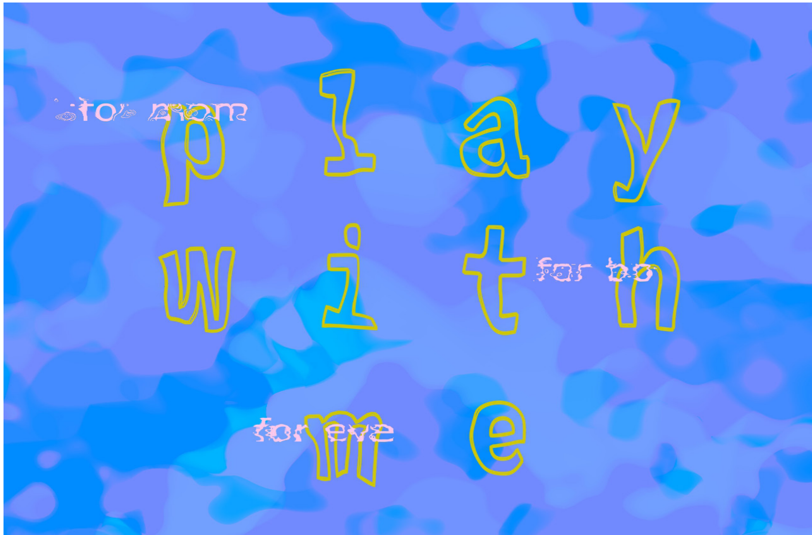
I Want My World to be Divine, procedural interactive screen, 2024