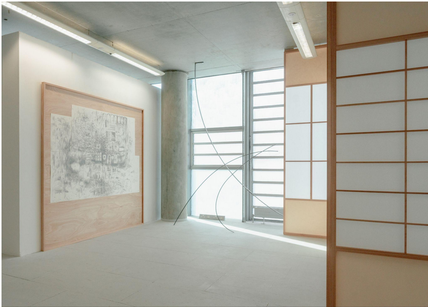
Tora, Tora (2025)