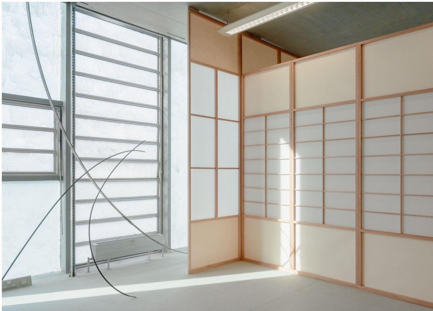
Tora, Tora (2025)