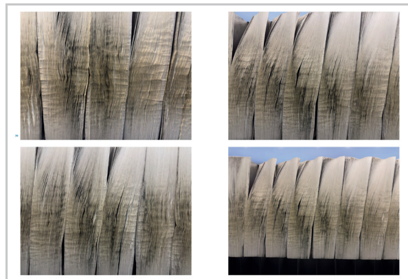
Juergen Teller Auschwitz Birkenau, 2025 Video presentation 18min35