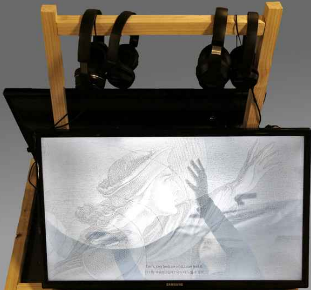
Sliding Rumors on Graduation Show in RCA, 2025