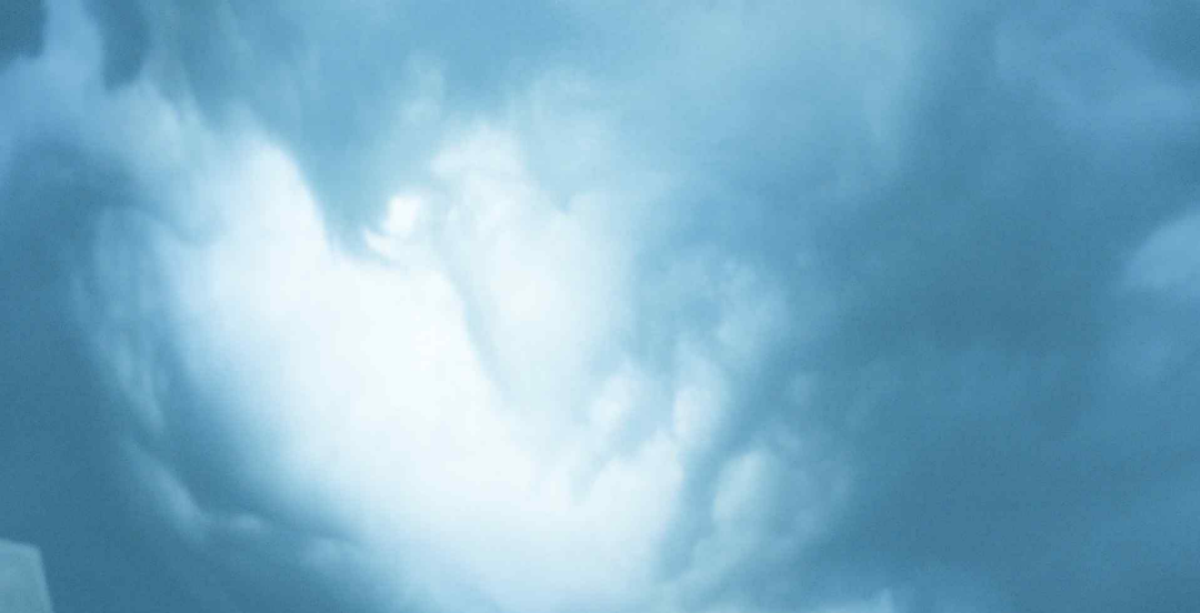
1. Sliding Rumors (Still image from video), 2025, Moving images and installation, 12'21", vimeo.com/byoungnaman We three people gather and talk about the rumors on people living far away, the rumors about disasters like the drown people on the sea.