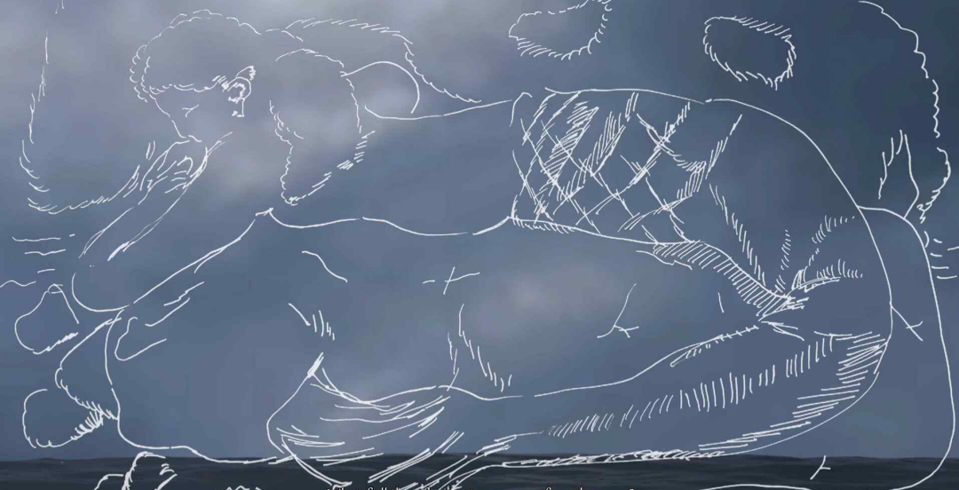
4. The Sun Erased You(a Merman Story, Still image from video) , 2025, Moving images and installation, 12'19", vimeo.com/byoungnaman A story tracking a disappeared existence, 'Old Merman' while keep asking your(a person who has back bone trouble) health and safeness.