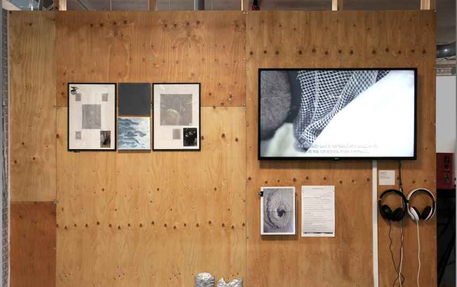
Graduation Show in RCA, 2025, Left : Frame works and paintings / Right : Still from Pfear Notes and discriptions, archives