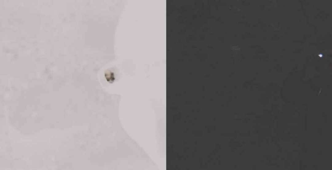
5. Whistling in Broken Two Castle(Still image from video) , 2025, Moving images and installation, 10'00" vimeo.com/byoungnaman Pigeons took the castle. This castle has the history of war. Two of us visited and whistle and make movement to recover this place temporarily.