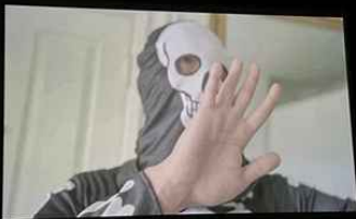
Pfear Notes[Play!] on Screening Events in Grovy Theatre in RCA, 2025