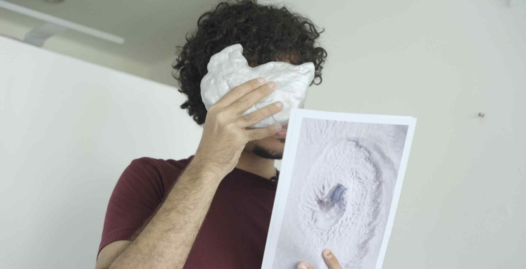
3. Pfear Notes[Sample:](Still image from video) , 2025, Moving images and installation, 15'37", vimeo.com/byoungnaman After sharing our own personal fears, connect it to community's fears and anxiety including the fear of racism, facism, failure, getting sick and old.