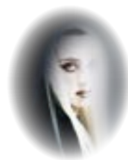
Kleid: MAXIMILIAN LÜRS