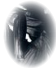
Set Jacke + Rock: MAXIMILIAN LÜRS Top: JUN TAKEUCHI Strumpfhose: ORTHOSY