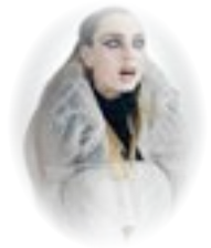
Body + Blazer: JUN TAKEUCHI Rock: VIVIENNE WESTWOOD via ZALANDO Strümpfe: JUN TAKEUCHI Schuhe: ICEBERG Tasche: VIVIENNE WESTWOOD via ZALANDO