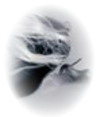
Kleid: MAXIMILIAN LÜRS Schuhe: RICK OWENS