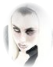
Kleid: MAXIMILIAN LÜRS